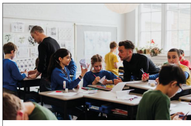
► Aim Higher mentoring is very successful

One such programme is the Aim Higher school-based mentoring programme that offers trained support and advice to 40 selected students enrolled at John Gray High School. The programme is designed for those who need help achieving their