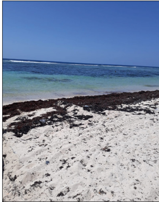
► Coe Wood Beach in Bodden Town before the clearing of sargassum