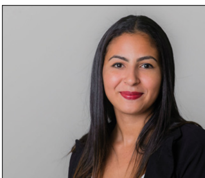
Promotions at Ogier in Cayman