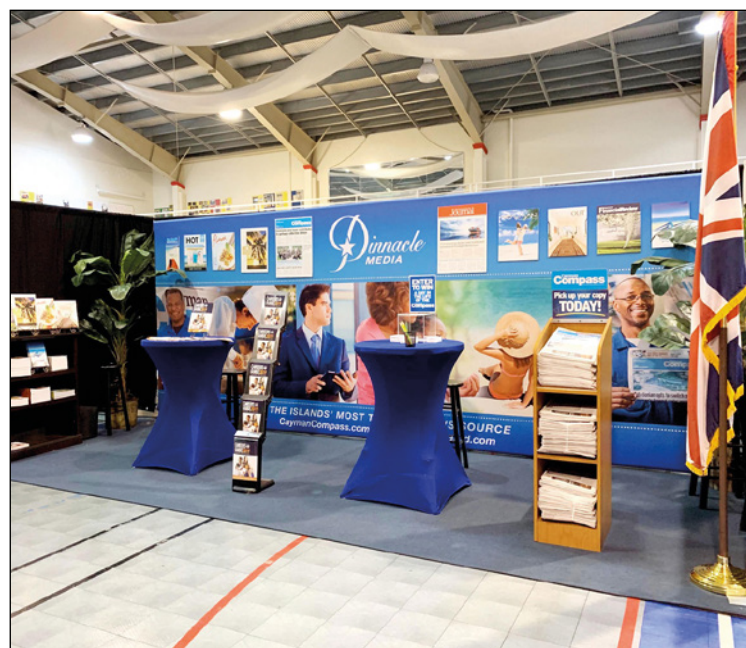
► The Cayman Islands Chamber of Commerce Expo supports aspiring students

your school year accordingly and focus on achieving the academic success needed to obtain a scholarship. Check out the social media pages of the companies that offer scholarships for the necessary information. f