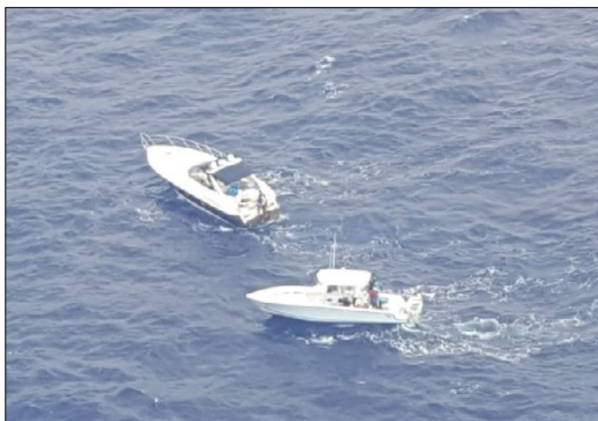
► The police helicopter assisted in co-ordinating the fuel exchange.

It was established that the vessel did not have sufficient fuel to return to the Cayman Islands. The police helicopter then returned to Grand Cayman and a private vessel was organized by the boaters, carrying the fuel needed to make the journey home.