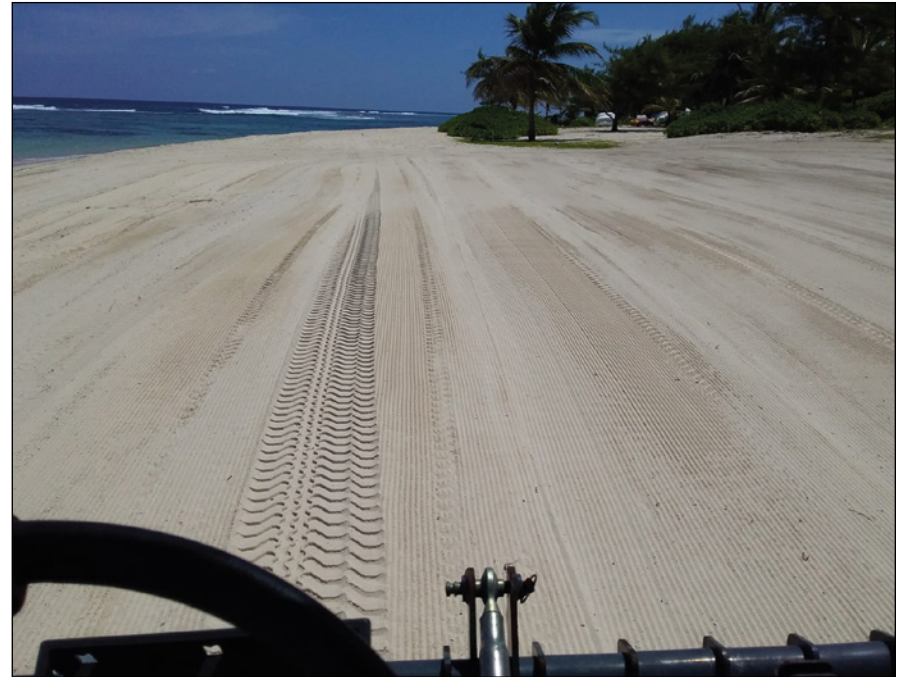
► Coe Wood Beach in Bodden Town after clear-up of sargassum

Roads Authority for the excellent work completed within the short timeframe. "Cleaning the sargassum manually is not sustainable. This approach worked well with the combination of manual la-