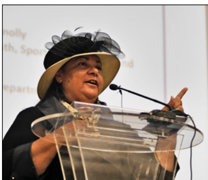
New Primary school curriculum unveiled