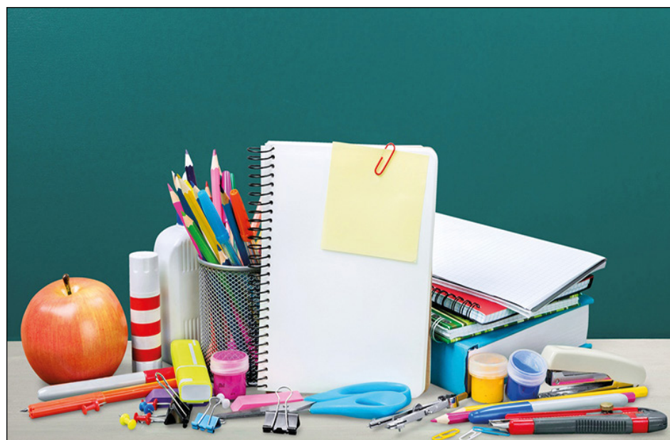
► Back to school supplies

Both parents and children are most probably starting to feel a bit anxious about returning to school. The anxiety can be reduced by planning and setting up manageable routines. f