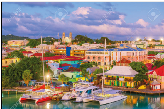
► Antigua's capital St John's is enjoying record visitors