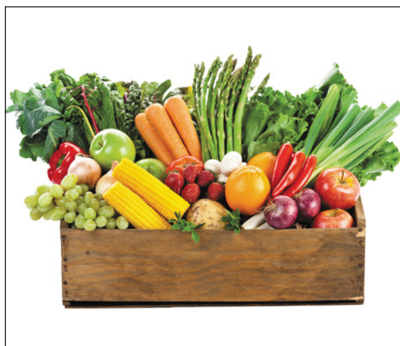
► Healthy eating is essential for young minds