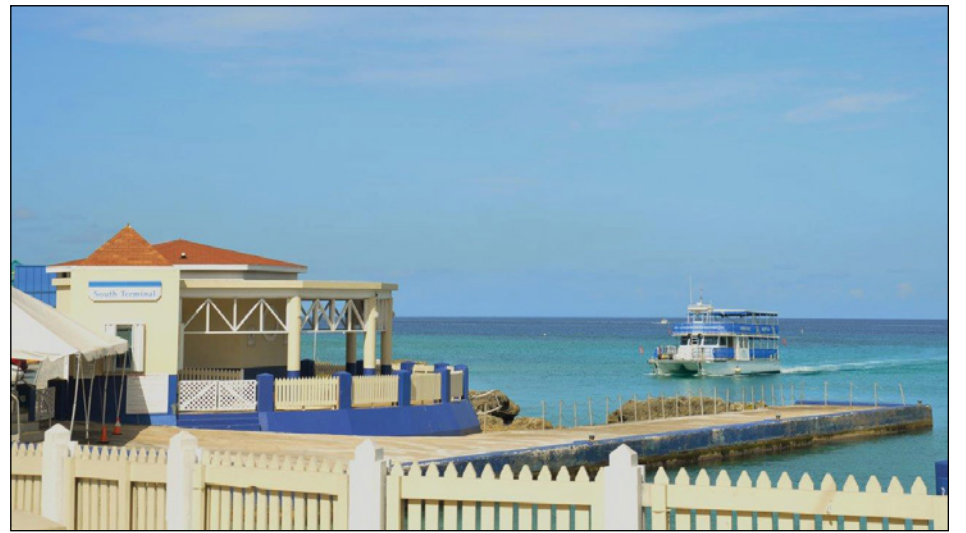
► Cayman's cruise tourists arrive by tender nowadays