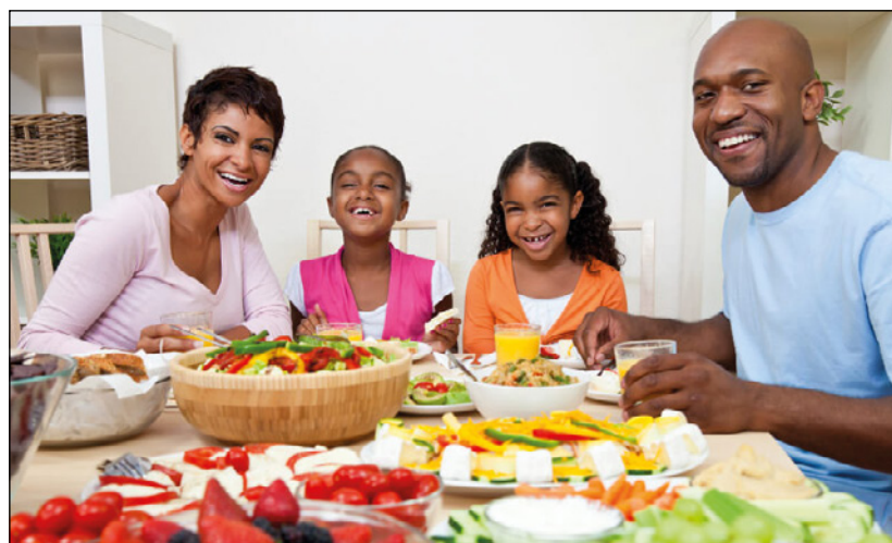
► Family meals should be nutritious