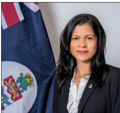
Solicitor General Appointed