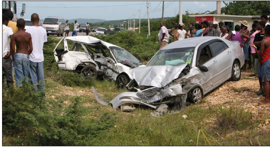
► Jamaica's road fatalities are at a record high