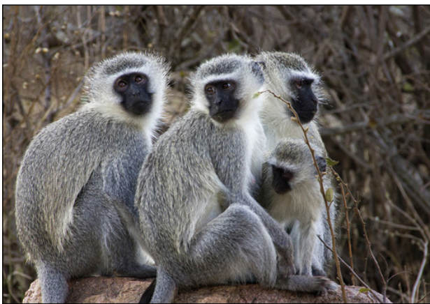
► St Kitts and Nevis crops are blighted by monkeys

With fruit trees also lost to hurricanes, the monkeys have gradually