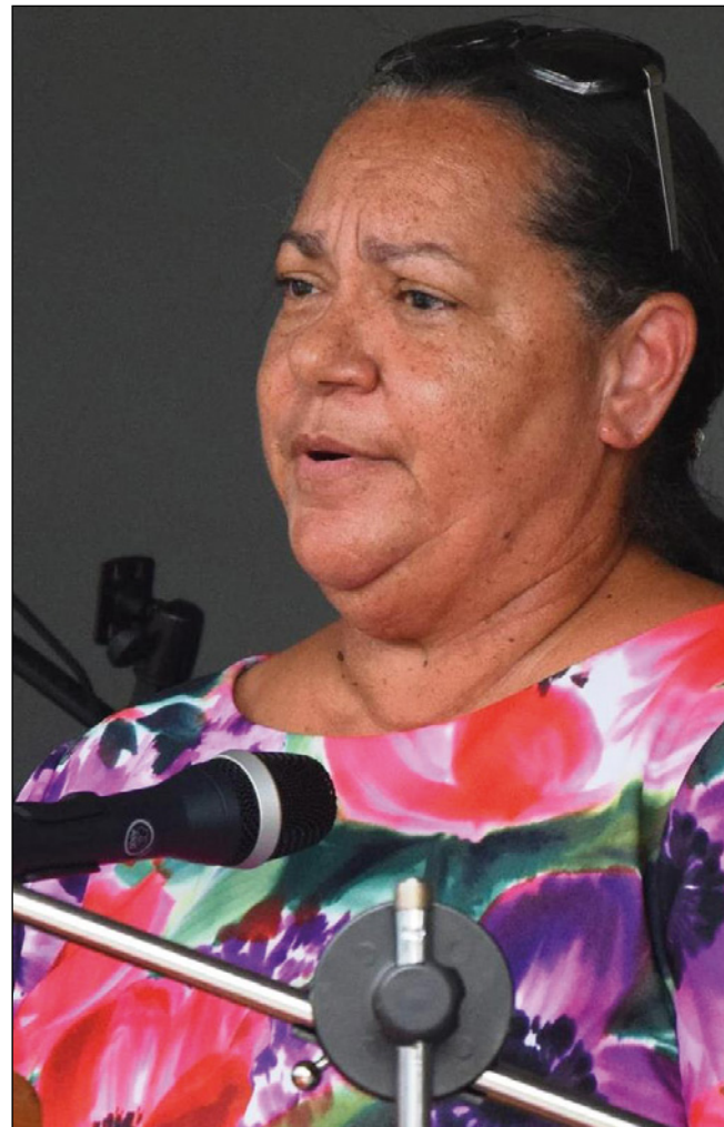
► Hon. Juliana O'Connor-Connolly