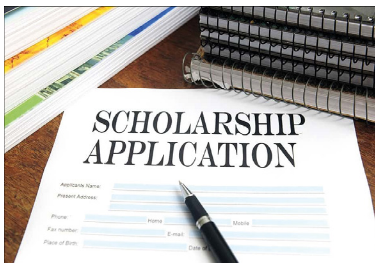
► Scholarship applications don't have to be formidable

Sometimes, students miss out because they apply too late, are unaware of the academic requirements or are simply overwhelmed by the application process. Some schools offer counseling and mentoring programmes to guide students towards their career choices. Students are advised on the appropriate courses to study and are also provided with internship opportunities. Ask if this is available at your school.