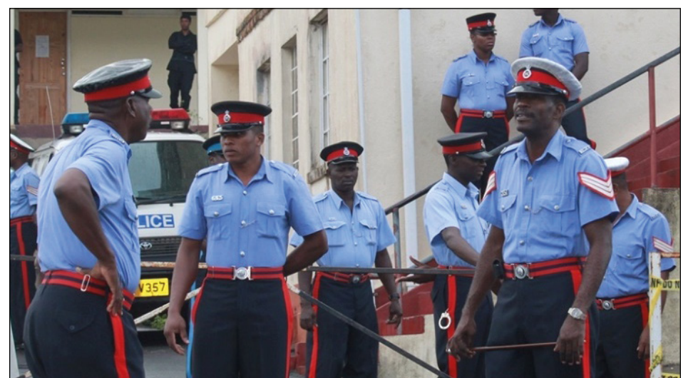
► Grenadian police are using US detection technology

The system, a key component of the United States Agency for International Development's CarISECURE project, uses standardized crime and violence data to foster evidence-based policy and programming across nine Caribbean countries, including Grenada. These countries will benefit from customized software that generates high-quality data. 🌐