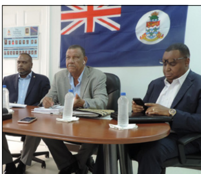
Opposition speaks on referendum and constitutional change