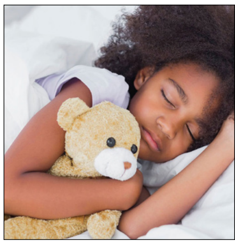
► It's time to get your child back into a sleeping routine