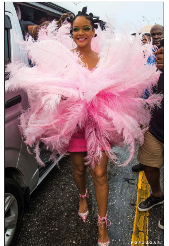
► Rihanna always attends Crop Over

10.9 percent. Germany and the United Kingdom also performed favourably with increases of 8.5 and 7.9 percent, respectively. 🌐