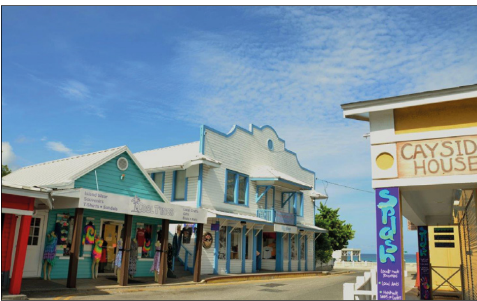
► George Town still holds on to some historic buildings

By the end of 1965 the tourism industry had become an important factor in the economy of the Cayman Islands, which will be discussed further in our next article.