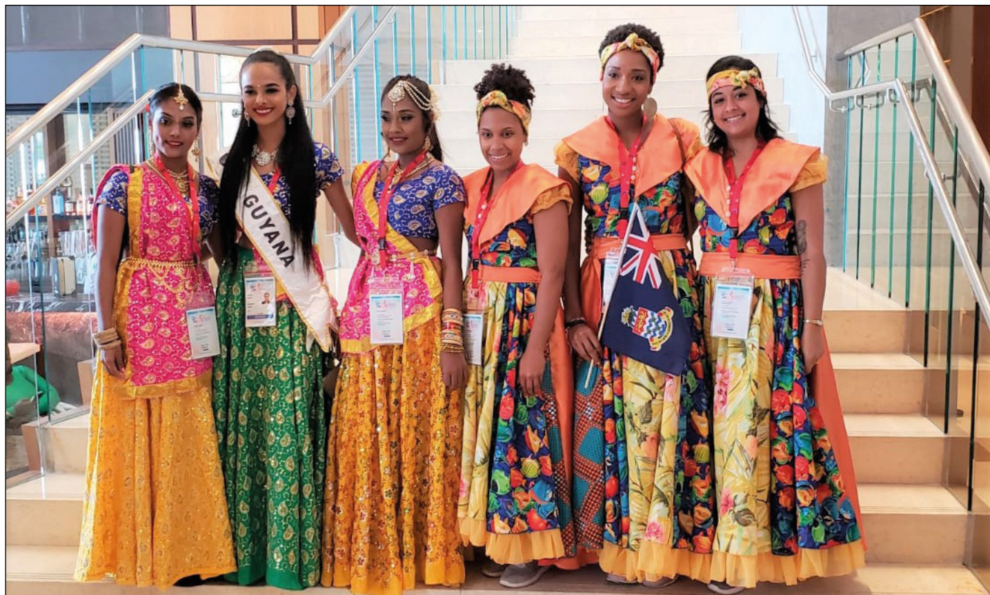
► Trinidad Carifesta is a grand celebration of culture

Trinidad and Tobago staged its biggest Carifesta events last week, a wonderful extravaganza celebrating the region's arts, music, heritage and culture. Writers, performers, poets, dancers and musicians from the region attended a diverse range of fabulous events.