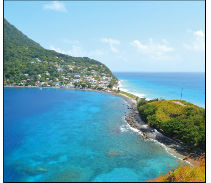
► Dominica's Scott's Head is one of its nicest attractions

Dominica excelled in terms of due diligence; ease of processing; citizenship timeline; mandatory travel or residence; and minimum investment outlay. Financial experts noted that Dominica is leading the way in terms of CBI integrity and accountability with respect to real projects for native citizens, so much so that European Union member states like