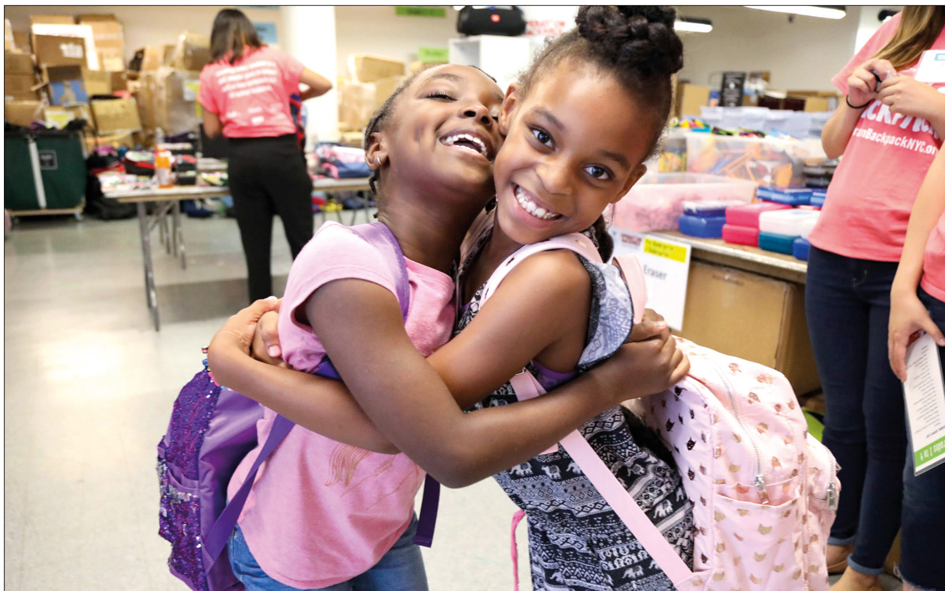
► Children should have balanced back packs