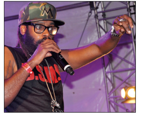
► Tarrus Riley will perform in St Lucia this weekend

"It's always such fun when I have the opportunity in my crazy work schedule to go back home and visit the island of Saint Lucia as that's where my family are from," he said. "I'm incredibly excited and honoured to be invited this year with my band to perform and