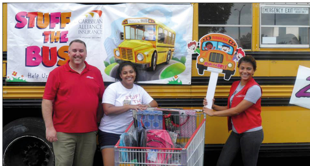
► Stuff the Bus is a great help