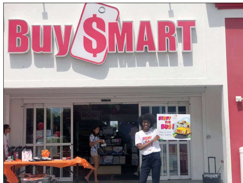
► Buy$mart is helping with school supplies

It's that time of year for parents to start buying school supplies. Having the necessary school supplies is important as they are needed for the everyday tasks that children do at school. Not having these supplies can hinder the child's ability to do their best work. It can also cause disruption when he or she must keep borrowing a pencil or a sharpener from another student. Yes, teachers may keep extra class supplies, but it is a parent's responsibility to provide the basic items.