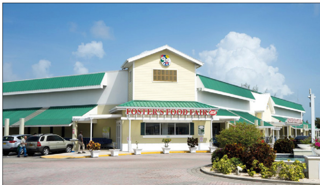
► Foster's Savannah has donation boxes