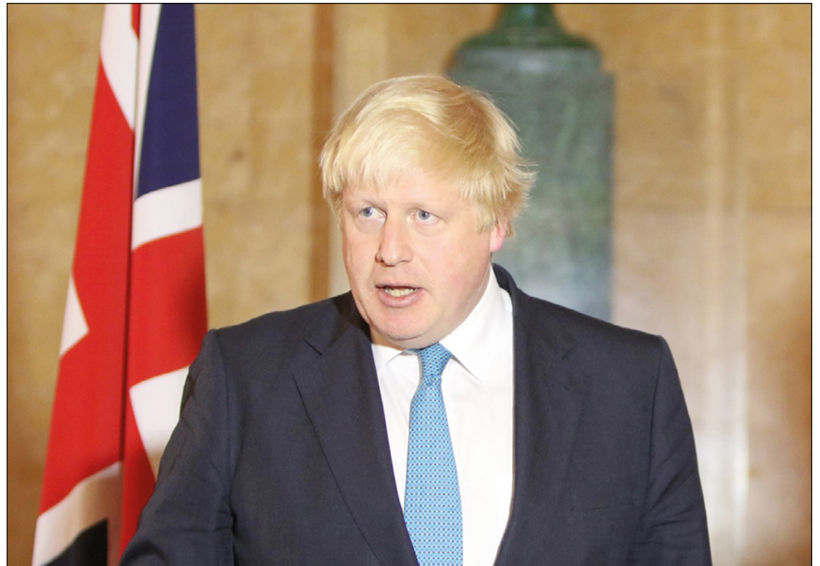
▶ Alexander Boris de Pfeffel Johnson is a British politician, serving as Prime Minister of the United Kingdom

From mainstream media, the national, regional and local press, radio, television, online via the various facets of social media, and community forums (which generally expand their audiences via social media streaming), the role of the media in this discourse is critical and proving its necessity.