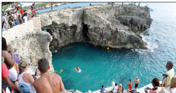
► Montego Bay is scenic but can be dangerous for tourists

For those who are still planning to visit these areas, it is recommended that travellers carry valid ID at all times, avoid going outside of resort areas after dark and walk around in groups, cooperate with local authorities and monitor