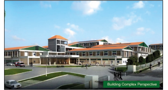
► Dominica's new hospital is in Goodwill

Mr Skerrit dismissed criticism of dealing with the Chinese because he said, "any one of us who fall sick in Dominica requires MRI, but no one will have to go