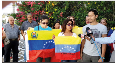
► Venezuelans in Trinidad have protested at their treatment

Some 16,500 people registered with the authorities during the two-week period, which ran from May 31. Those who