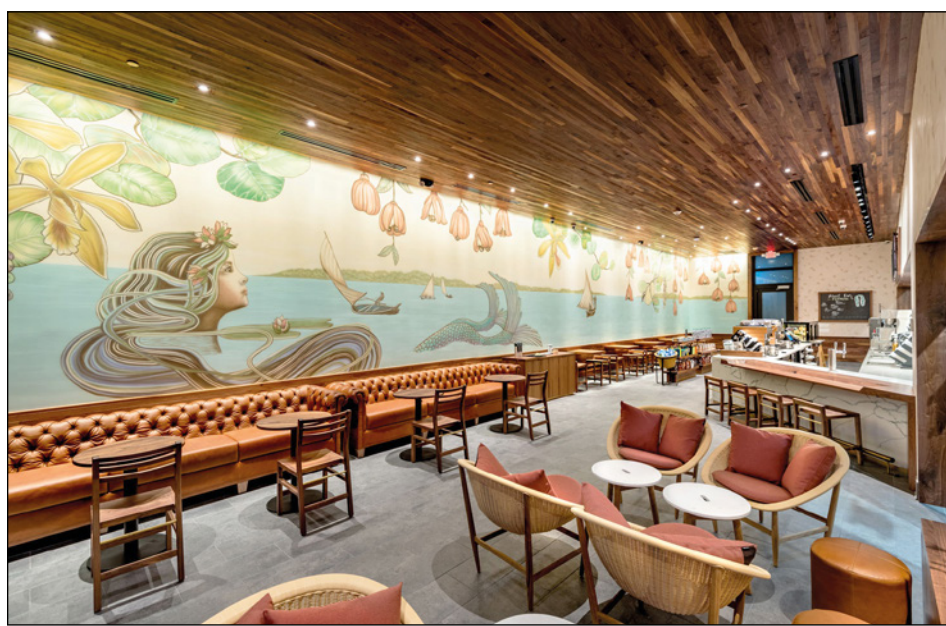
► The new location features a stunning wall mural by local artist Tansy Maki

Starbucks in Camana Bay opened its doors on 15 August, 2019 next to independent bookstore Books & Books along the Paseo. It is located near the Rise, which connects Seven Mile Beach and the North Sound, allowing seamless connectivity from "sea to sound" in the pedestrian-friendly town. 🌐