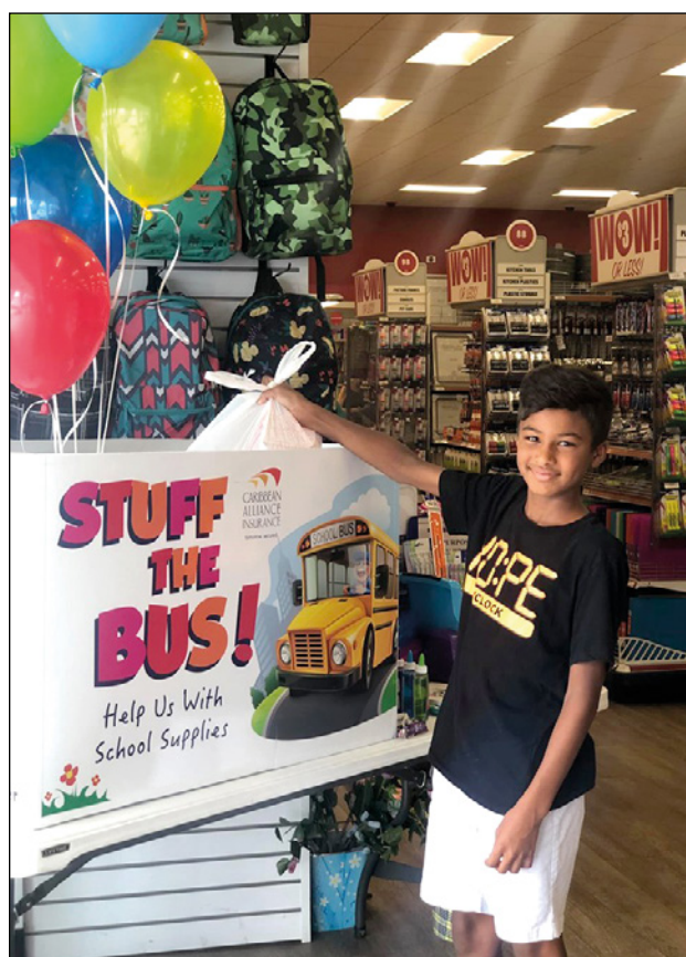
► Stuff the Bus is well supported

Schools usually send out a list for the upcoming school year. Just in case you have misplaced it, below