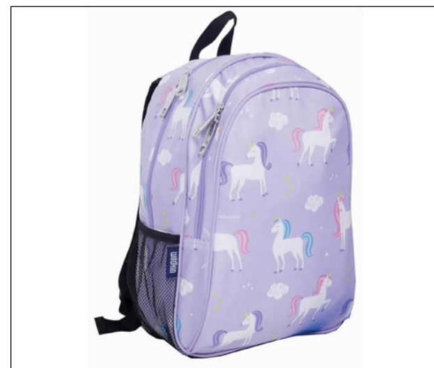
► Back packs should have wide padded shoulder straps