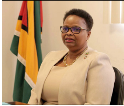
► Minister of Public Health, Volda Lawrence

PrEP, or pre-exposure prophylaxis, is an HIV prevention method. People who do not have HIV take the medicine daily to reduce their risk of getting HIV if they are exposed to the virus.