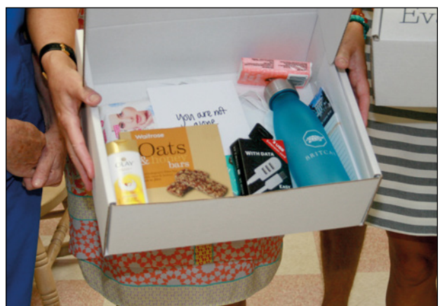
▶ Close-up of kit contents

will contain a hand-written card from Leo's parents; a packing list; a USB-charging extension cord; a note pad and pens; basic toiletries (toothbrushes, toothpaste, shower gel, shampoo, conditioner & face wipes); $100 Uber eats voucher; water bottle; granola bars and a tote bag. 📍