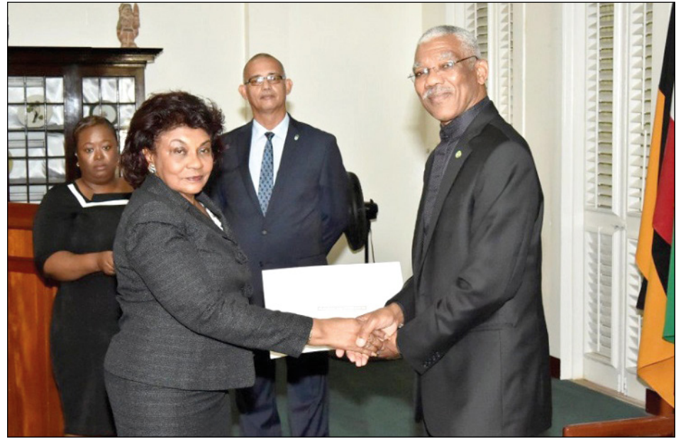
► FLASHBACK: President David Granger presenting Justice Claudette Singh with her Commission of Appointment as Senior Counsel back in 2017

The President had advised Jagdeo that he would select a chairman himself, which is provided for by the Constitution if the Leader of the Opposition fails to present a suitable nominee. But the CCJ said stressed that "an onus is placed on the President not to find a nominee unacceptable merely because the nominee is not a choice the President would have himself made; the President should only find a nominee unacceptable for some good reason on objective grounds". It was also found that the President could