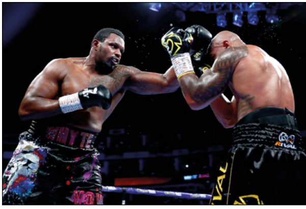
► Dillian Whyte is in line for a world title shot

Campbell said: "I think that I can knock out anyone that I hit right, I believe that I am one of the biggest punchers in the lightweight division. This is going to be the toughest fight of my life and I'm preparing for it, physically and mentally. This is Luke Campbell's year, it's my time." 🌐