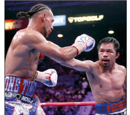
Pacquiao defies the odds again