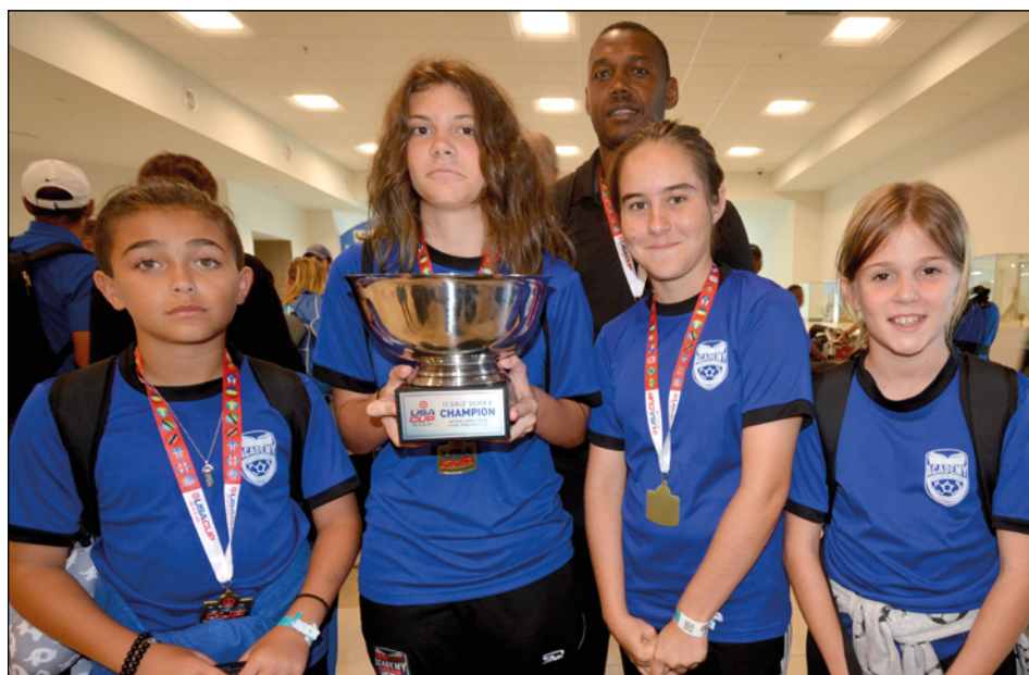
▶ A group of Under 12 Girls proudly hold their silver cup, with one of the dads