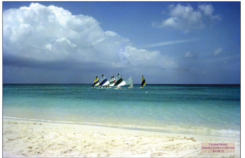
► Regatta, start of Sunfish Boat Race, in front of Beach Club, 1967