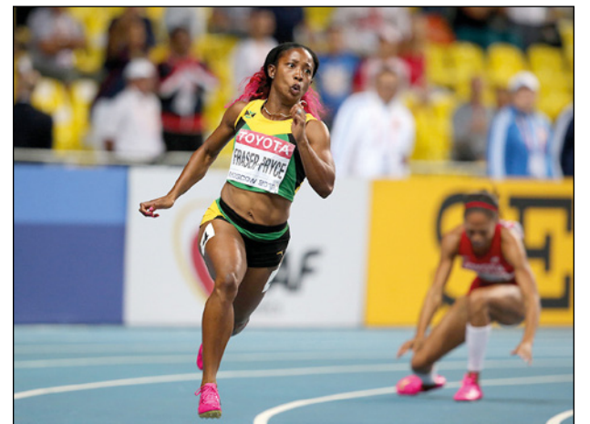
► Shelly-Ann Fraser-Pryce is back to her best

No Americans were in the 100m field at the London Stadium because their world championship qualifiers are coming up this week. 🌐