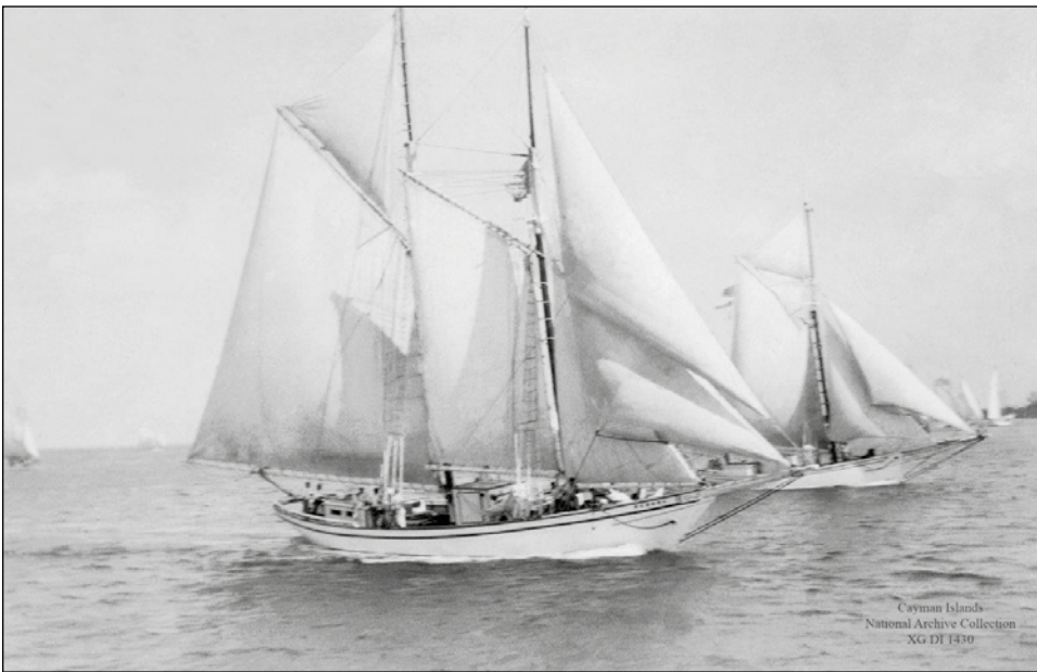
► Cayman Islands Regatta 1935. Schooner Rembro, trawl Caymania, Cayman Islands Yacht and Sailing Club