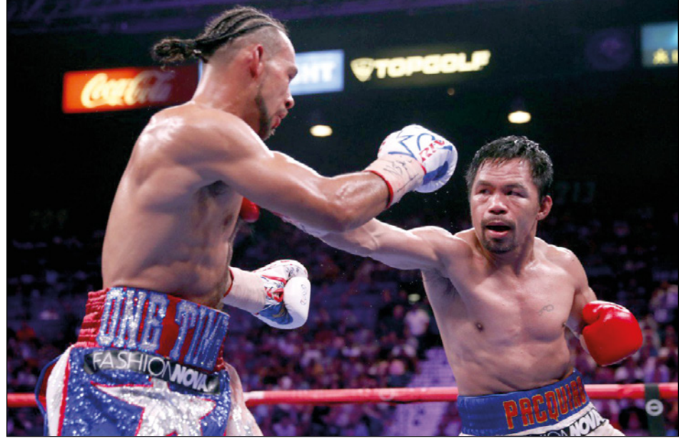
► Manny Pacquiao, right, is still a force at 40