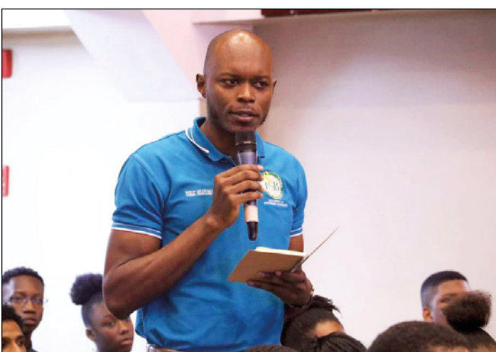
► President of Southern University Student Council