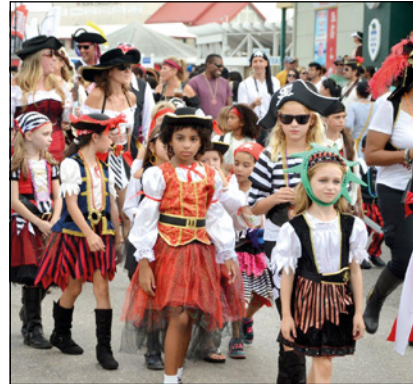
Then and Now: Celebrations