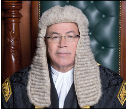
Speaker Bush Addressed Youth in Trinidad