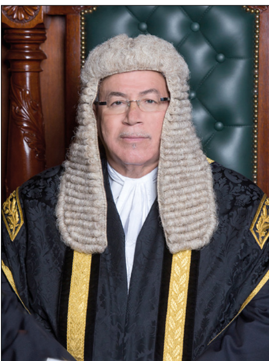
► Speaker Hon. McKeeva Bush, at the CPA Roadshow, where he addressed youth

The Speaker added, "If you have ideas about becoming a Member of Parliament, most of all you must be willing to serve and appreciate and genuinely care for people. That will be your best tool in getting the people to support you, when they see and feel that they can put their trust in you." 🌐