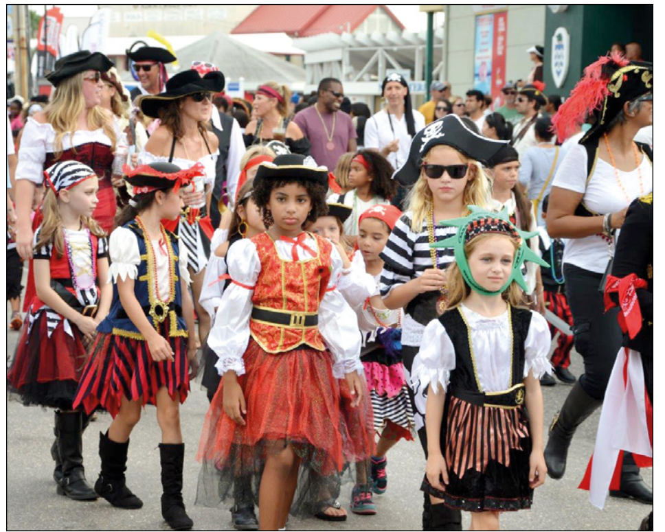
► Pirate's Week is loved by young and old

The regatta paused for a few years, until it was reinvented as the Easter Regatta in 1964. The foreword in the 16th Galleon Beach Easter Regatta commem-