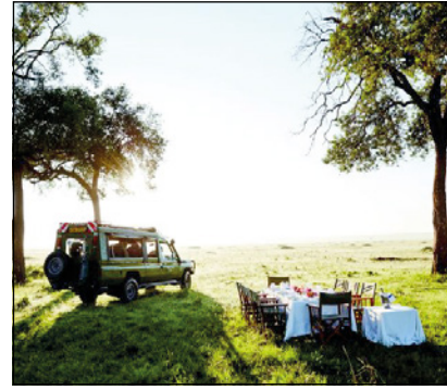
Travel Trends: Embracing the Rise of Experiential Travel