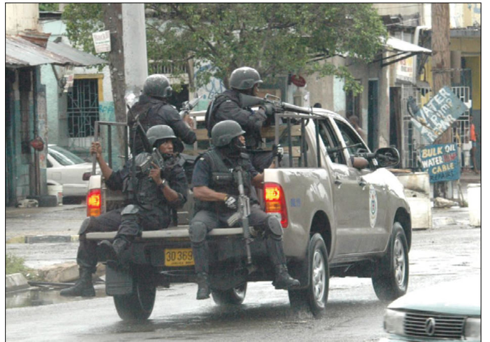
► During the States of Emergency, the security forces will have the power to search, curtail operating hours of business, restrict access to places and detain persons without a warrant

The House approved the 90-day extension of the SOE for the St Andrew South division. That SOE — which gives the security forces temporary additional