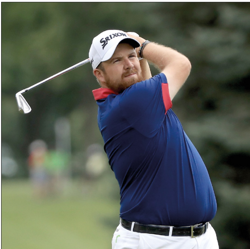
► Shane Lowry surprised himself with his Open win