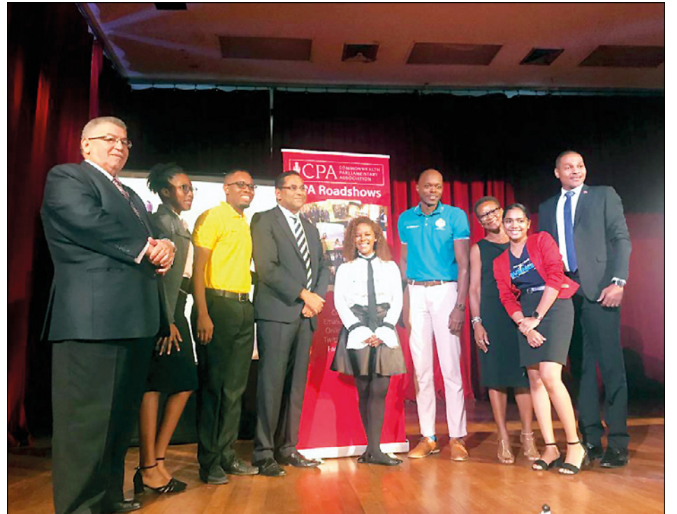
► A section of the audience at the CPA Roadshow

"In contrast to thinking, well in the past, that the Speaker can't speak at all, there is many a dispensation that brings the imperative of a Speaker in today's world speaking for or against a matter that affects his constituents," he commented.