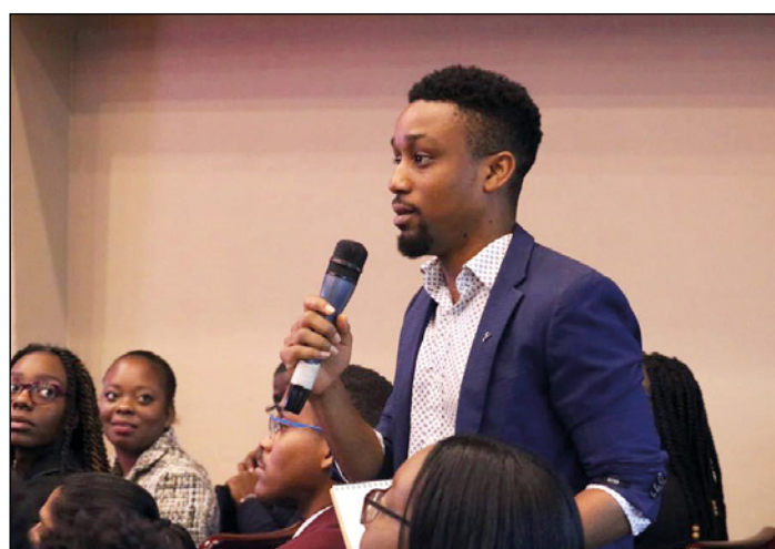
► Student asking question