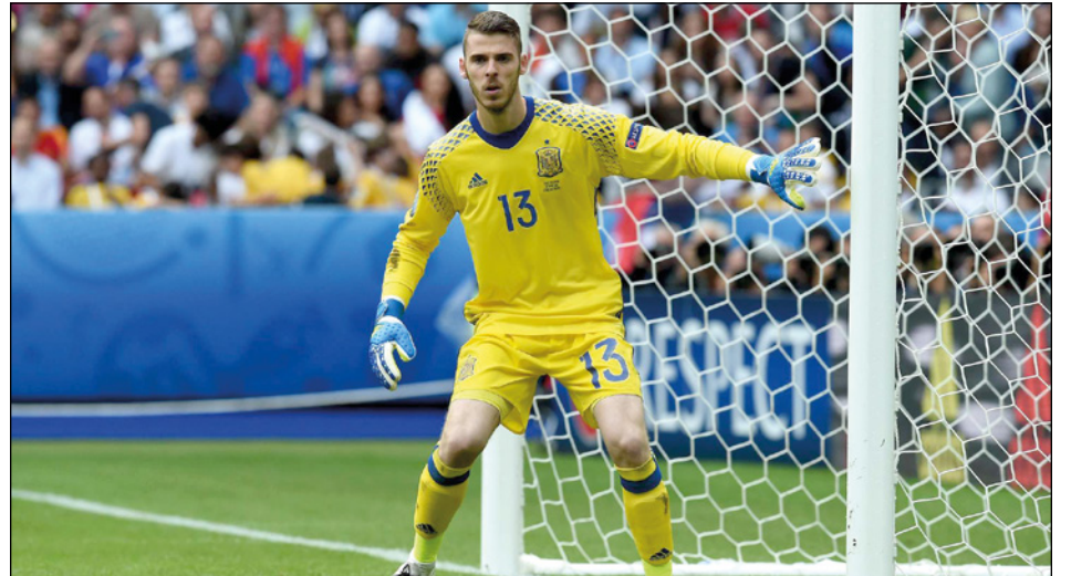
► David de Gea is in the money

Sheffield United and Aston Villa are both interested in signing Brentford