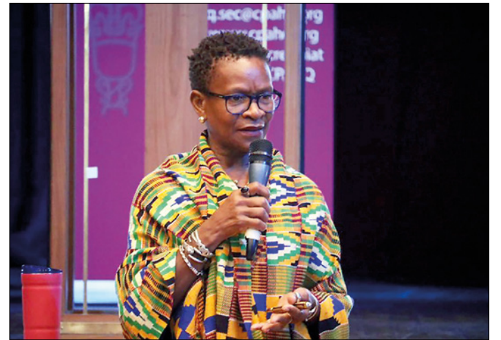
► Montserrat House Speaker Hon. Shirley Osbourne

bers must abide by as well as the rules which govern the business of the House.