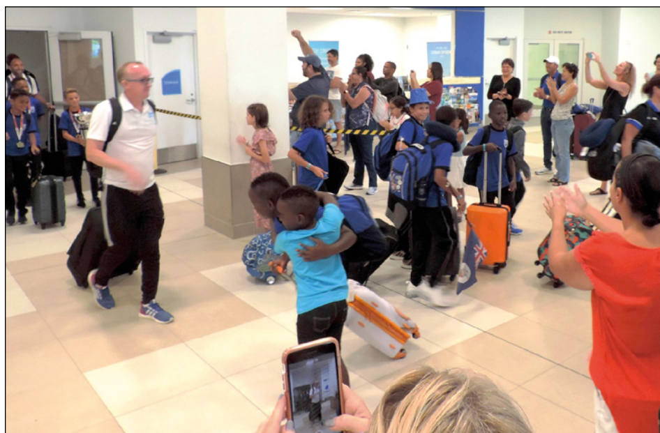
▶ The champions come home