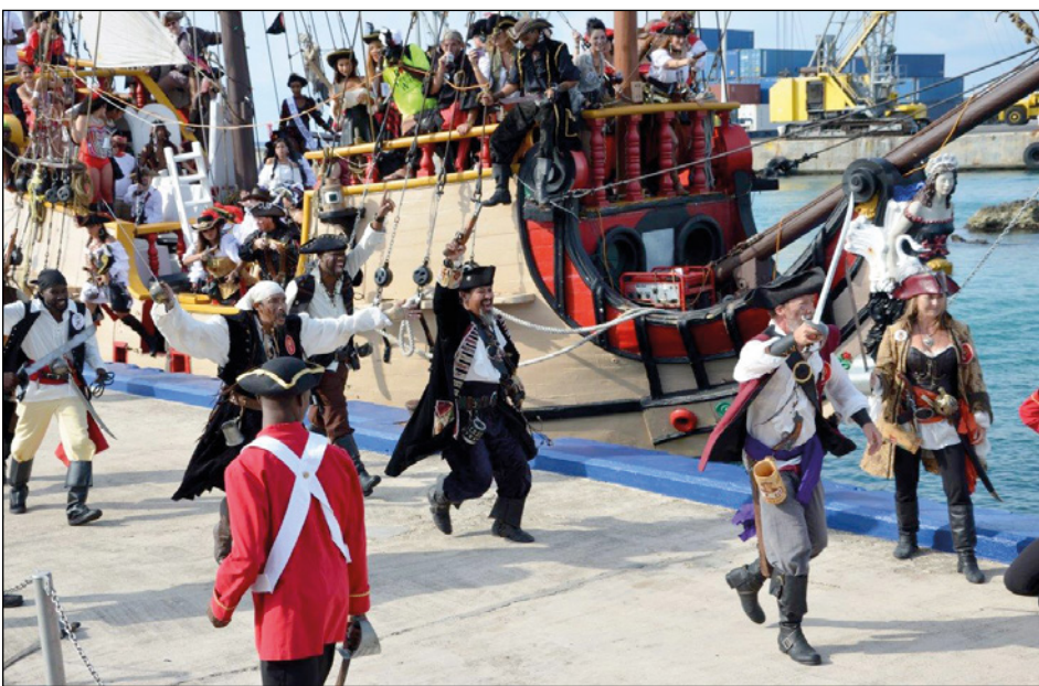
► The annual Pirate's Week invasion

The event centres on the traditional mock invasion by pirates, followed by the 'capturing' of the Governor while pirates run amok before being cast off again for another year. It's a highly popular spectacle that's always well-attended by visitors and local residents alike.