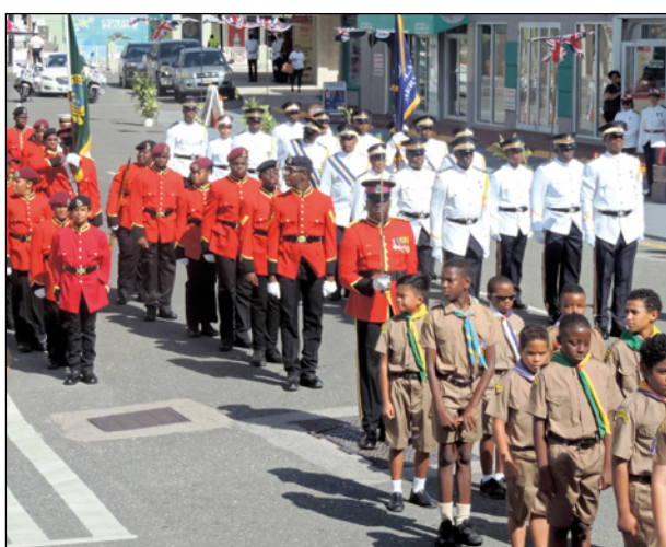
► The uniformed detachments march past