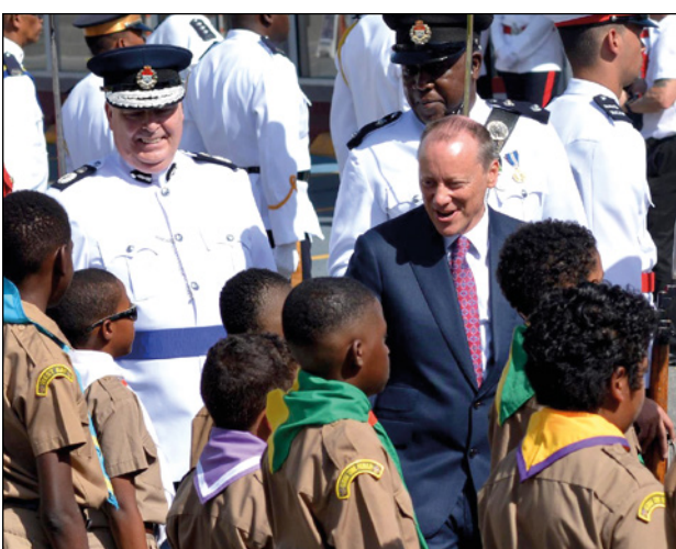
► Inspecting the uniformed detachments