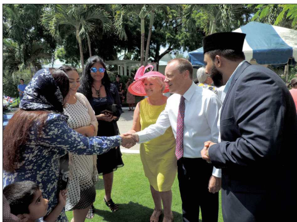
► The Governor thanked and greeted a group of volunteers from Celebrate Cayman

ernor was to learn, and said he was one of his most attentive students. 🌐