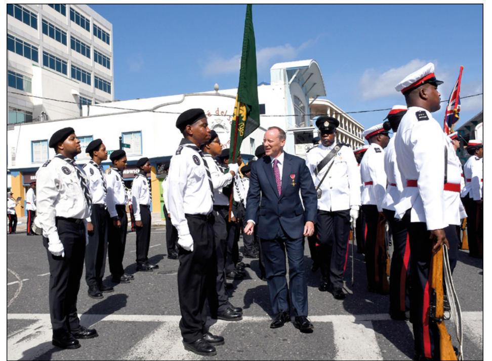
► The Governor inspects the Guard of Honour formed by the parade contingents