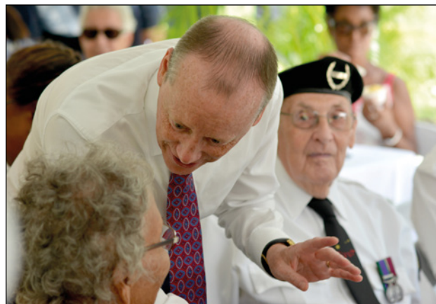
► Meeting some seniors and veterans

ernor was to learn, and said he was one of his most attentive students. 🌐