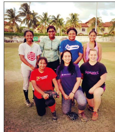
► Little League Alumni Night

The girls softball season will officially conclude with a social for all three teams on Wednesday, June 12th. It is also hoped that the girls will continue training over the summer months and into the new school year. Any girls ages 11-18 interested in joining should send an e-mail to cilla.girls.softball@gmail.com .