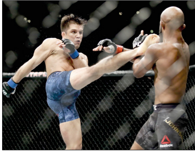
► Henry Cejudo is dominant in UFC's lower weights

"No, I'm not champ champ, ladies and champion. My name is 'Triple C'.