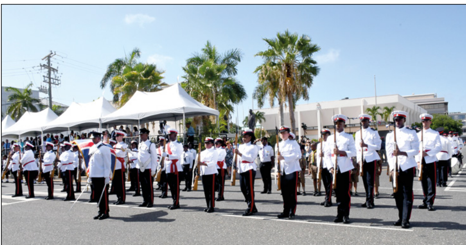
► Royal Salute