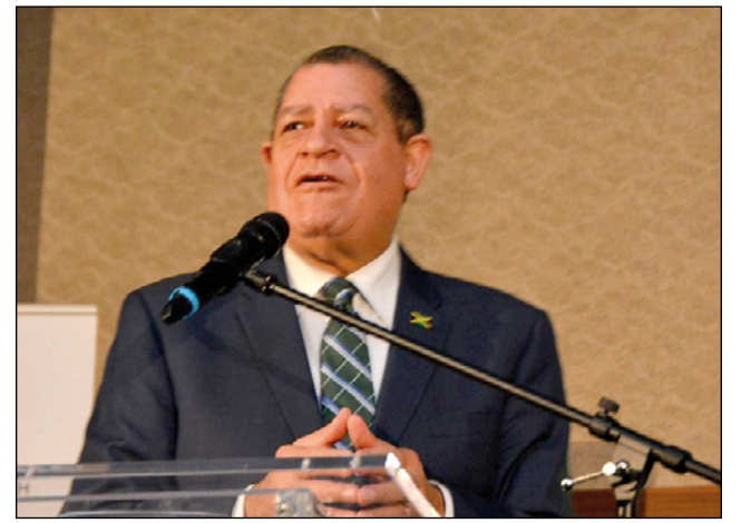
► Minister of Industry, Commerce, Agriculture and Fisheries Audley Shaw

"Today, we have over 35 licences issued spanning cultivator, retail, processing and research and development. More broadly, we have 600 applications to date that include 190 applications at the conditional approval stage and another 367 at desk review and verification stage," he pointed out.