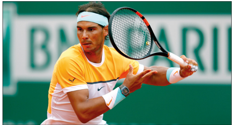
► Rafael Nadal has an enviable record on clay

If the 37-year-old Swiss doesn't win another major, Nadal could get to 20 just by racking up more victories at Roland Garros. But only if his body holds up. 🌐