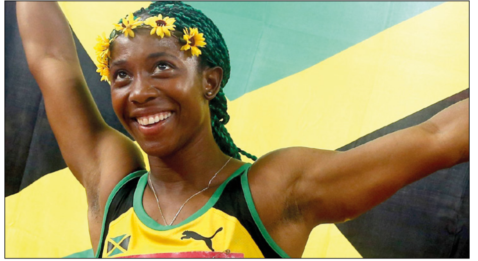
► Shelly-Ann Fraser-Pryce wants a fourth world title