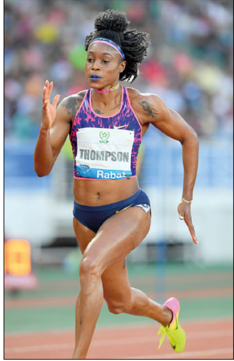
► Elaine Thompson is in sparkling early season form

Fraser-Pryce produced her usual bullet start and sped away for an effortless victory, to rapturous applause from the appreciative crowd at the National Stadium in Kingston on Saturday.