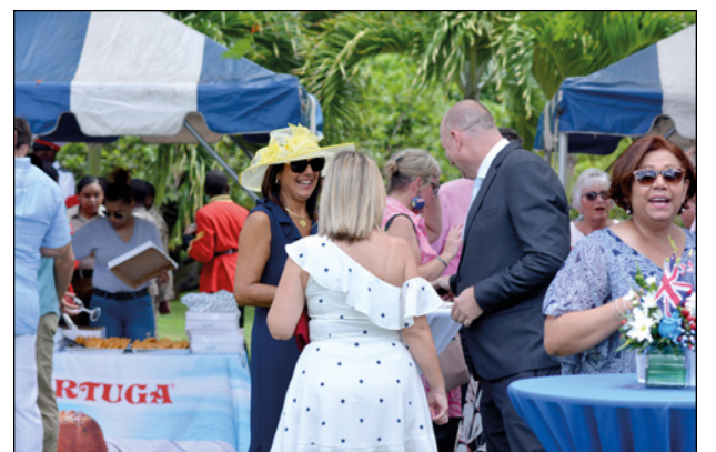
► It was a friendly atmosphere