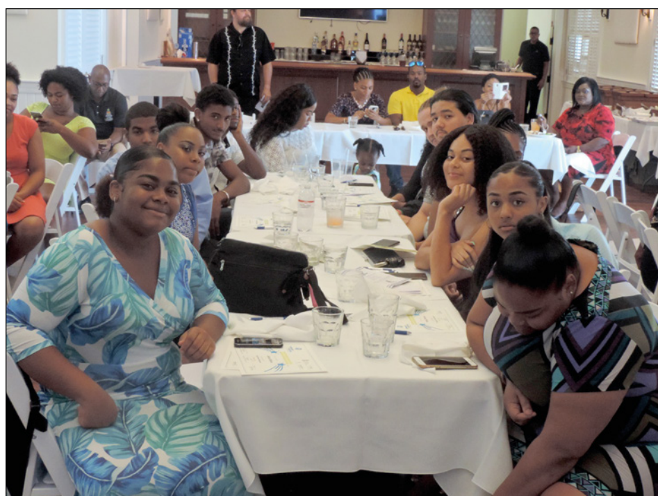
► All the Passport2Success graduates

I can say the program has changed me and has changed my attitude to other things." 🌐