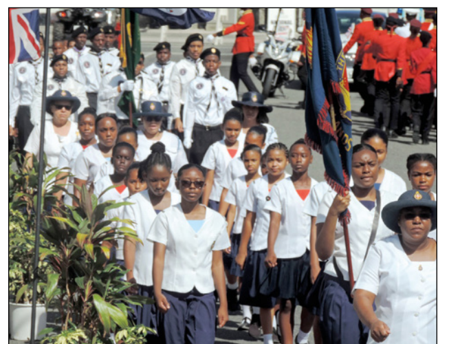
► The Girls Brigade