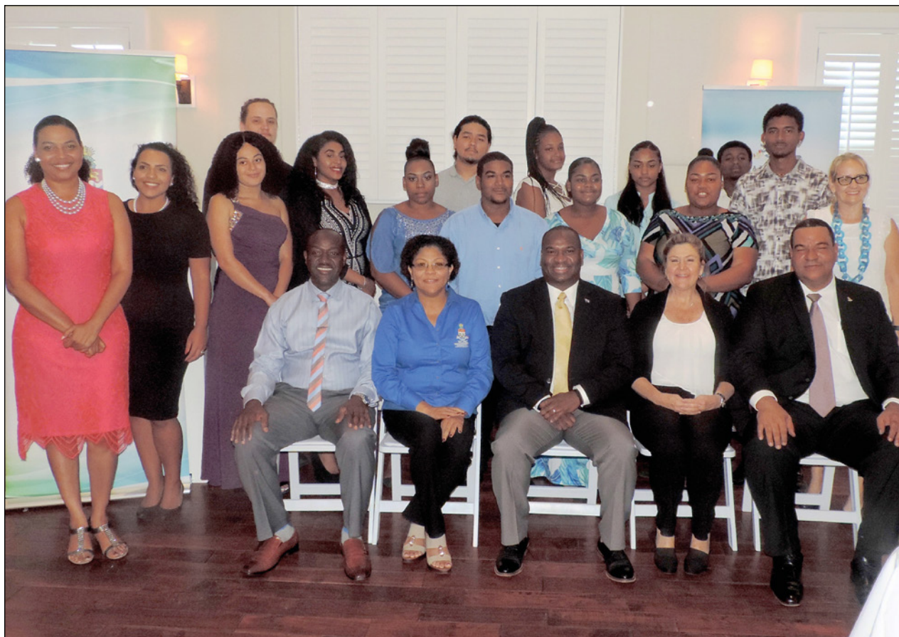
► Passport2Success: All 12 graduates, pictured with all the people who made their success possible