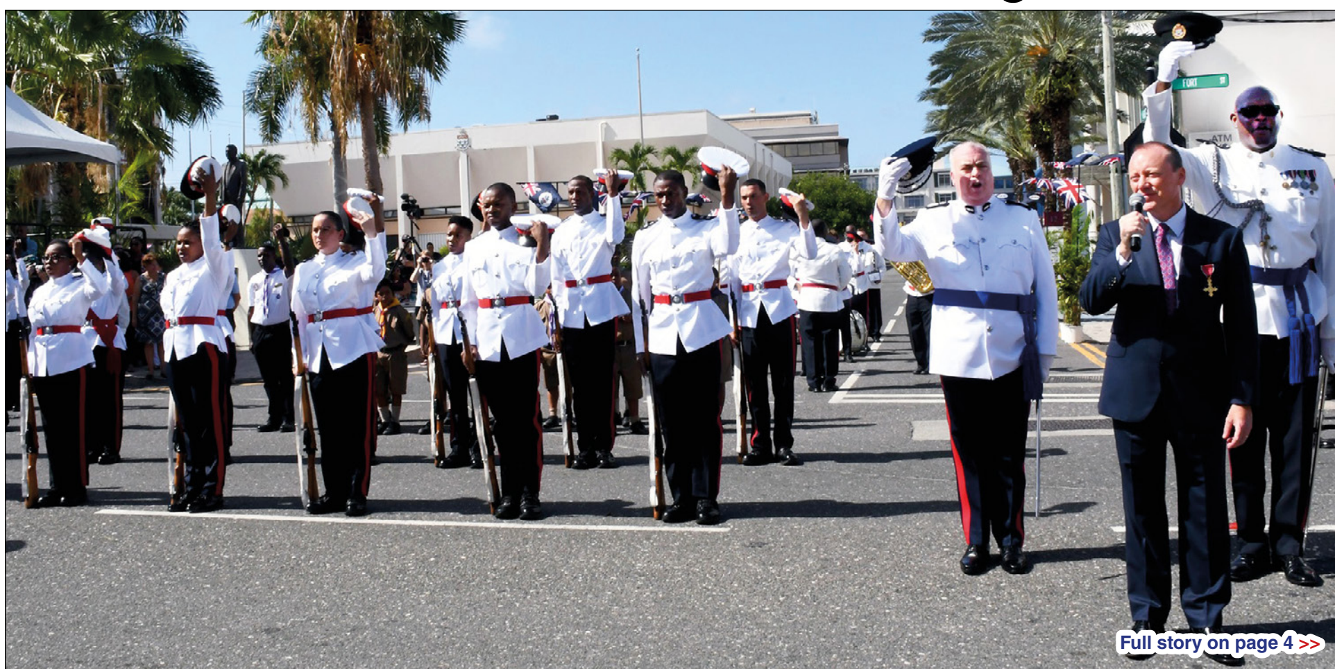
Full story on page 4 >>