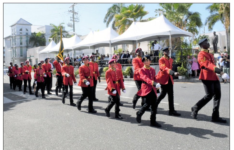
► Cadets March