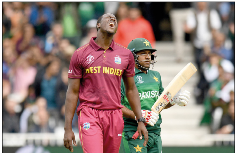
► Carlos Brathwaite was frustrated by questionable decisions

West Indies captain Stafanie Taylor called her side's fielding on Thursday "atrocious". Three days later there were huge improvements - the tourists fling-