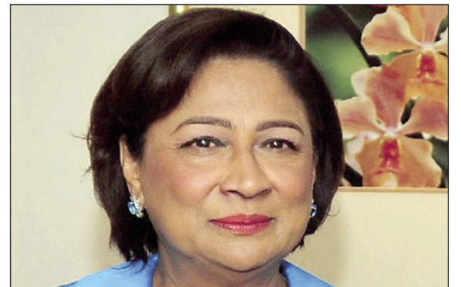
► Commissioner of Police Gary Griffith said the small amount of ganja found on Kamla Persad-Bissessar's premises could not be attributed to her

"The party commends the Commissioner for finally clearing the air on this [marijuana] matter, which first surfaced four years ago in June 2015 - an election year," the UNC said in a statement, adding that it "hoped that similar resources will be deployed into the investigations" involving Petrotrin and A&V Oil.