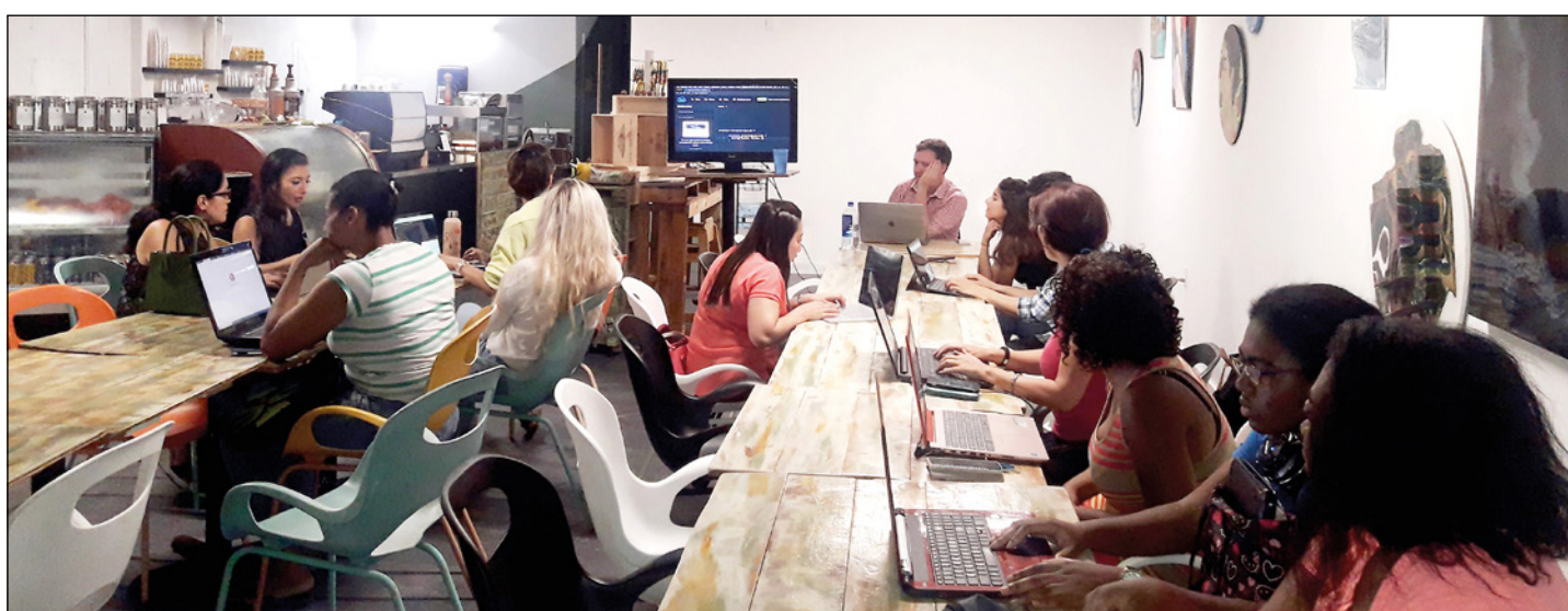
► Women Code Cayman class participants

For further information, go to http://women.codecayman.com/ .