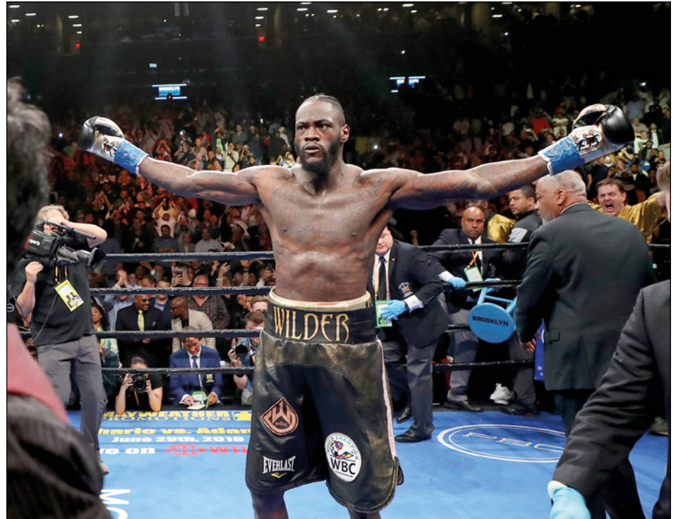
► Deontay Wilder looked devastating in his latest fight

Wilder, who drew with Tyson Fury in his previous fight in December, is adamant they will come face to face in the ring, telling Sky Sports: "It will happen. I believe in all my heart it will happen." But he did admit that he has "obligations". 🌐