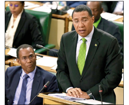
► Prime Minister Andrew Holness

"It is planned to install a 10-inch diameter pipeline at a cost of US$5 million. Then we will have to do Six Miles to North Street, and that will see the installation of 12 kilometres of varying-size