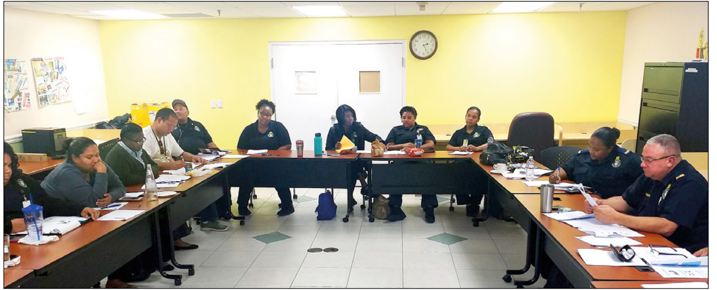
► A group of Customs and Border Control (CBC) officers undergo training at the CBC Office on Airport Road as part of five one-day educational workshops