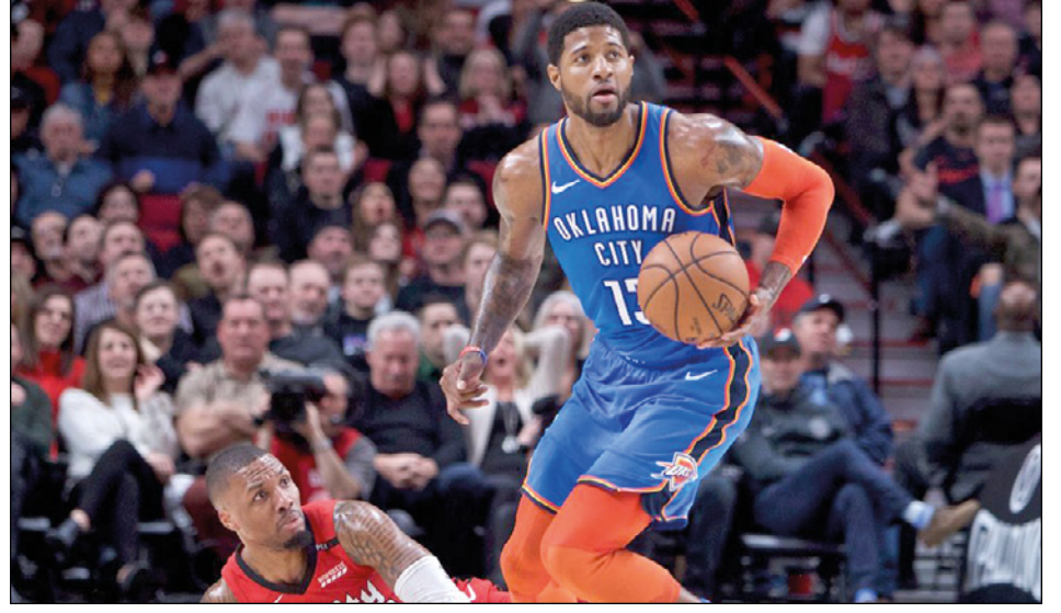
► Paul George had a brilliant season with Oklahoma

Nevertheless, George finished first in steals with a career-high 2.2 per game and is viewed as one of the best two-way players in the NBA. He led the NBA in deflections (3.8) and loose-