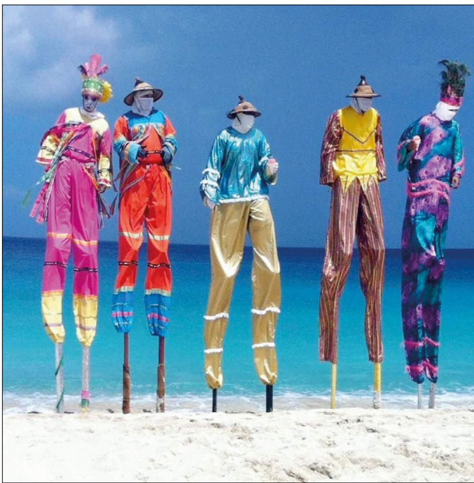
► Moko jumbie stilt walkers will be at Caribbean305

General admission tickets are $75 online - $100 at the door - and include access to the event from 8-11pm with an all-inclusive experience of unlimited drinks, food and entertainment.