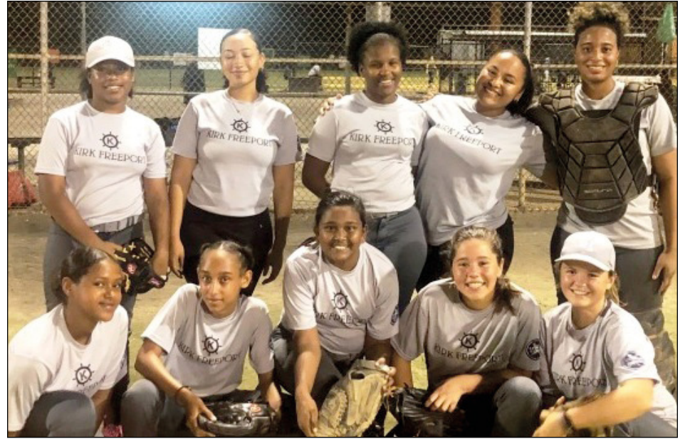
► Kirk Freeport - League Champs