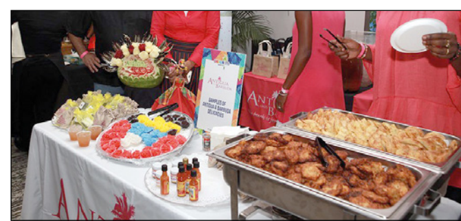
► There will be a fine selection of food and drink