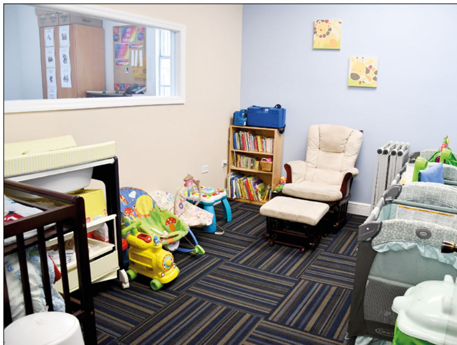
► The FRC’s new nursery at their offices in the West Apollo Building, Mary Street, George Town