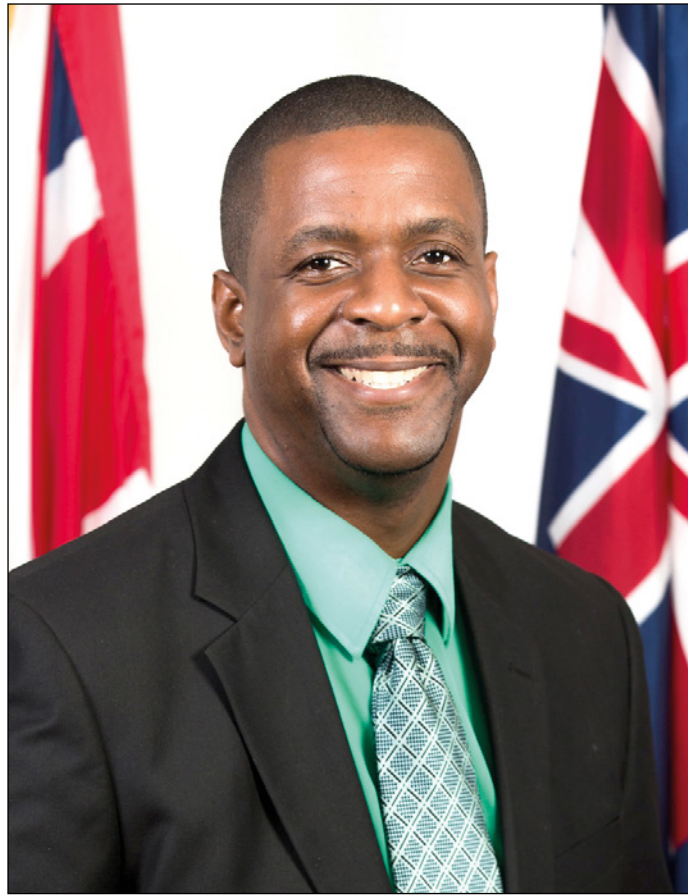
► Andrew Fahie, The British Virgin Islands Premier

But, in launching his government's 'regularisation plan' for non-belongers on May 7th, Premier Fahie sought to allay concerns about the assumed implications.