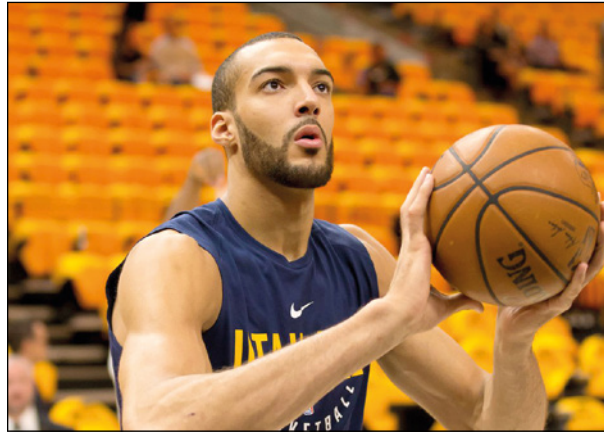
► Rudy Gobert is one of the Defensive Players of the Year

"He's a guy that reminds me of a Mark Eaton, Dikembe Mutombo, Alonzo Mourning," Hall of Famer Charles Barkley said of Gobert. "If you're a great player, I don't worry about one guy stopping me. But if you're playing against a great shot blocker, you have to know where he is. Because even if you beat your man, you know have to beat two guys." 🌐