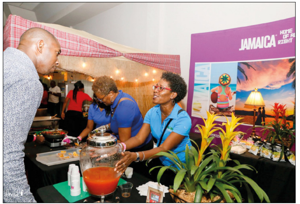
► The Jamaican stand is always popular