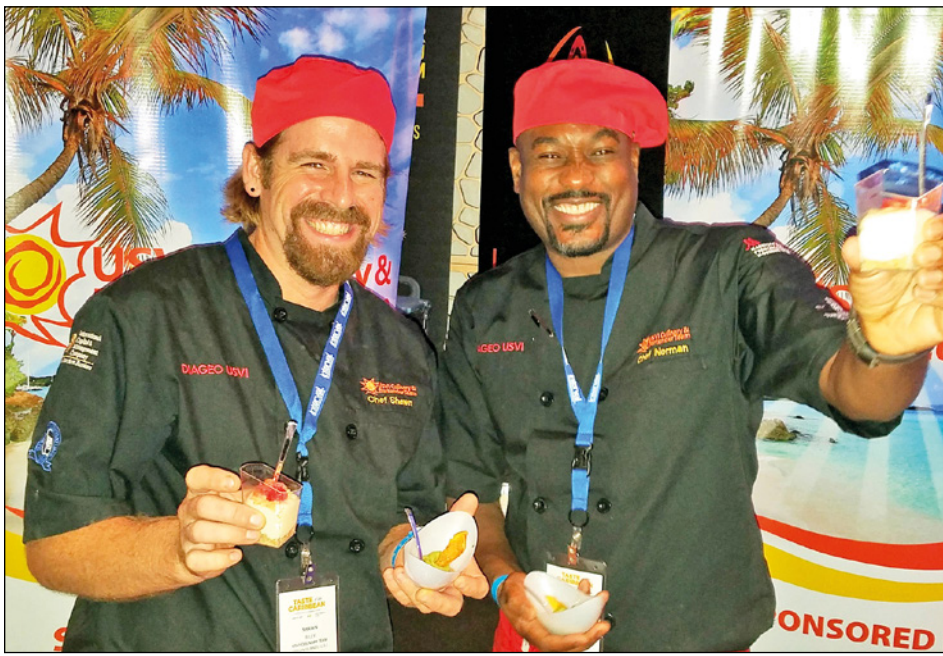
► USVI reps having fun