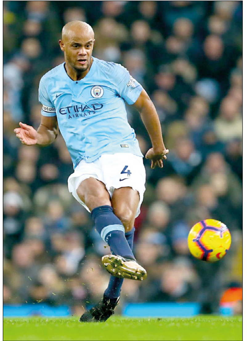
► Vincent Kompany had tremendous success at Man City

He scored his final goal against Leicester on May 6, a brilliant strike from 25 yards that was voted goal of the season on BBC Match of the Day.