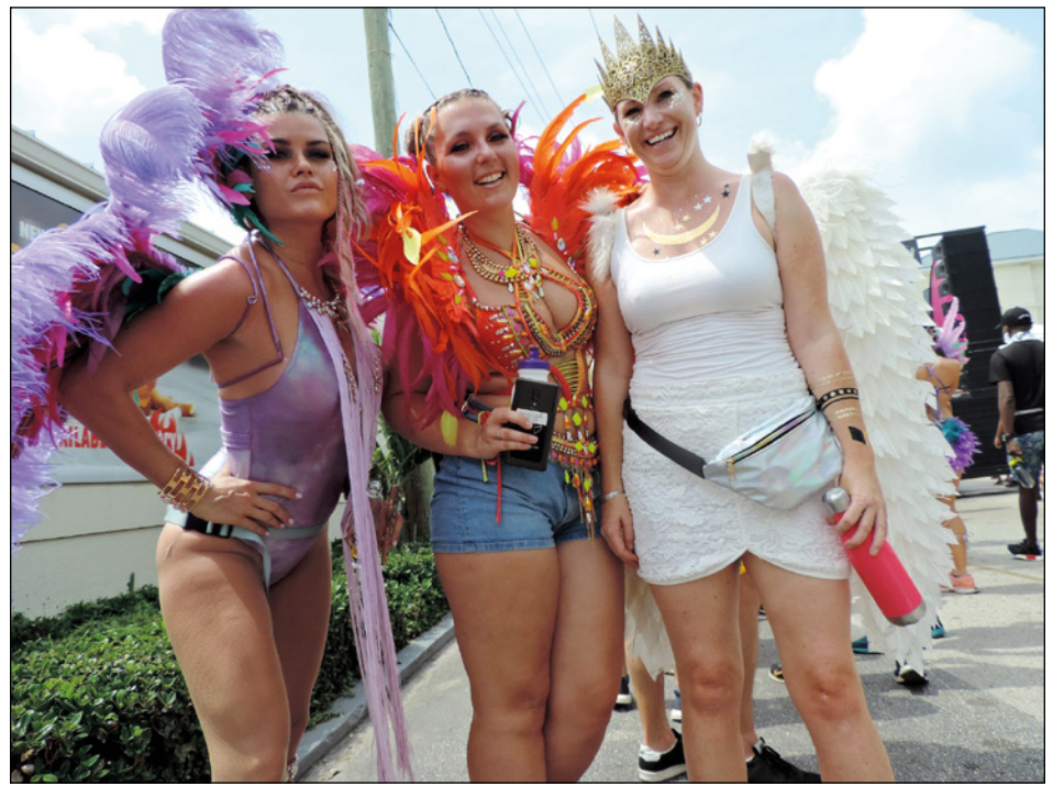
► CayMAS carnival was an explosion of color, music, costume and fun