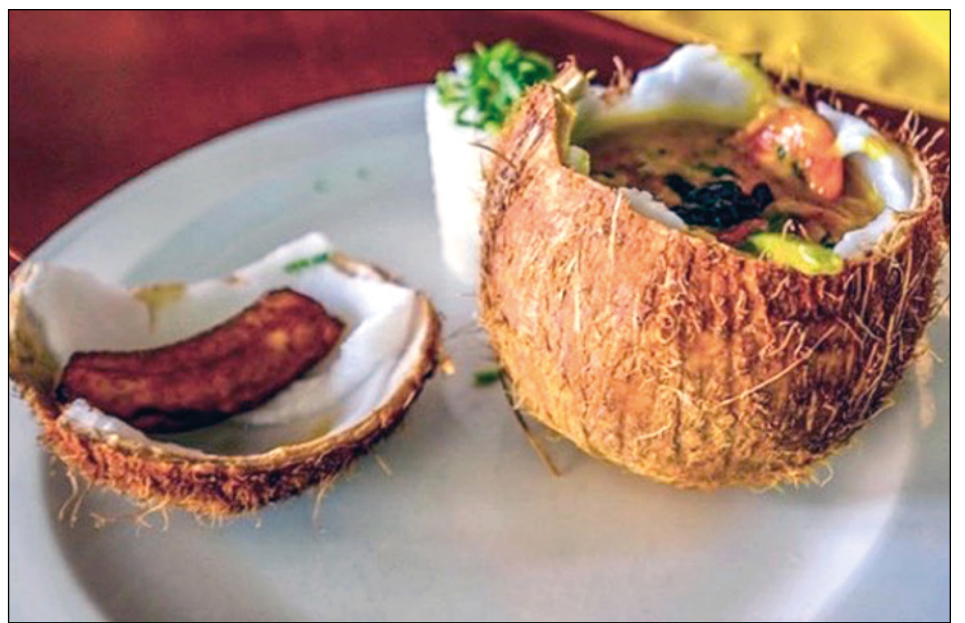
► Coconut delights are promised