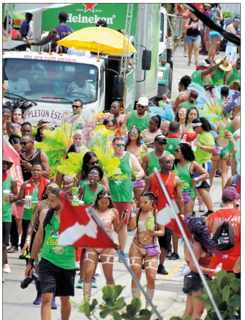
► CayMAS carnival was an explosion of color, music, costume and fun