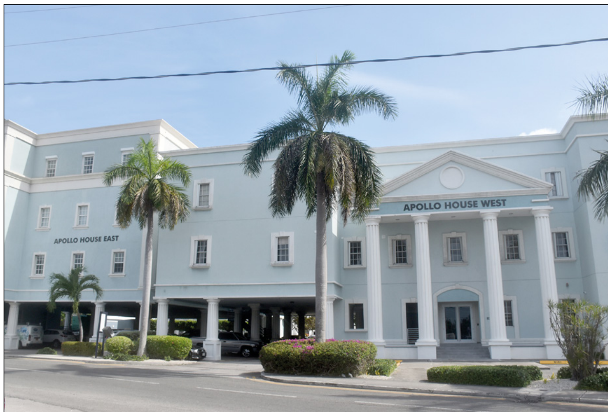
► The Department of Counselling Services' new offices in the West Apollo Building, Mary Street, George Town (opposite JEC Property Consultants)