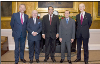
Premier congratulates Governor Martyn Roper