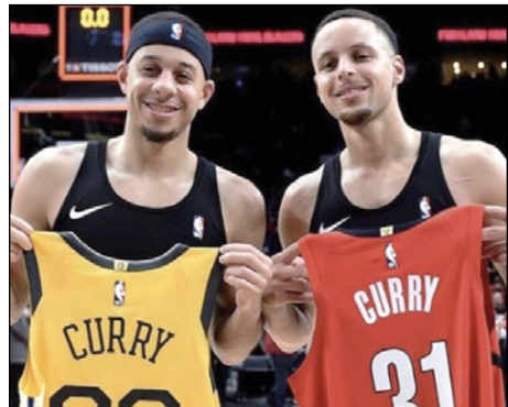
► Seth and Steph Curry are three-point shooting rivals