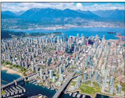
Canada has best quality of life