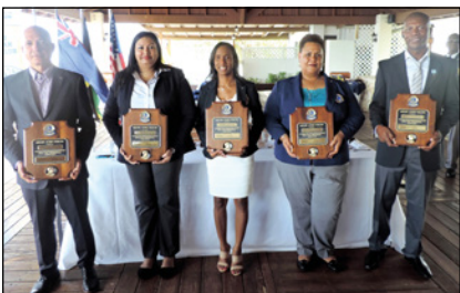
Lions Club's Melvin Jones Awards at Grand Old House