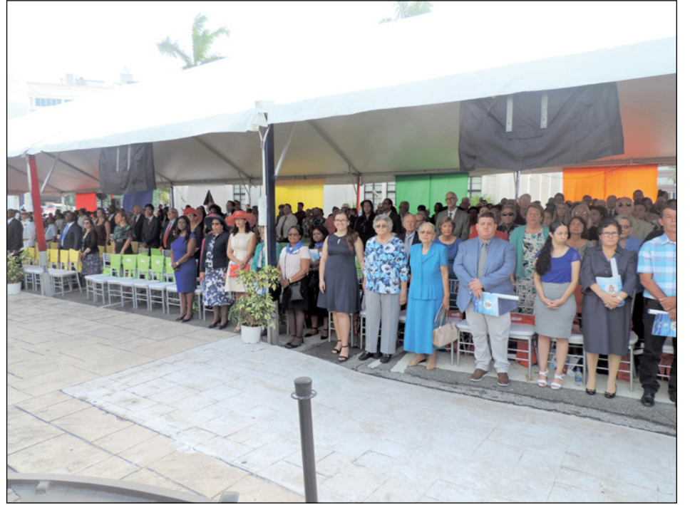
► The crowd braved the windy and rainy weather for Cayman's most important day