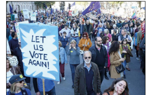
► Brexit is a huge issue in the UK