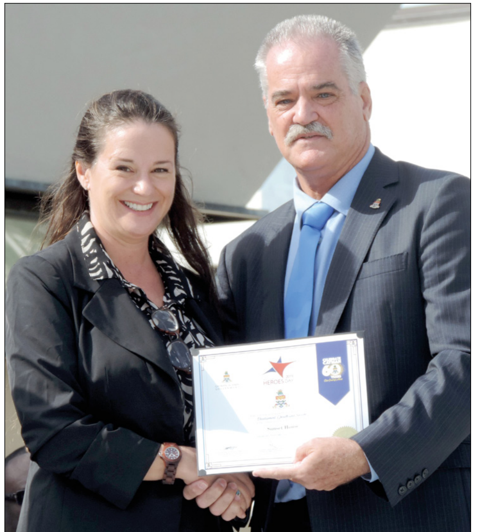
► A representative from Sunset House was recognized