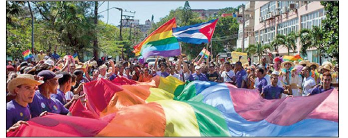
► Cuba has a large gay community

CENESEX said that they had received a response and are moving ahead with the investigation of this shameful event.