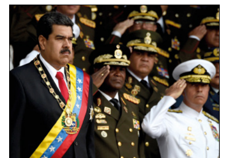
► Venezuelan President Nicolas Maduro, left, during a ceremony to celebrate the 81st anniversary of the National Guard in Caracas

Its social systems are collapsing under the weight of a socialist ideology whose otherwise laudable national (and regional) intentions the government is struggling to realise.