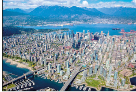
► Vancouver is one of Canada's most popular cities

Japan has moved up three spots from 2019. According to the report, Japan earned high marks for "entrepreneurship and being forward-looking."