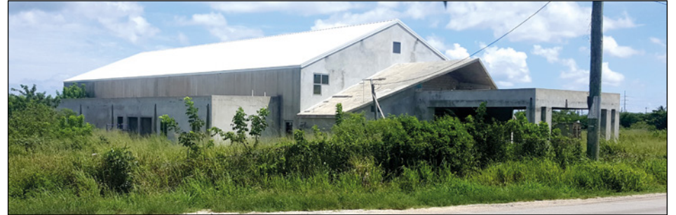
► Bodden Town Hurricane Shelter In Progress