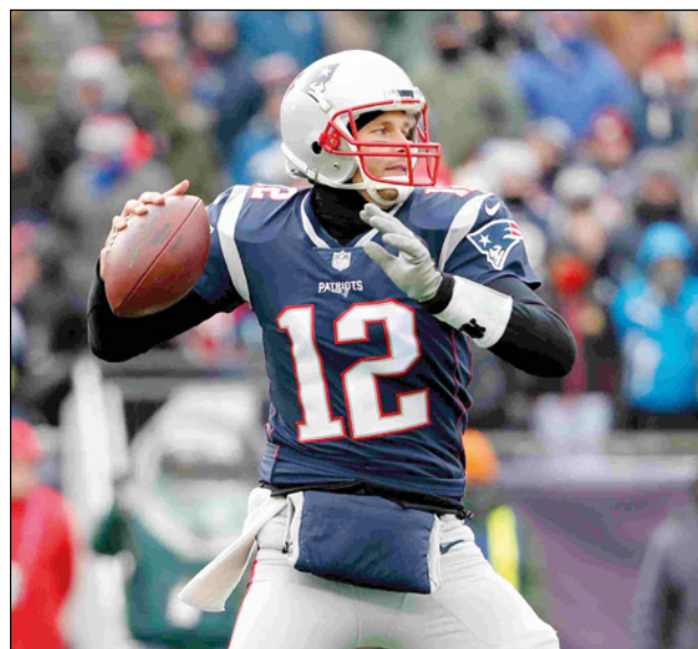
► Tom Brady is in his ninth Super Bowl

"No," he replied. "I've played these guys before." 🌐