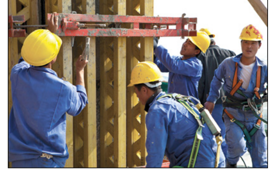
► Filipino workers are overstaying in the US

The DFA noted the concerns of the DHS as visa issuances are a country's