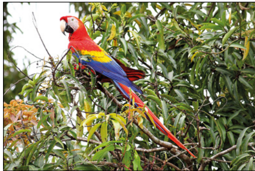
► The Scarlet Macaw is the national bird of Honduras

President Juan Orlando Hernández announced the programme "SOS Honduras" two months ago, aimed at ridding the Río Plátano Biosphere Reserve in the Moskitia of cattle and livestock ranching. The US-based Wildlife Con-