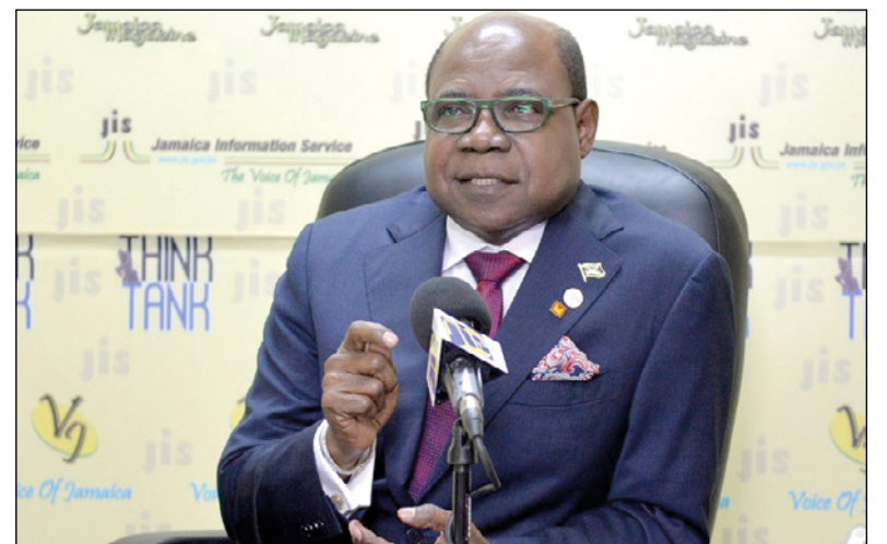
► Minister of Tourism Edmund Bartlett speaks on special needs tourism at a recent JIS 'Think Tank'.

Globally, there are one billion persons living with disabilities. The United Nations World Tourism Organization states that accessibility for all to tourist facilities, products and services is a crucial part of any responsible and sustainable tourism policy. f