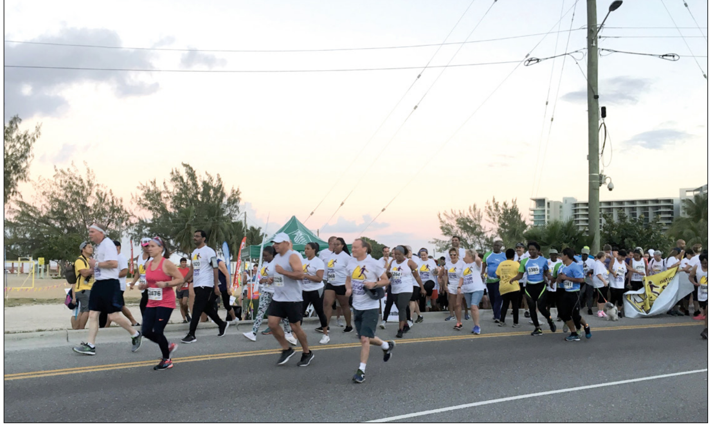
► The Governor leads the pack

For the more serious runner there was a timed half marathon course of 13.1 miles which began an hour earlier than the quarter marathon, at 6am,