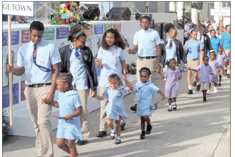
► Heroes of the future: Primary school children marched past the platform