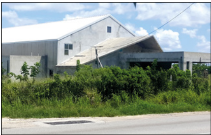
Reducing Gap in District's Shelter Provisions