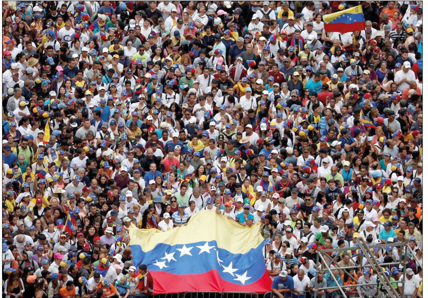
► Thousands gather for rally against Venezuela's President Nicolas Maduro

The region for its part seems riven between more of 'PetroCaribe/Chavez era' memorial support camp (a result of the concessionary oil largesse of the former Venezuelan leader), and those who back the self-declared interim-president Guaidó.