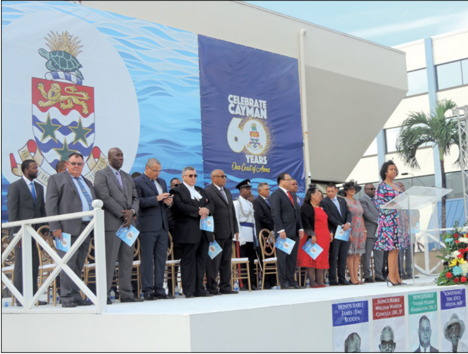
► All the government officials stood, during the singing of the National Song