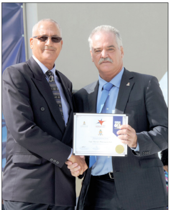
► Captain Marvin's Watersports Ltd was recognized