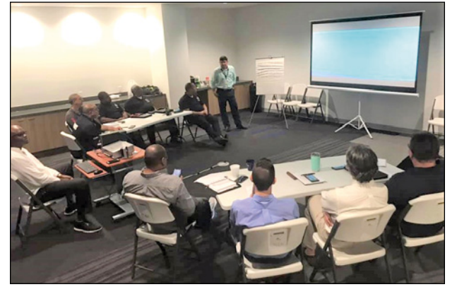
► Members from multiple agencies take part in a three day Incident Command System training course