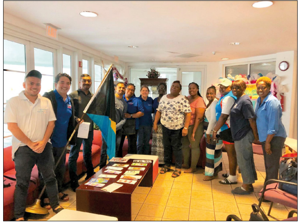
► Cayman's medical team is welcomed in the Bahamas by other volunteers and Bahamian nurses at the Ministry of Health