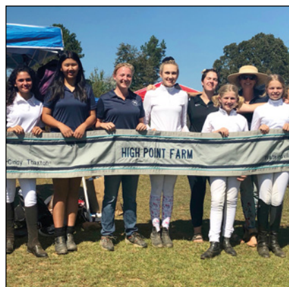
Cayman Equestrians Named IEA Dressage Team Champions