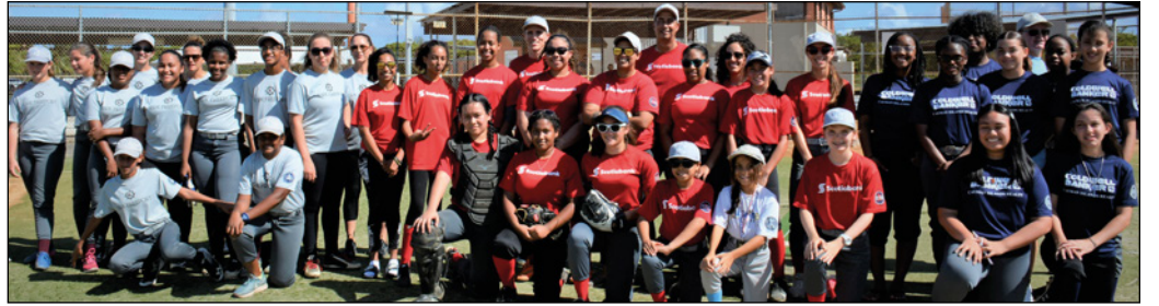
► Girls Softball Teams

Please e-mail cilla.girls.softball@gmail.com for further details. 📧