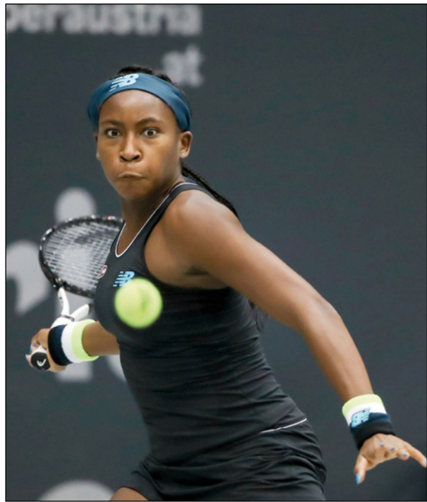
► Coco Gauff has been a revelation this year

The youngster, who rose to fame at Wimbledon this year when she beat five-time champion Venus Williams in the first round, em-