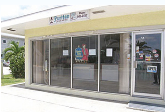
Elgin Avenue, George Town Tel # 345 949 2452

Three convenient locations to serve you, Savannah Countryside, Elgin Avenue George Town, Eastern Avenue George Town, drive thru rain or shine.