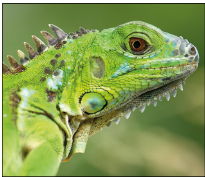
Are Cullers on Target?