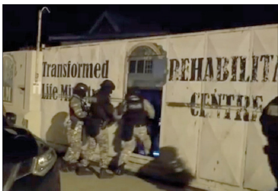
▶ A sting operation was executed by the Special Operation Response Team (SORT) at the Transformed Life Ministry Rehabilitation Centre