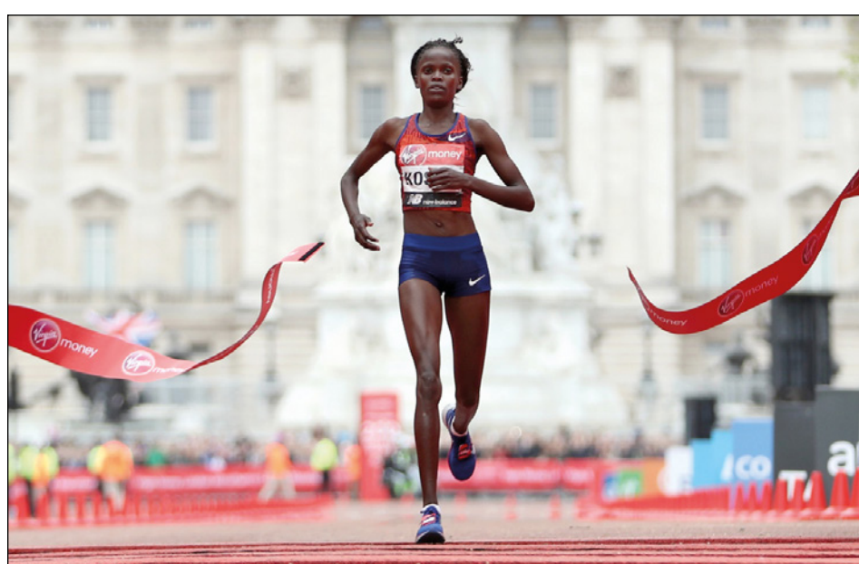
► Brigid Kosgei shattered the women's marathon record

It adds to her win in London this year when she clocked 2:18:20 and became the youngest winner of the race. 🌐