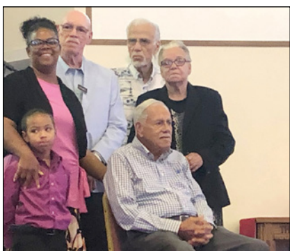
Church Service for Older Persons Month