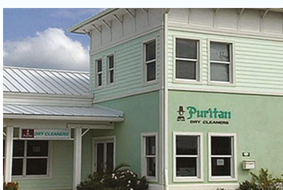
Countryside Shopping Centre - Savannah Tel # 345 946 1884