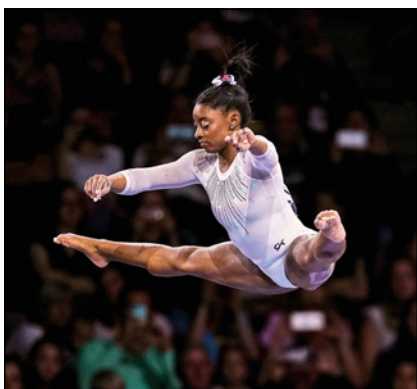
Simone Biles has won 23 world titles