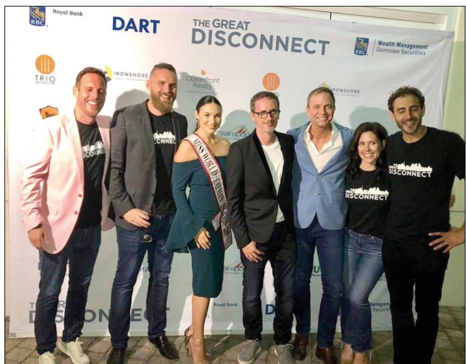
► Members of the Great Disconnect team pose for a picture with Miss Cayman Islands, World