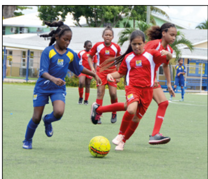
2019 High School Football Leagues: Scores and Standings