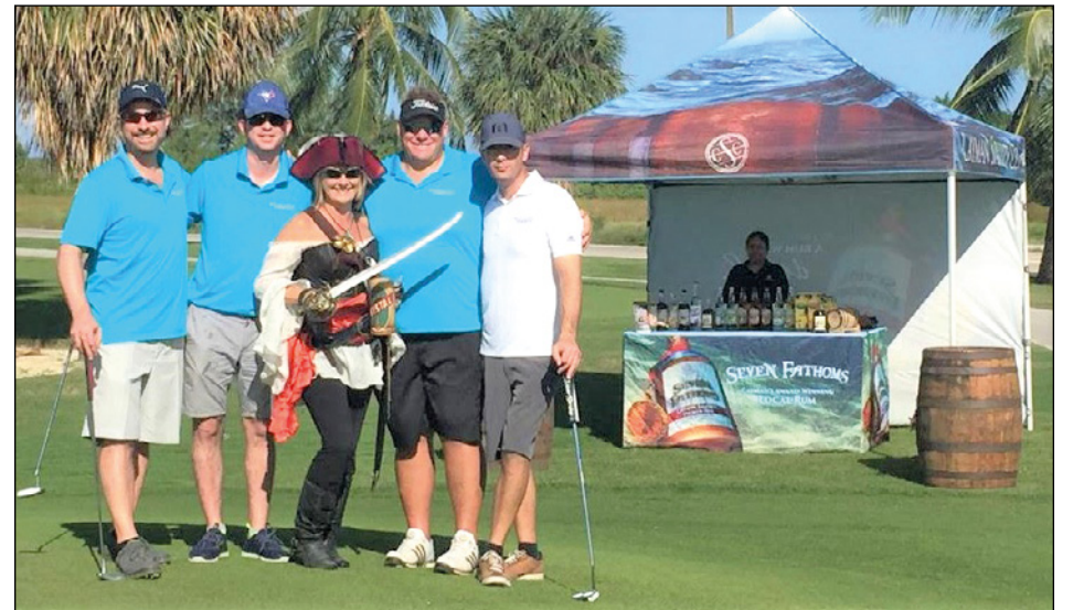
► Pirates raid the green every year as part of the fun

"This year's Charity Golf Classic promises to be a lot of fun. It's about bringing people together to celebrate what Cayman has to offer and providing another great opportunity for people to show their community spirit