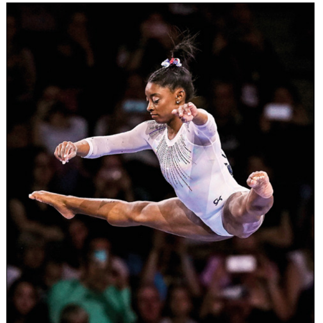
► Simone Biles has won 23 world titles

Having won four gold medals and one bronze at Rio 2016, Biles now has 30