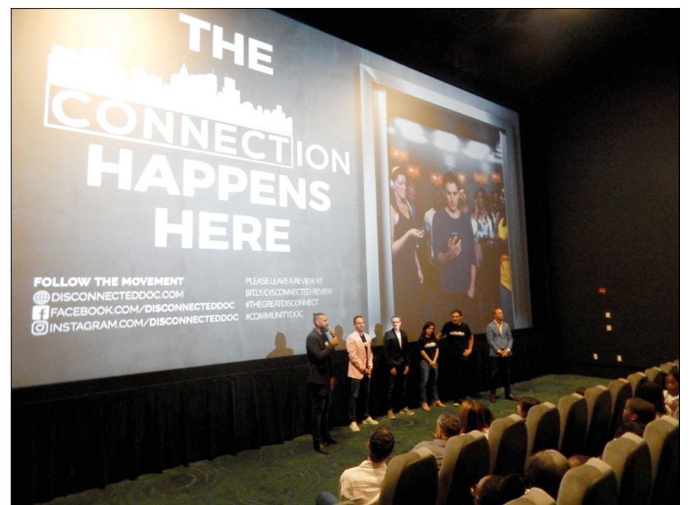
► Members of “The Great Disconnect” production team address questions from the audience after the documentary’s debut