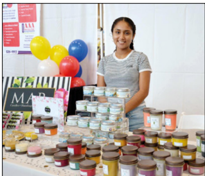
Media and Small Business