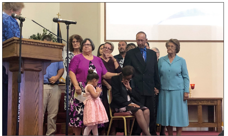
► The Opening Church Service for Older Persons Month was attended by the congregation and many others including dignitaries and Ministry staff