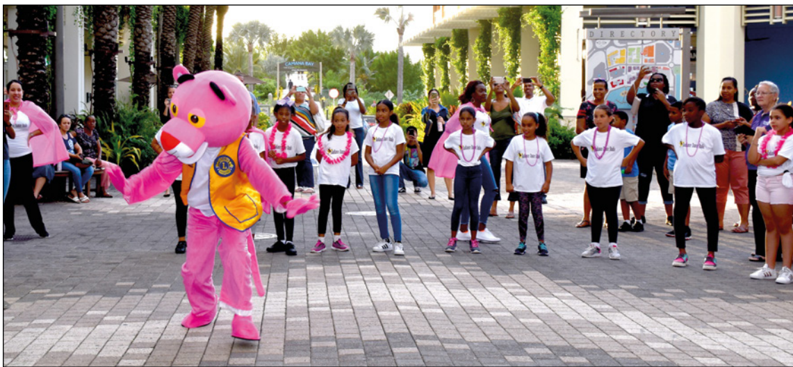
► LCTG Breast Cancer Awareness Mascot, Pink Warrior, performing with a flash mob of dancers from Radiance Dance Studio and Cayman Islands National Dance Studio

The Lions Club of Tropical Gardens concludes its month of activities by honouring the men and women who are Breast Cancer Survivors, by hosting its annual Breast Cancer Survivors Breakfast on 26th October 2019. This event is by invitation only, so if you are a Breast Cancer Survivor and would like to attend this event please call 936-1739 to register.