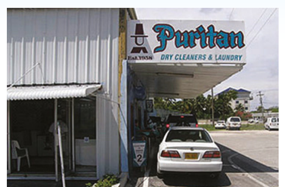
Main Store – Eastern Avenue, Drive Thru (rain or shine) George Town Tel # 345 949 7104