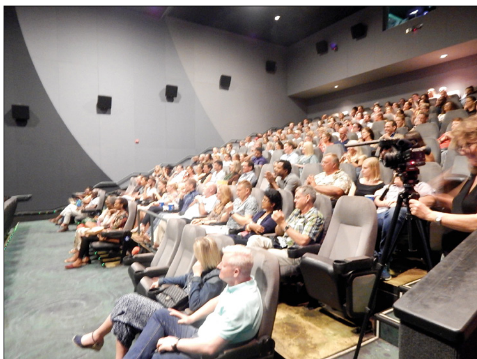
► The turnout was impressive at the exclusive Cayman Islands premier of, “The Great Disconnect”