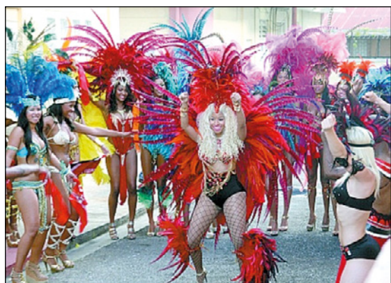
► Nicki Minaj will be at Trinidad's Carnival this month

The entertainer has featured Trinidad and Tobago Carnival in her past work - going to T&T in 2012 to shoot her video for her single 'Pound the Alarm'. Minaj recreated scenes from Carnival for the video - women, including the rapper herself, decked out in an array of Carnival costumes, moko jumbies, jab molassies and cameos from soca stars