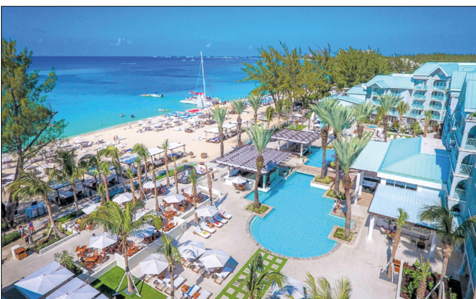
► The Westin Grand Cayman Seven Mile Beach Resort & Spa

The numbers provided by the DOT do not make a distinction between how many of the travelers visited Grand Cayman and/or the Sister Islands of Cayman Brac.