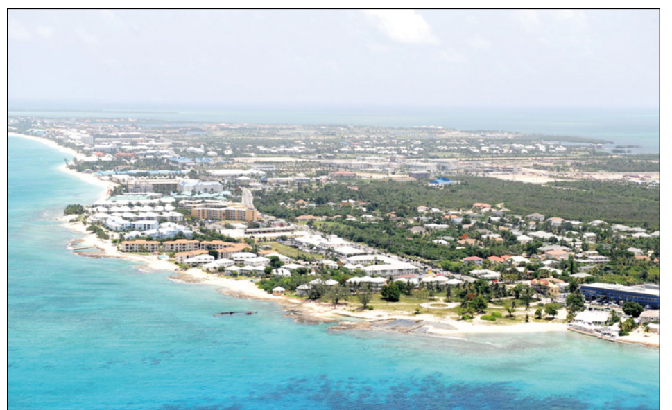
► Aerial photo of Grand Cayman