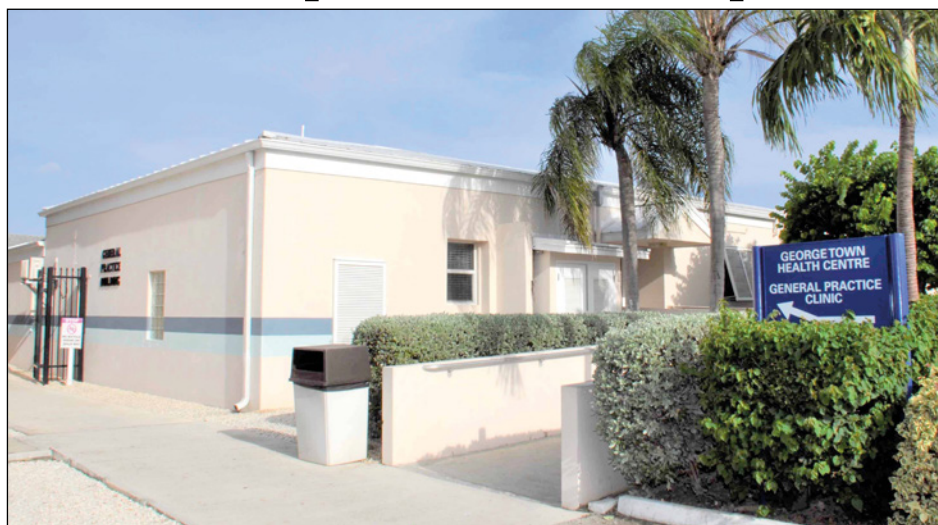
► The flu clinic is located in the George Town General Practice Building

With the peak of the flu season and the Public Health Department reporting higher than usual cases of patients presenting with flu like symptoms, the Health Services Authority (HSA) is opening a temporary flu clinic at the George Town General Practice Clinic.