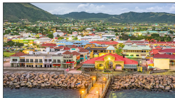
► St Kitts is highly desirable for CBI applicants

After becoming independent, the islands introduced the CBI program in 1984. It is an economic-citizenship program, which Harris claims is "considered the most attractive, and that is