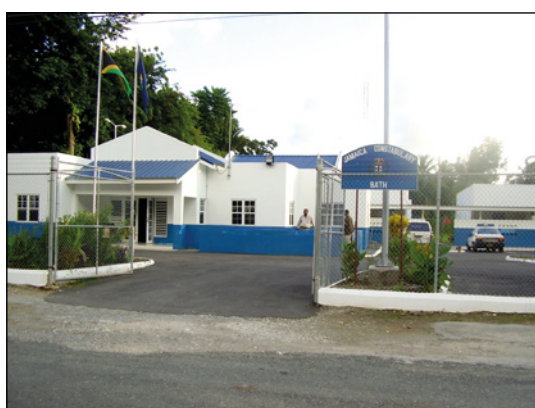
► Jamaican police stations are getting a facelift

National Security Minister Dr Horace Chang announced that six police facilities are earmarked for repairs under a multi-million-dollar European Union funded Poverty Reduction Programme later this year.