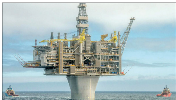
► Guyana is coming into huge oil wealth