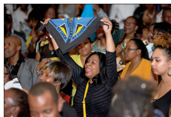
► St Lucians will have to complete a census in May

Around 550 enumerators are being trained to work on the census. "The information which you will be providing is protected by law and you have the highest assurance that any information which you provide, will be dealt with in the strictest confidence. Please provide information which is