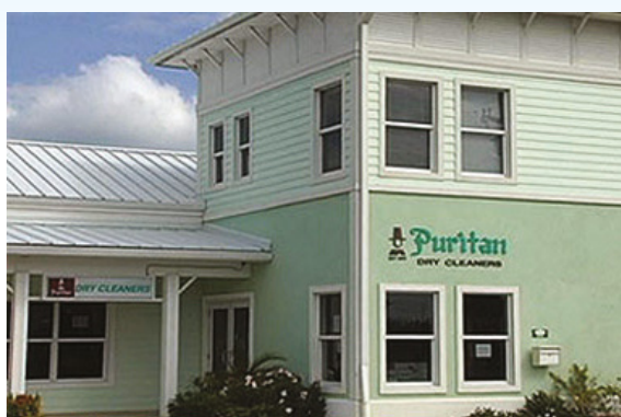
Countryside Shopping Centre - Savannah Tel # 345 946 1884