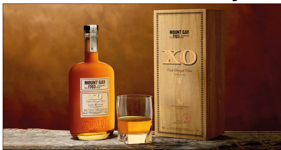
► Mount Gay is the most popular rum in Barbados

The trio issued a statement this month making known its agreement with the proposal that among other things, "under the GI, Barbados Rum will be required to be matured in Barbados as the climate of maturation has a defining impact on the nature of a spirit".