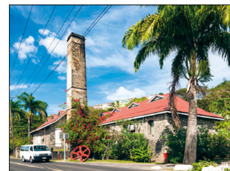
► ICWI Dominica launched at The Old Mill Cultural Centre