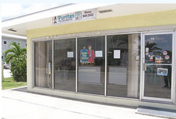
Elgin Avenue, George Town Tel # 345 949 2452

Three convenient locations to serve you!