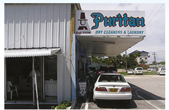
Main Store – 337, Eastern Avenue, Drive Through (rain or shine) George Town Tel # 345 949 7104