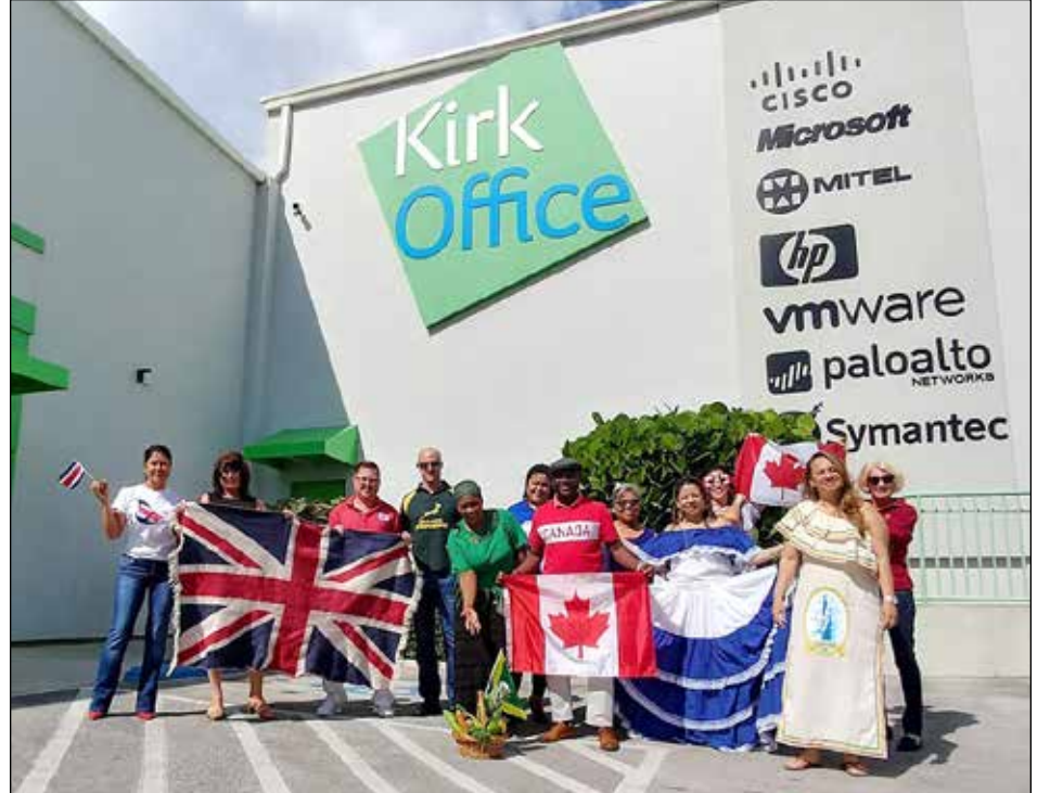
► Kirk Office Staff Dressing For Culture in 2019