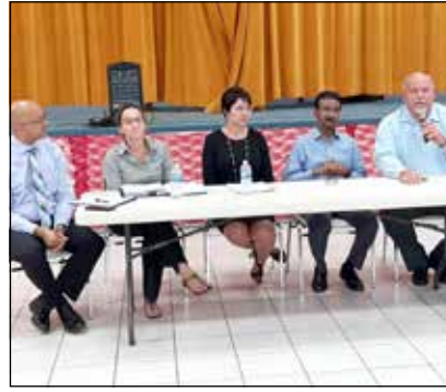
Cayman Brac prepares for Corona Virus