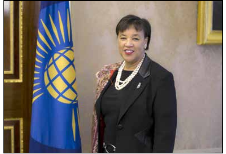
► Rt. Hon. Patricia Scotland QC, The Commonwealth Secretary-General

Friendship, kinship and affinity among the people of our