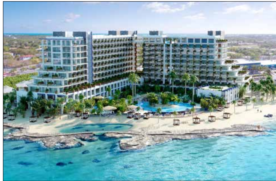
Grand Hyatt Grand Cayman Resort and Residence joins other Hemsworth clients including Sonesta Fort Lauderdale, Margaritaville Beach Resort Hollywood, Coral Hospitality and Driftwood Hospitality Management.

Key development milestones will be showcased through a series of press releases, tailored pitches and special events leading up to the property's opening, with brand partnerships, cross-promotions and more.