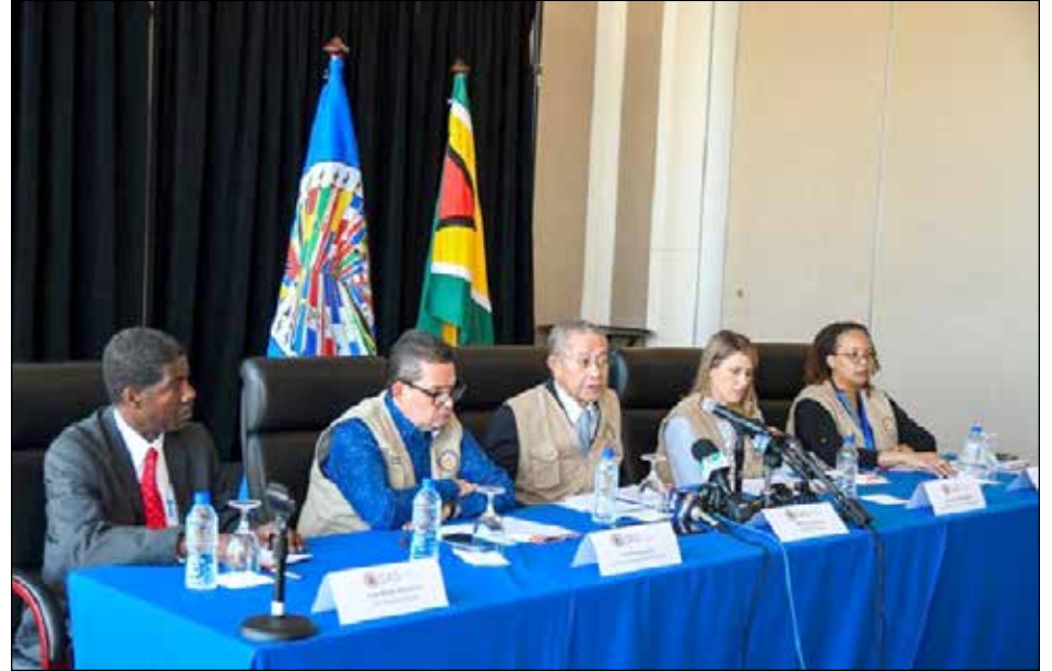
► The OAS observer mission is among those expressing concern

"The PPP agrees with the international community; there can be no swearing in of a new president under the current