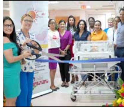
HSA Receives Neonatal Transport Incubator Donation