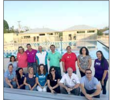
YMCA Retreats to the Brac