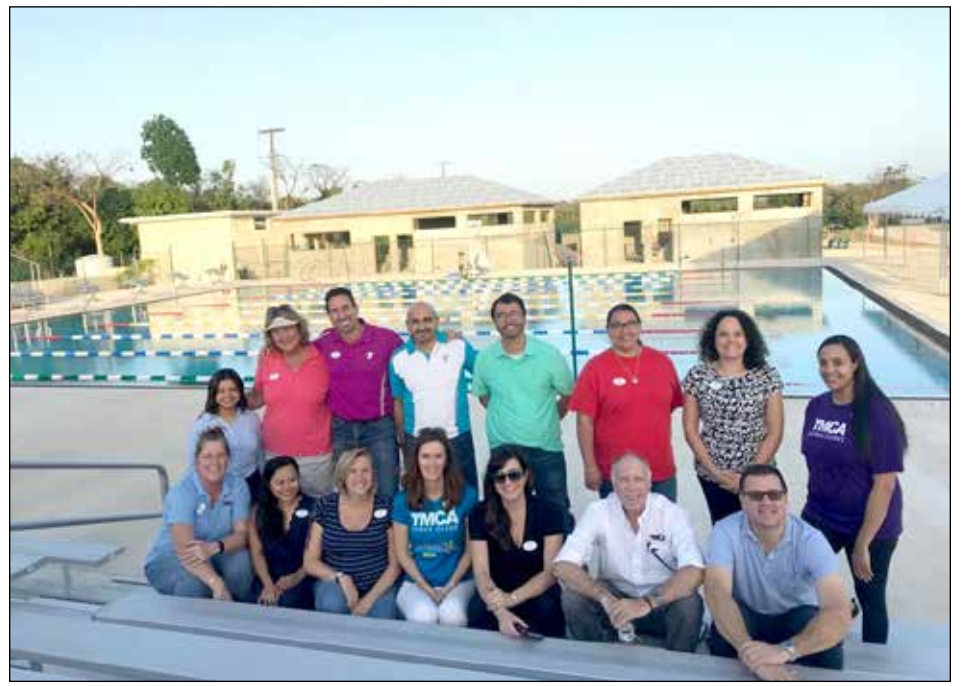
► Members of the Y board retreat at the Cayman Brac Sports complex