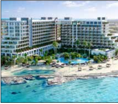
Grand Hyatt Hires Award-Winning Public Relations Agency