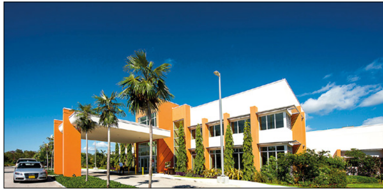
► Health City Cayman Islands