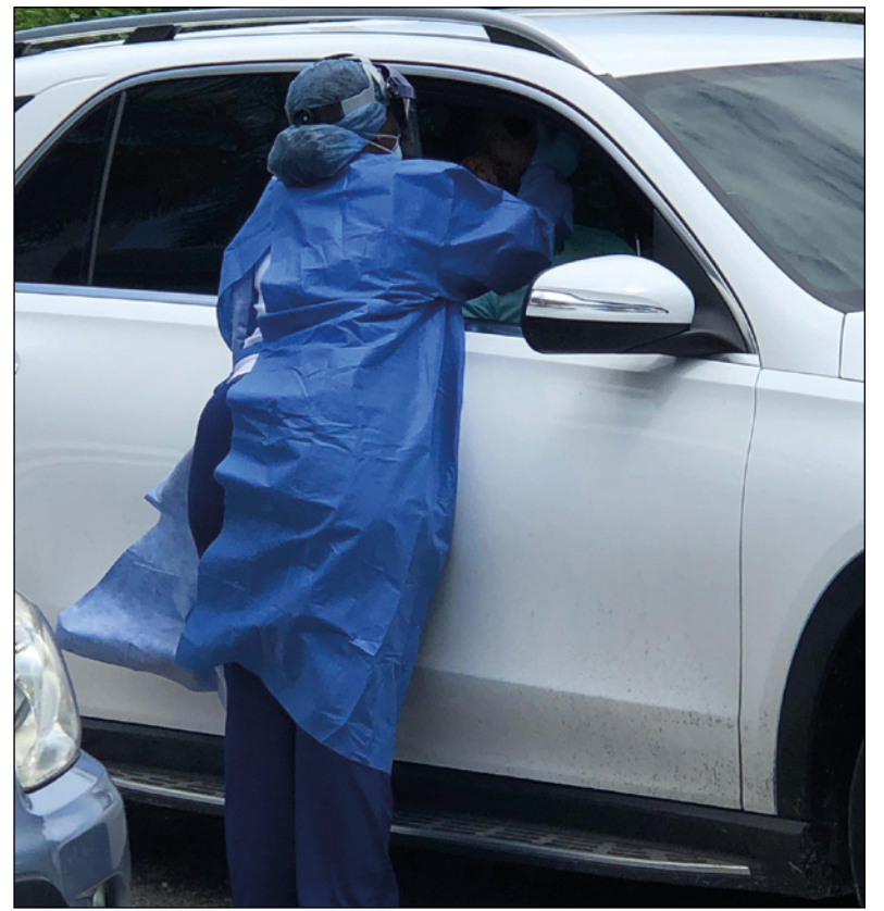
► Drive through COVID screening