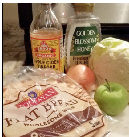
Healthy alternatives in food choices during the lockdown