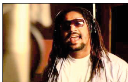
Musicians to Receive CIG Stipend