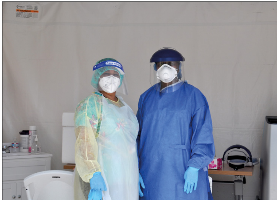
► Health Services Authority’s COVID-19 Screening Tents at the Cayman Islands Hospital

Public Health is scheduling appointments with frontline workers for the foreseeable future while the testing efforts have ramped up. Phase 2 frontline workers and a percentage of construction workers are currently being scheduled for screenings. HSA, Public Health and the Chief Medical Officer are working together to prioritise persons or business who are deemed essential frontline workers.