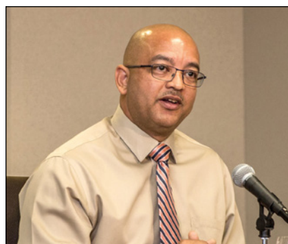
Statement by Medical Officer of Health