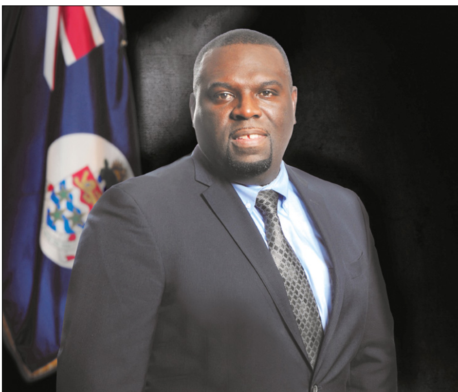
► Hon. Minister of Culture, Dwayne Seymour

“Money certainly can’t buy happiness but it can buy an artiste the time and means to create which in return can bring immeasurable joy,” he explained. 🌐