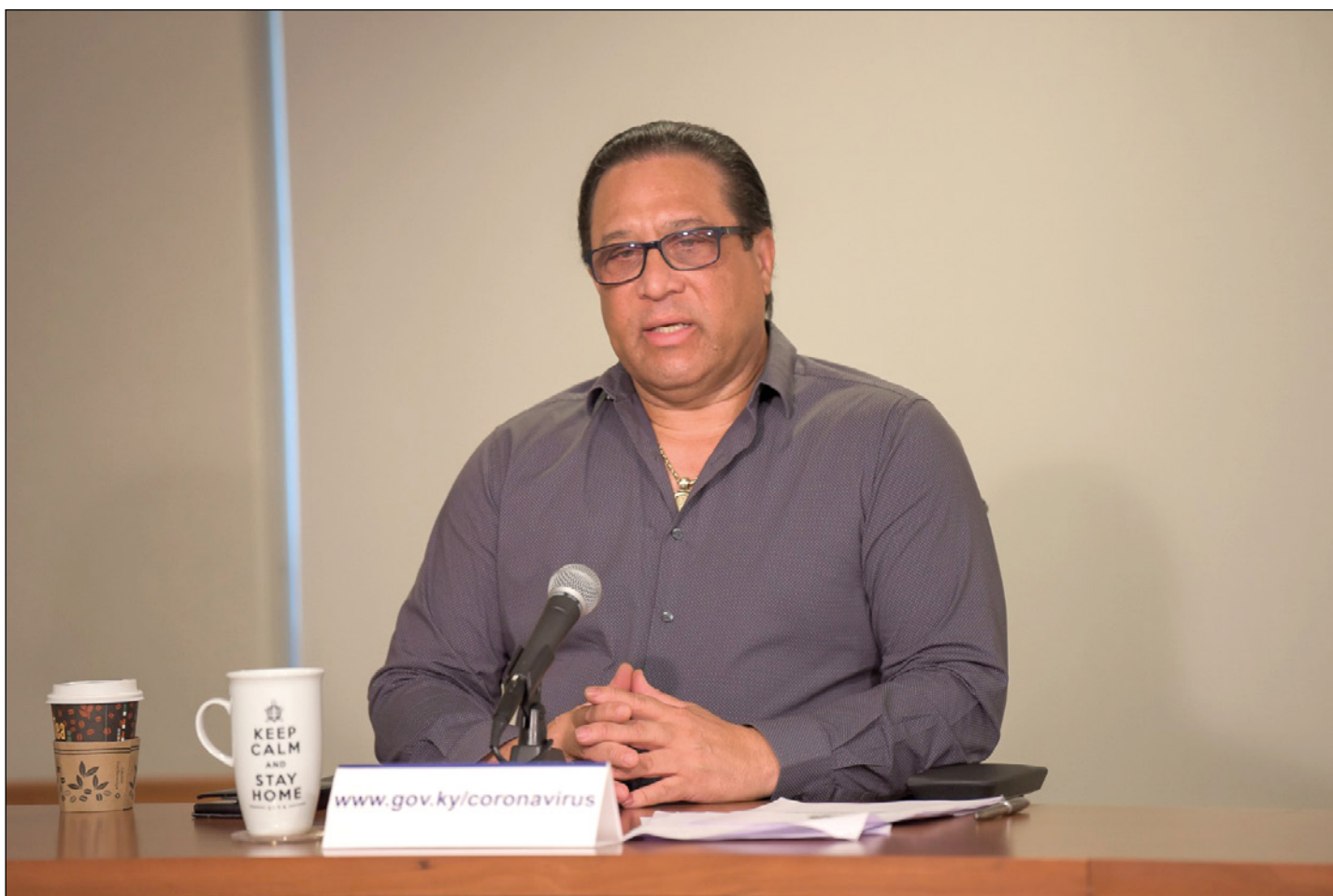
► Premier of the Cayman Islands Hon. Alden McLaughlin

Premier of the Cayman Islands Hon. Alden McLaughlin on Friday expounded on his approach to keep the Cayman Island, Grand Cayman especially, under tight restrictions despite indications that the spread of COVID-19 in the community appears to be slowing.