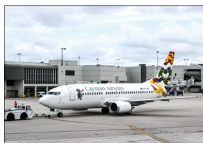
CAL confirms Miami and Dominican Republic repatriation flights