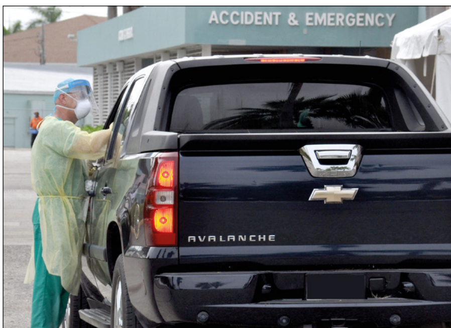
► Drive through COVID screening