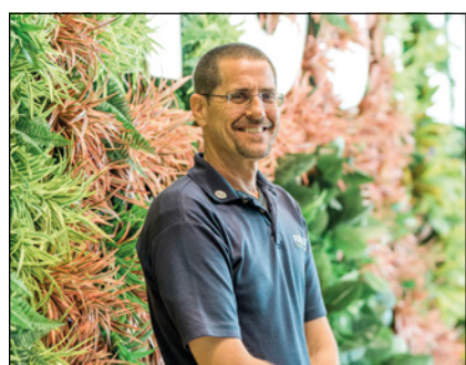
CHAMBER PRESIDENT PRIORITISES JOBS