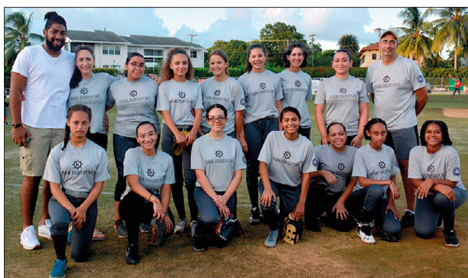
► Kirk Freeport Team