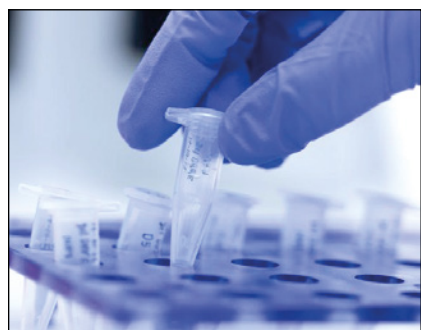
CAYMAN KEEPING ON TOP OF COVID