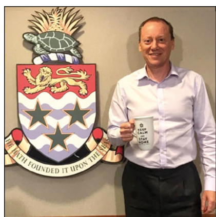
GOVERNOR RELEASES FCO INSTRUCTIONS ON DOMESTIC PARTNERSHIPS BILL