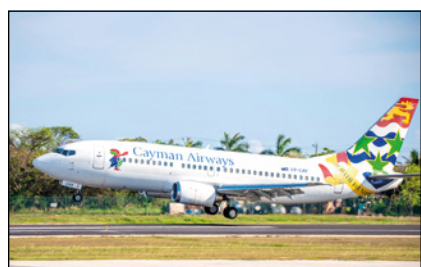
More Flights scheduled for Honduras, Jamaica and Miami