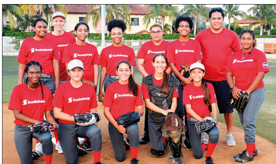
► Scotiabank Team