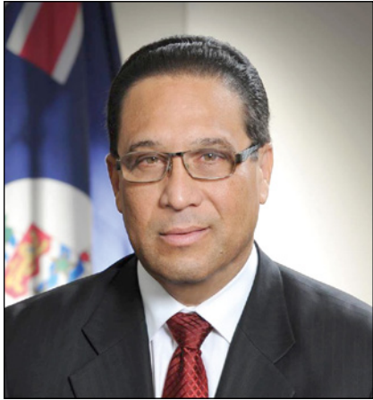
Premier's New Years Message. Part 1