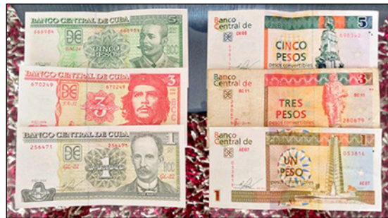
► Cuba is reforming its confusing currency

However, the CUC has had different exchange rates for the public, joint ventures and state-owned enterprises over the past three decades, which has created distortions in the