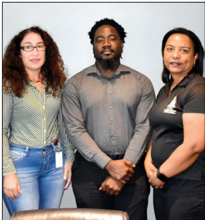
Caymanians Offered Internship Opportunities