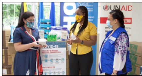
► Jamaicans are taking extra precautions against the virus

Jamaica has reported four cases of the highly contagious strain of COVID-19 that recently surfaced in the United Kingdom but the authorities there are cautioning against panic. Like BVI and Grenada, Jamaica has banned all travellers from the UK as a result.