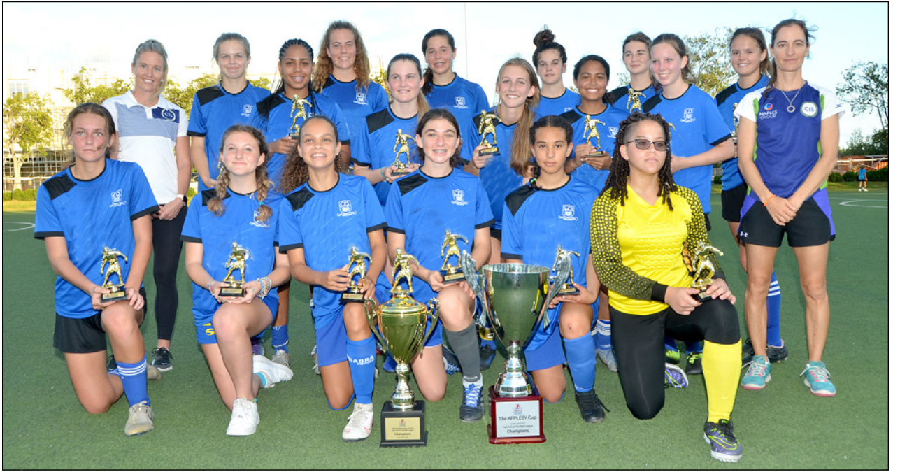
► 2020 Appleby Under 18 girls high school football champions – Cayman International School

In the Appleby Under 18 boys' league, Cayman Prep secured the coveted title with a 'nail-biting' 3-2 final day victory over John Gray High School (JGHS). The win was significant for the defending champions as eventual league runners-up Triple C were at the same time, enjoying a 5-0 win over Clifton Hunter High School and were hoping for a Cayman Prep draw or loss, which would hand the Triple C Crusaders their first high school football championship. Cayman Prep managed to overcome a final 10 minutes of