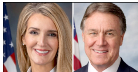
► Georgia Republican Senators Kelly Loeffler and David Perdue

On its website, the Bureau of Consular Affairs of the US State Department advises American citizens who run afoul of the law while they are abroad that it; "cannot get U.S. citizens out of jail, state to a court that anyone is guilty or innocent, provide legal advice or repre-