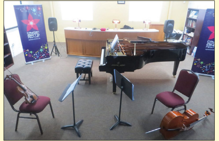
► Cayman Arts Festival

12 & 14 January – The Chamber of Commerce is hosting 2 workshops in early January 2021. Time Management & Productivity on 12 January is a half-day workshop includes practical applications and time saving activities to assist you in learning how to make the most of your time by getting a grip on your workflow, planning and pri-