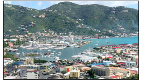
► BVI is off limits to UK travellers

"Cabinet decided to implement a 14-day quarantine period for all persons allowed to travel to the BVI under the previously-mentioned exceptions, provided that they un-