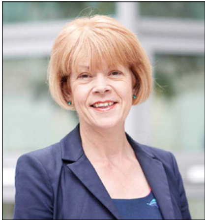
UK MINISTER REGRETS EXCLUSION OF OTs FROM BREXIT DEAL