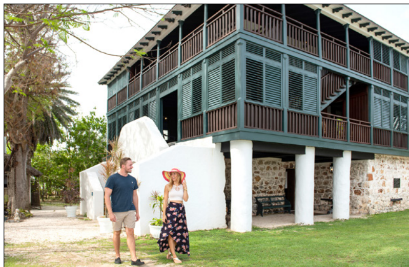
► The Experience Cayman virtual festival draws a close as Cayman is encouraged to continue to support local

"During these unprecedented times, Experience Cayman allowed us to showcase all that our islands