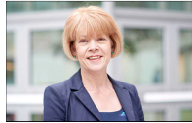
► Wendy Morton UK Foreign Commonwealth and Development Office Minister for the European Neighbourhood

"With the signing of the historic UK-EU trade agreement complet-