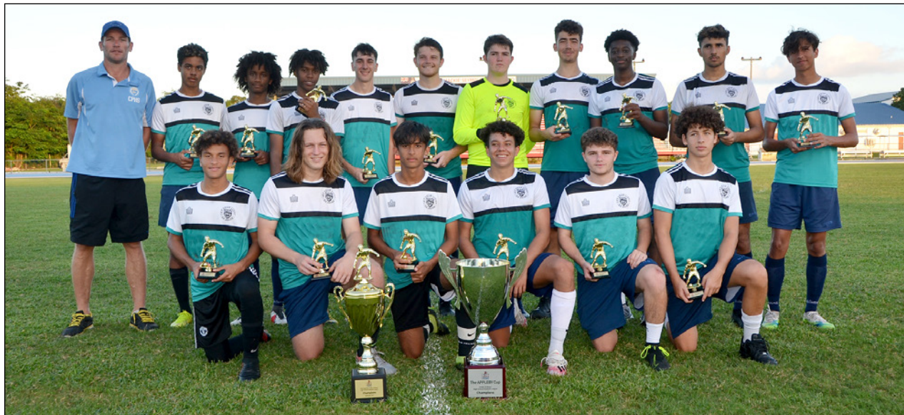
► 2020 Appleby Under 18 boys high school football champions – Cayman Prep & High School

sustained pressure from JGHS to secure the win and the title by a single point. JGHS finished third in the league.