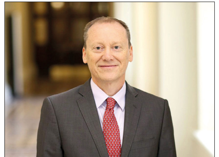
► HE Governor of the Cayman Islands, Martyn Roper

SEE GOVERNOR ROPER TO TAKE FIRST COVID JAB IN CAYMAN, Page 8