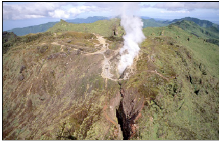
► St Vincent residents around La Soufriere fear it erupting

Last Tuesday officials warned of strong gas emissions, forma-