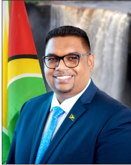
► President Irfaan Ali is grateful for international support

However, following the intervention of Venezuela's President Nicolas Maduro, the case was dropped. The detention oc-