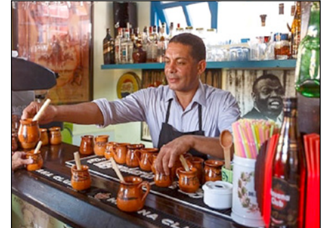
► Cuban business owners may get a boost

Apart from hundreds of thousands of small farms, Cuba's non-state sector is composed mainly of small private businesses run by artisans, taxi drivers and tradesmen. Around 600,000 people, around 13 percent of the workforce, joined the private sector when the opportunity arose.