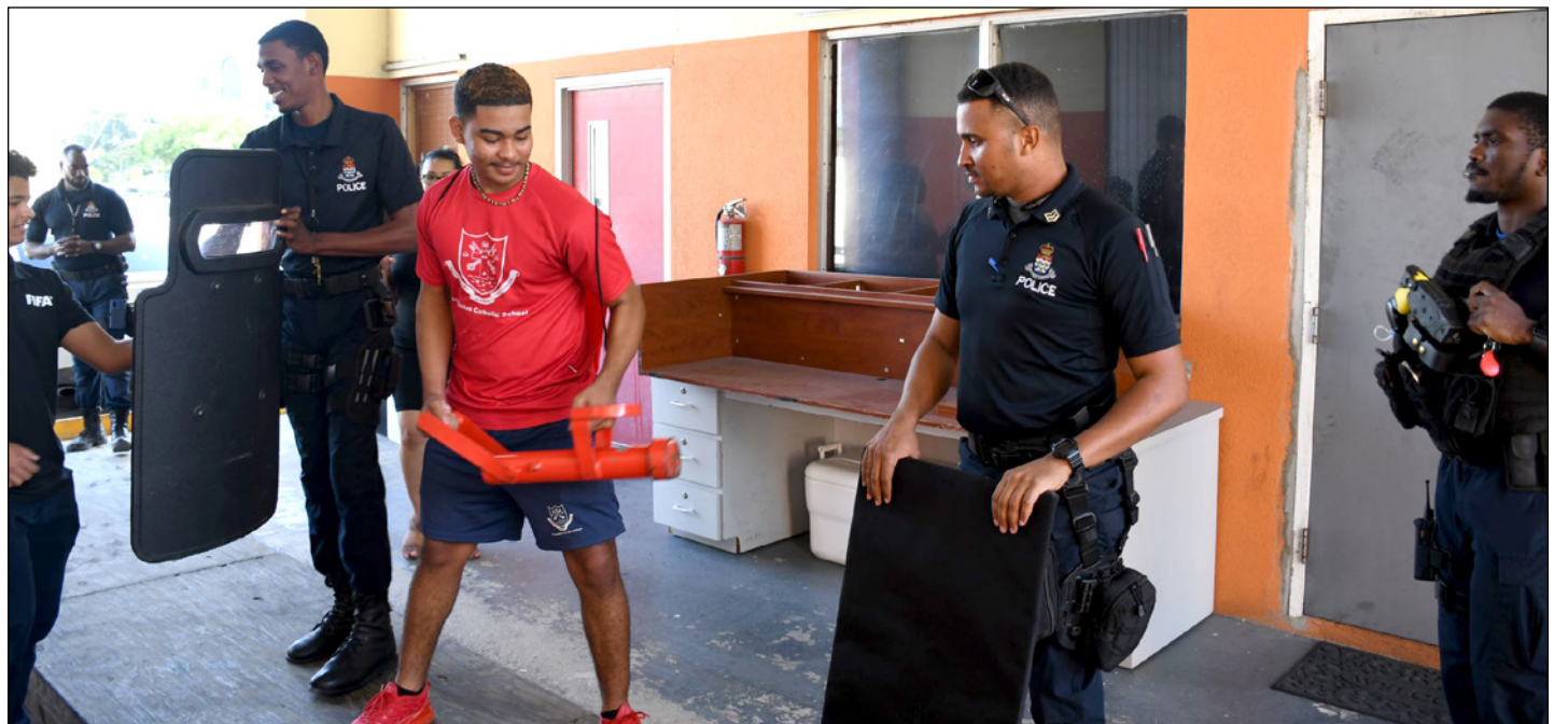
► Officers from the Firearms Response Unit demonstrate some of the equipment they utilize