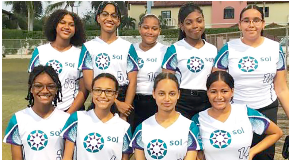
► SOL Pumas