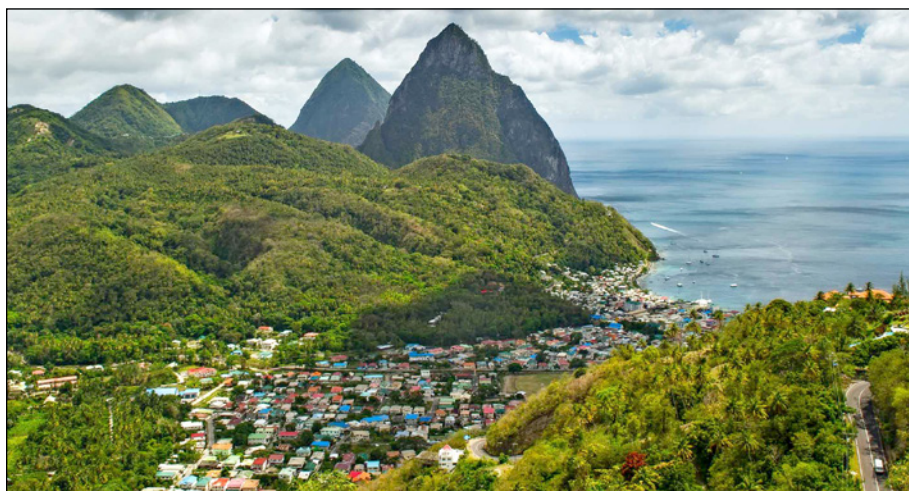
► St Lucia's covid rules have changed

This is in addition to existing protocols which include providing a PCR test taken three days before travel. Visitors must remain in their room at their accommodation for five days and then take a second Covid 19 PCR test.