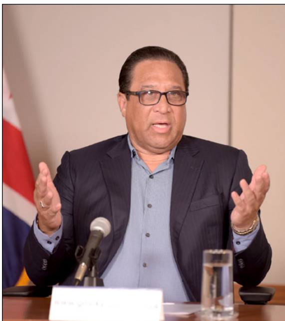
► Cayman Islands Premier Alden McLaughlin

In accordance with Section 3(2) and 3(3) of the Roads (Naming and Numbering) Act (2019 Revision), the Minister responsible for Lands notifies the public of the intention to rename: the portion of South Church Street from Goring Avenue to Shedden Road; Harbour Drive; and the portion of North Church Street from Fort Street to Mary Street to Seafarer's Way. Any objections to the renaming of this street can be made in writing to the Minister responsible for Lands at the Government Administration Building, Box 105, Grand Cayman KY1-1900 within one calendar month of the date of the publication of this notice.