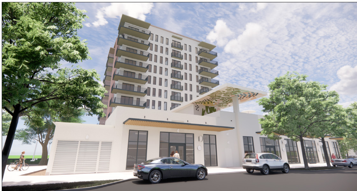
► A rendering of the northwest entrance to Kapok in Camana Bay, estimated for completion in August 2022

Developed by Dart Real Estate, Camana Bay offers more than 650,000 square feet