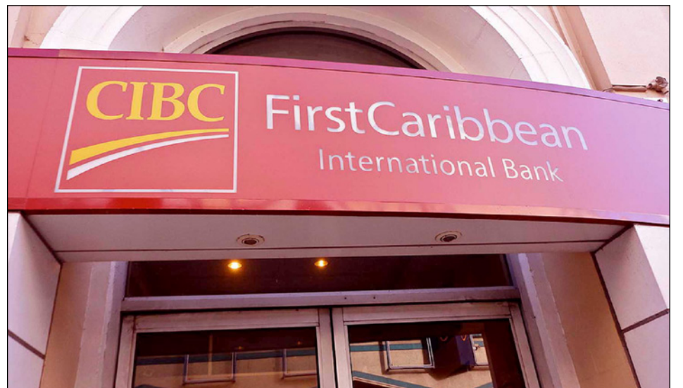
► FirstCaribbean International Bank main entrance

FCIB is a leading financial institution operating throughout the English and Dutch-speaking Caribbean with a strong balance sheet and regionally-leading digital banking capabilities. FCIB's team, extensive branch network, ongoing investments in technology and unwavering client focus are competitive differentiators that enable it to maintain its leadership in the Caribbean banking sector.