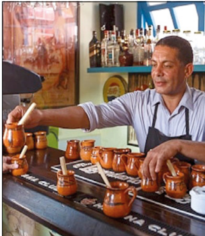
Cuba lifts private business rules