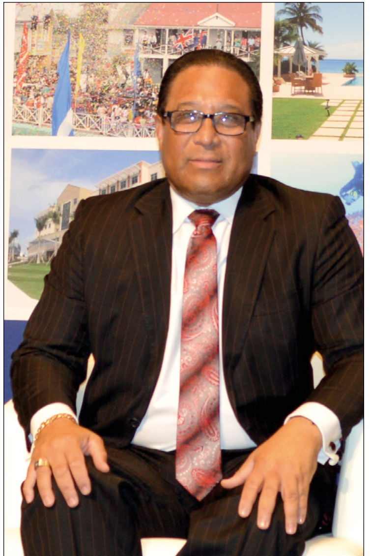
► Cayman Islands Premier Alden Mclaughlin

SEE PPM THE ONLY CHOICE FOR GOVERNMENT, Page 2