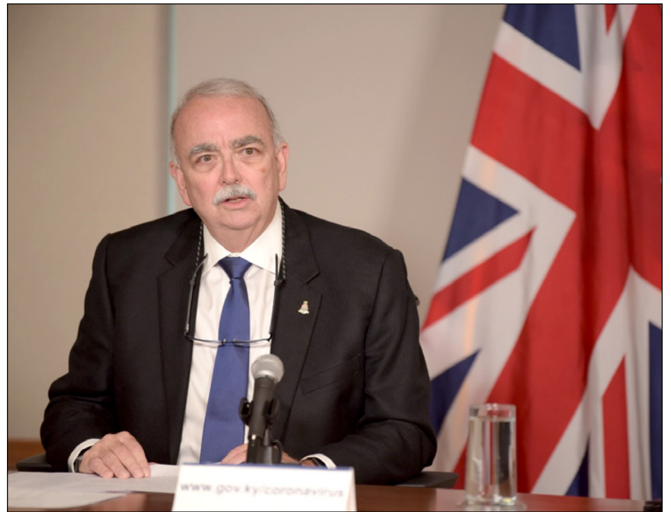
► Minister McTaggart announces Tourism Stipend Increase

Hon. Finance Minister Roy McTaggart who will be taking over the leadership