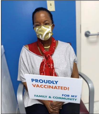
OVER-60s VACCINATIONS CRITICAL