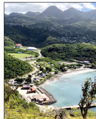
► Little Bay, Montserrat could entice professional nomads

a work-life-vacation balance, trading in a routine at-home environment for exotic black-sand beaches and rich cultural offerings during the pandemic.