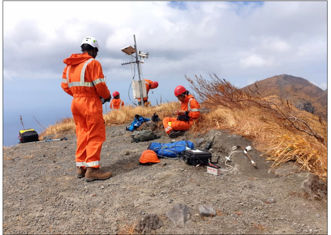
► The scientific team working at La Soufriere Volcano

"The contribution of the United States Geological Survey and its Volcano Disaster Assistance Programme to the work of the SRC in Saint Vincent and the Grenadines is generous and deeply appreciated by our government and peo-