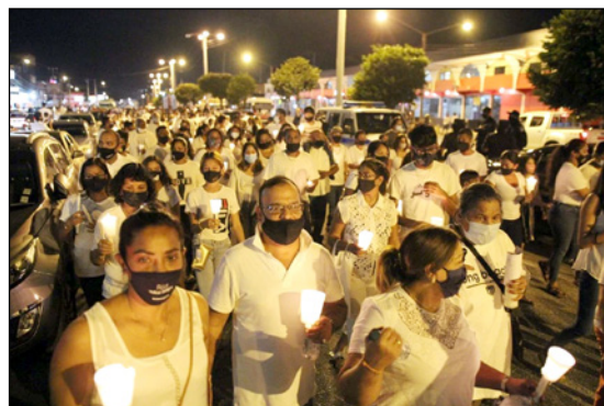
► Trinidad had a mass vigil and boycott for the murdered woman