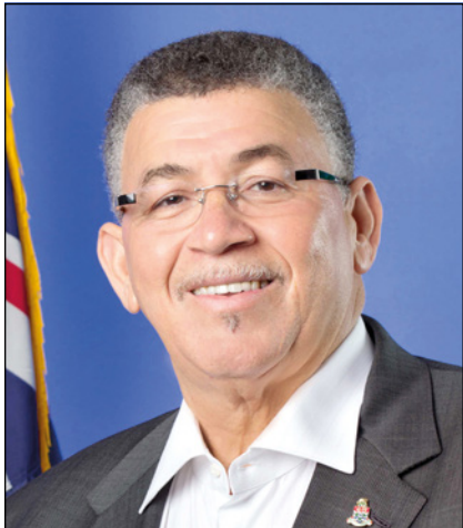
Speaker Speaks Out