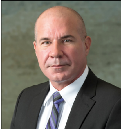
Cayman Airways CEO delivers personal message