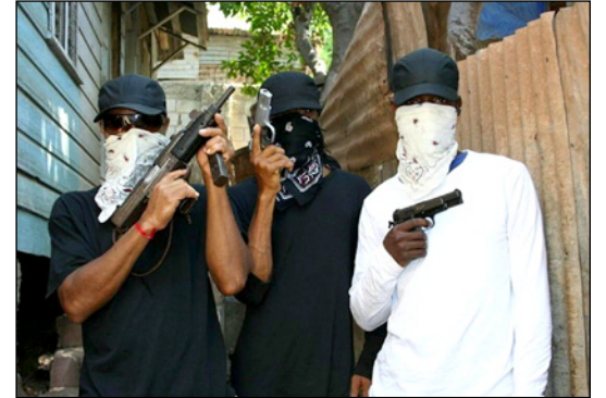
► Jamaican gangsters are ruthless

Despite pumping billions of dollars into the national security infrastructure over the past four years, the government has