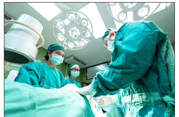
► Saint Lucia's hospital staff are dedicated

The Oxford AstraZeneca vaccine is administered in two doses for gaining the