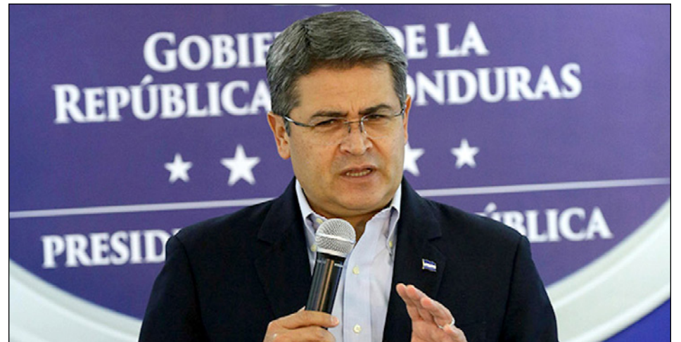
► President Juan Orlando Hernandez denies all drug accusations