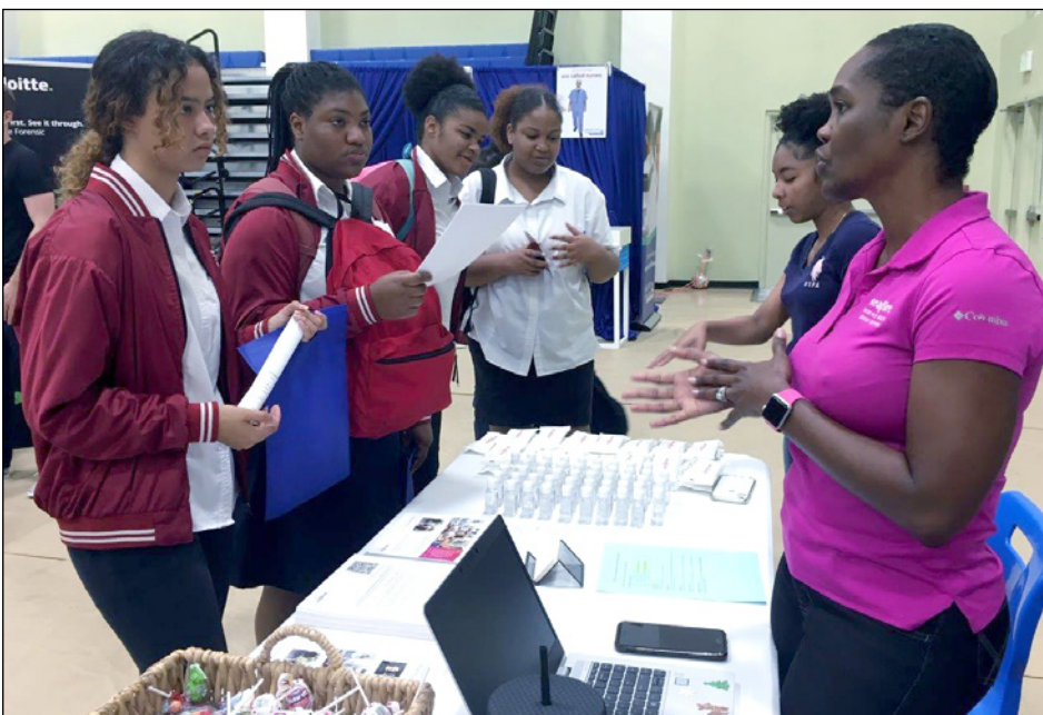
► Students chat with Kimpton Seafire representatives