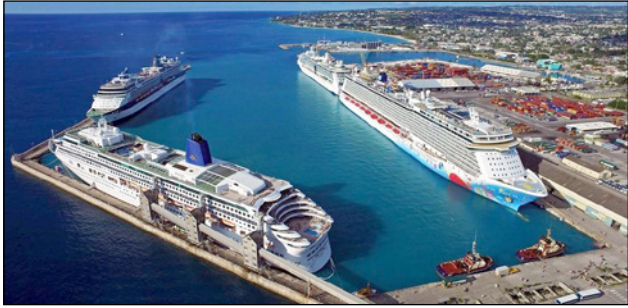
► Bridgetown will welcome Grandeur of the Seas in October

The Caribbean cruise industry will bounce back by the end of this year which is welcome news for places like Barbados where Royal Caribbean will homeport out of Bridgetown for the first time in October.