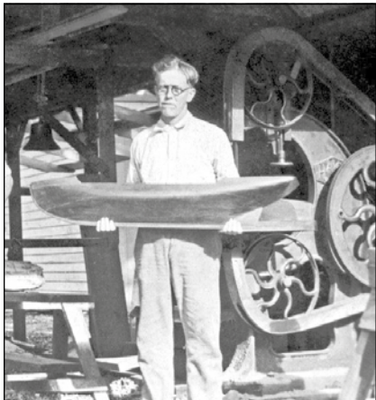
Keeping History Alive - the Cimbo and the Goldfield