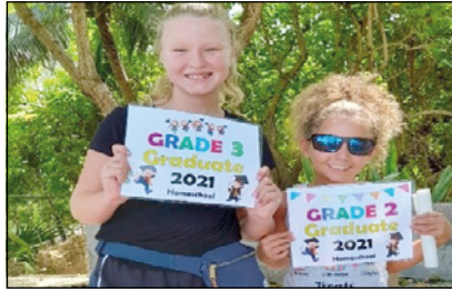
Homeschool Programme Experience Growth