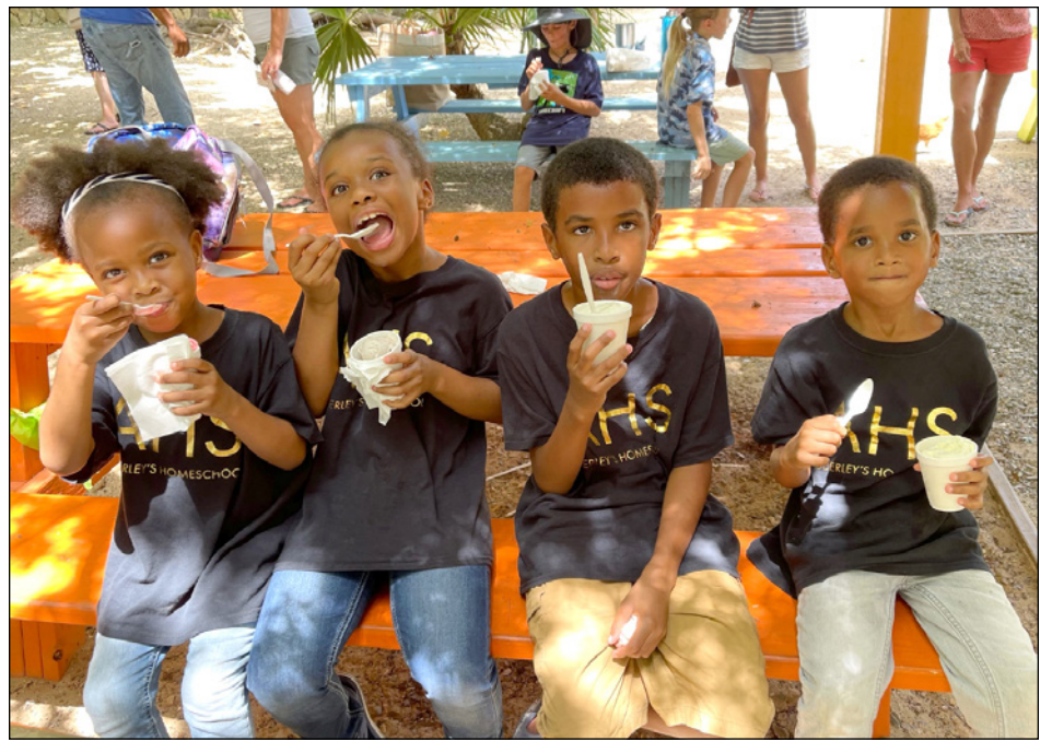
► The Adderly four enjoying a much deserved end of year treat