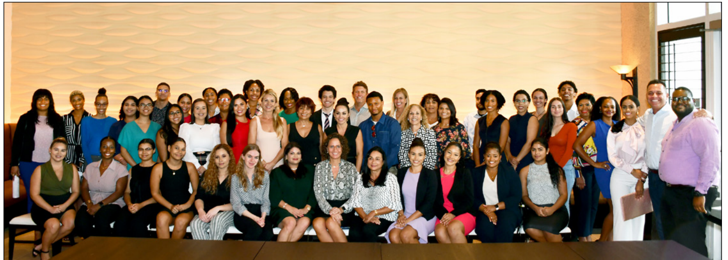
► The participants and volunteer coaches after the coaching sessions

Divided into groups, the participants spent equal time among five different stations that were coached by 14 business stalwarts and community leaders on several networking and social skill topics such as business etiquette, the art of intro-