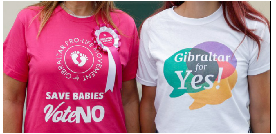
► Gibraltar abortion referendum was hotly contested

The islands have also been used as a transshipment point by human traffickers trying to smuggle people into the United States.