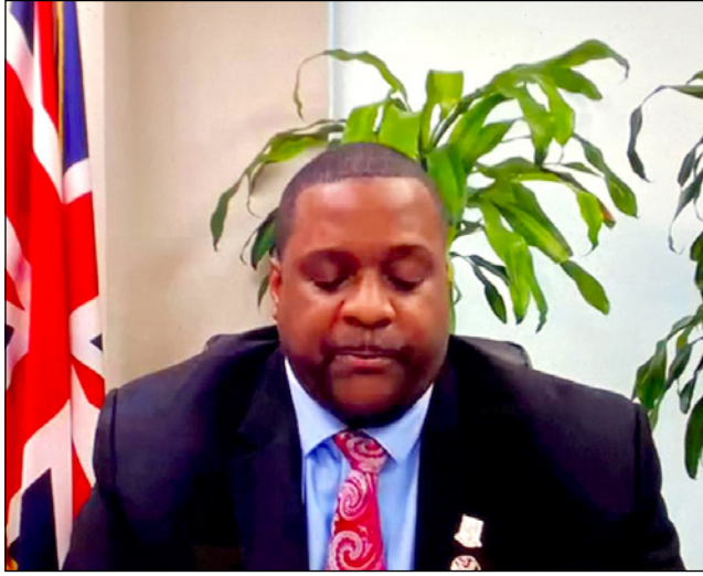
► British Virgin Islands Premier Andrew Fahie