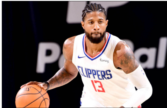
► Paul George is determined to silence his detractors

In 2013, George was 23, a member of the Indiana Pacers and on the wrong end