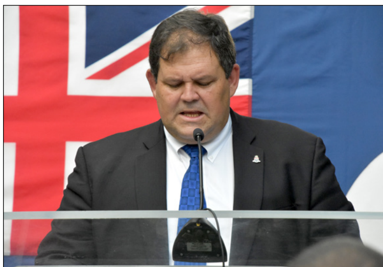
► Premier, Hon Wayne Panton

After the ribbon-cutting, senior Health City doctors took the Premier, the Health Minister, and several other members of government for a guided tour around the new facility.