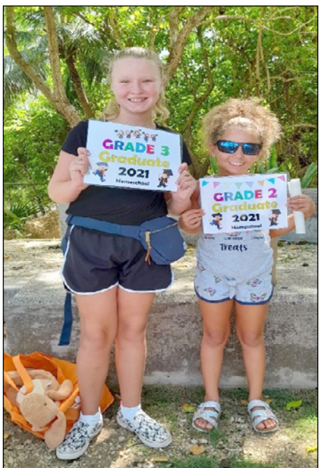
► Grade 2 and Grade 3 graduates proudly display their certificates

To learn more about the Homeschooling process in the Cayman Islands, please visit the DES website at www.schools.edu.ky .