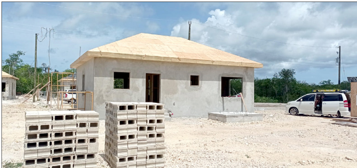
► Affordable houses under construction in East End

for our next upcoming projects, starting with West Bay and moving to North Side. We want to move away from the ideology of low income housing which has a negative stigma. We are currently in the planning stage for further projects and want to encourage young Caymanians to stop by the National Housing Development Trust office to collect application forms and sign up".