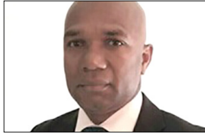
OFREG LAUNCHES CUSTOMER SERVICE SURVEY