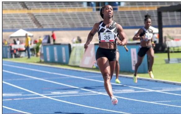
► Shelly-Ann Fraser-Pryce is in electric form

Only a month ago, at the same venue the 34-year-old "Pocket Rocket" became