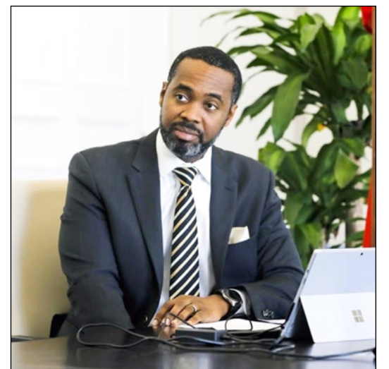
► Bermuda's Premier David Burt

In a statement following a preparatory meeting last week on the implementation of the tax, the Bermuda government said: