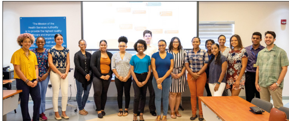
► The first set of students to arrive for the HSA Summer Student Internship Programme

etry student in my third year and working at the eye clinic has taught me so much. I plan on applying my knowledge."