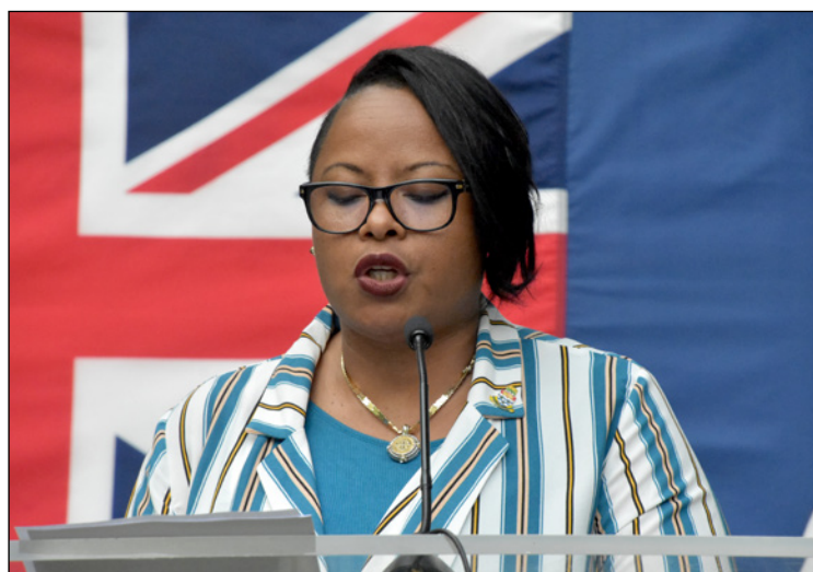
► Hon Minister of Health, Sabrina Turner