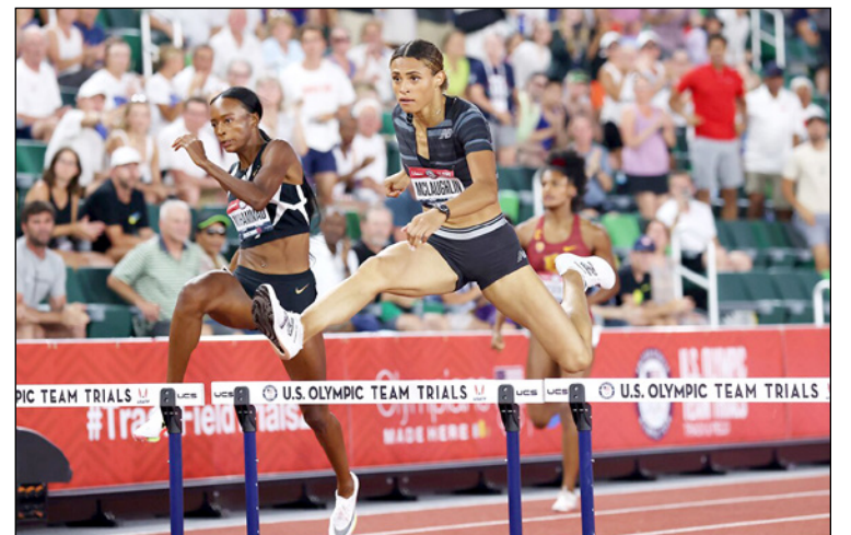
► Sydney McLaughlin set a new world record

"She definitely pushes me," Muhammad said of her rival.