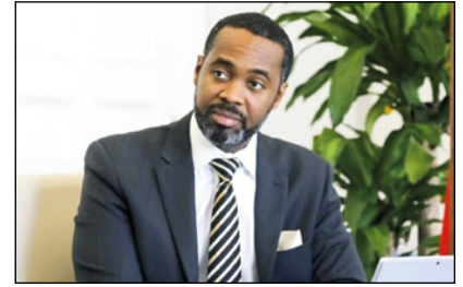
BERMUDA AGREES TO CONCEPT OF G7 CORPORATE TAX