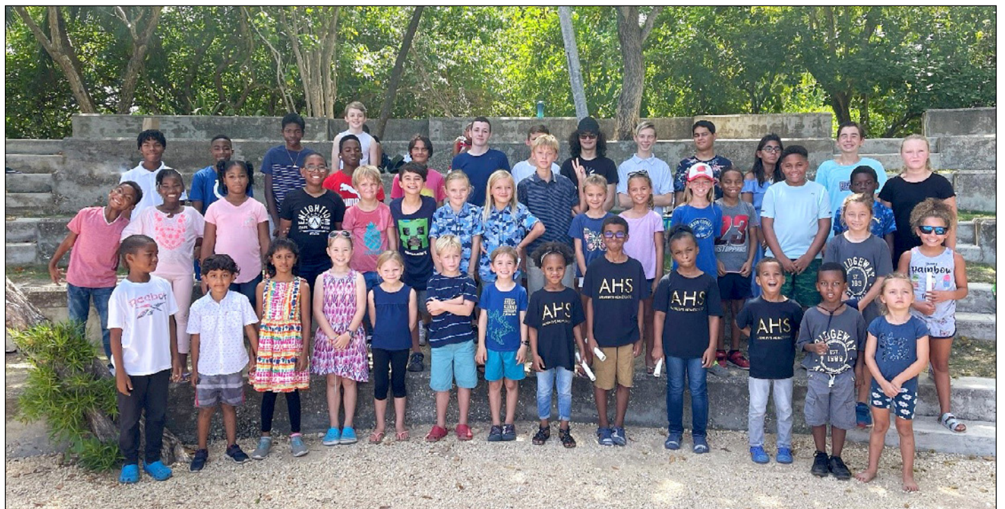
► Group of Homeschool awardees for the 2021 academic year with their certificates