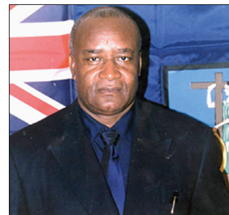
► Former Montserrat Chief Minister David Brandt

"When he was arrested he made it quite clear to us he thought he would escape prosecution. He did everything in his power to delay and disrupt the criminal justice process, including appealing many of the