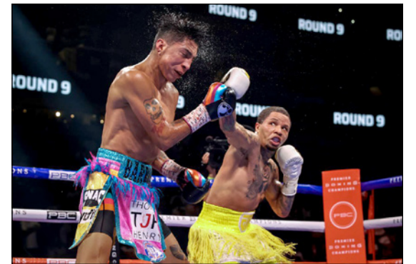
► Gervonta "Tank" Davis remains unbeaten

"Our thing is this, we work smarter, not harder. So we keep everything in-house.