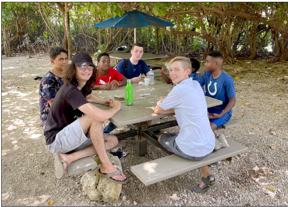
► Senior High Homeschoolers socialise with each other