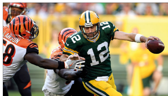
► Aaron Rodgers beat Favre's record in fewer games

Rodgers, who threw two touchdown passes to Davante Adams in the second quarter to finish the game on 445, set the