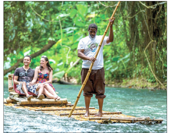
► Martha Brae rafting is a great experience

At the same time, the Global Tourism Resilience and Crisis Management Centre