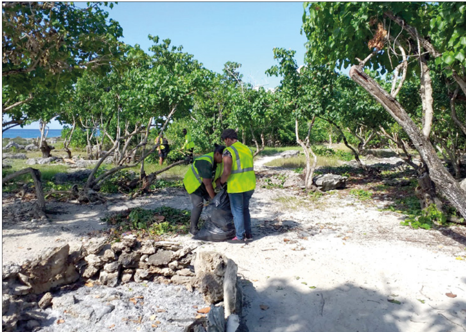
► Crew members at Smith Barcadere beach in George Town