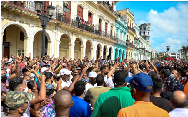
► Protesters are being persecuted now

Meanwhile, the US has condemned the "politically motivated trials" of hundreds of Cubans who were involved in unprecedented anti-government protests in July. Cuban authorities are seeking prison sentences of up to 25 years for some of the protesters.