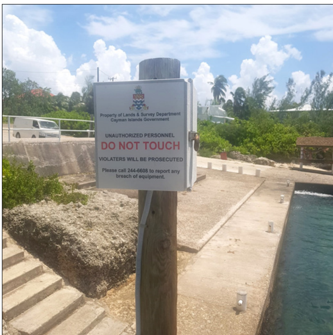
► Example of caution signs that will be affixed to tide gauge housings

For more info on the Ministry of District Administration and Lands: visit www.gov.ky/lands