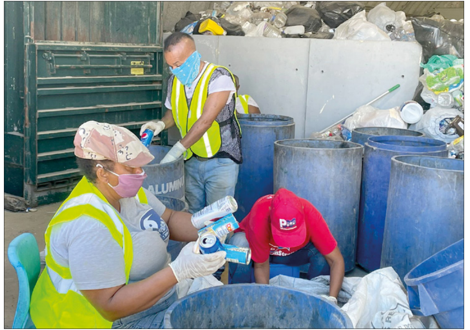
► Team members engaged in recycling at the Department of Environmental Health

The NiCE winter project started on December 6.