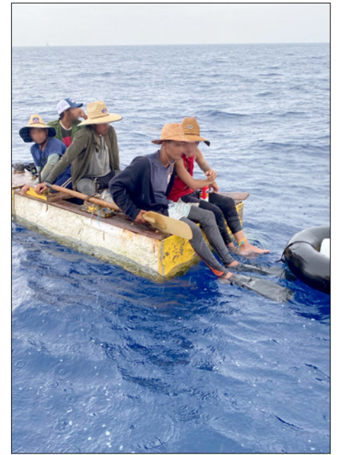
► Cuban boat people risk their lives to get out

A month ago, a group of 71 Cubans were denied entry to Russia and sent back home. Pictures posted on social media by members of the group showed them huddled and sleeping in the bathroom of the Moscow airport as they awaited the return flight.