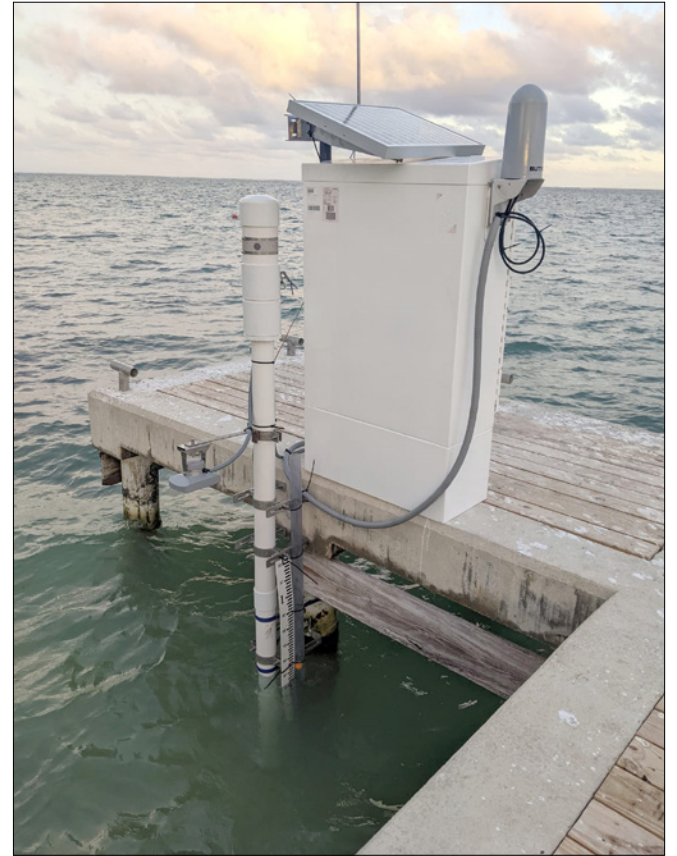
► One of the tide gauges installed at the Gun Bay Public Dock in East End