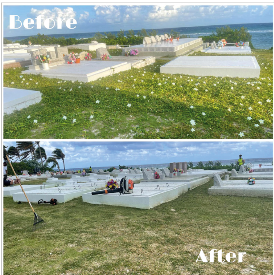
► Before and after cemetery clean-up in North Side