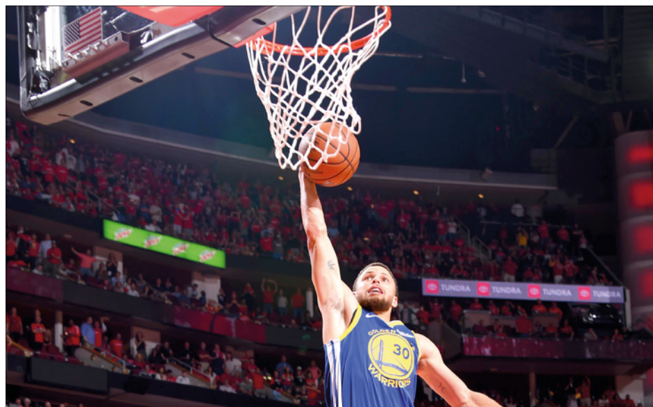
► Steph Curry is in outstanding form again

But beyond the gluttonous figures is the artistry of an athlete