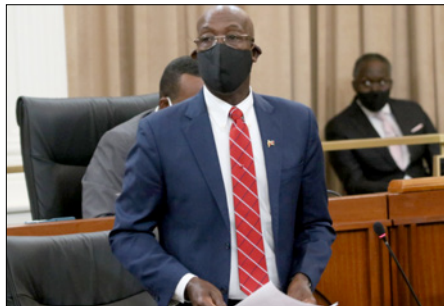
► Dr Keith Rowley's decision is controversial

The Joint Trade Union Movement (JTUM) met with Attorney General Faris Al-Rawi but with little sign of consensus. Accusing the PM of being "unilateral, high-handed, dictatorial" JTUM head An-