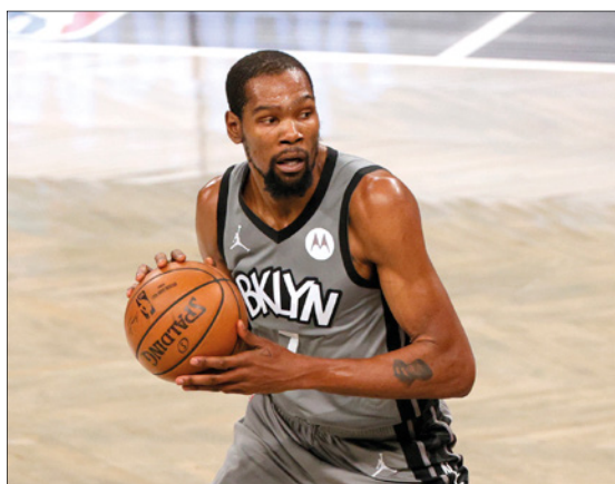
► Kevin Durant is making an impact for the Nets

Though they lost Durant to the Brooklyn Nets on free agency in 2019, and still rely heavily on their senior players, the Warriors don't look like a team that's been disrupted in the least by the harsh realities of basketball mortality.