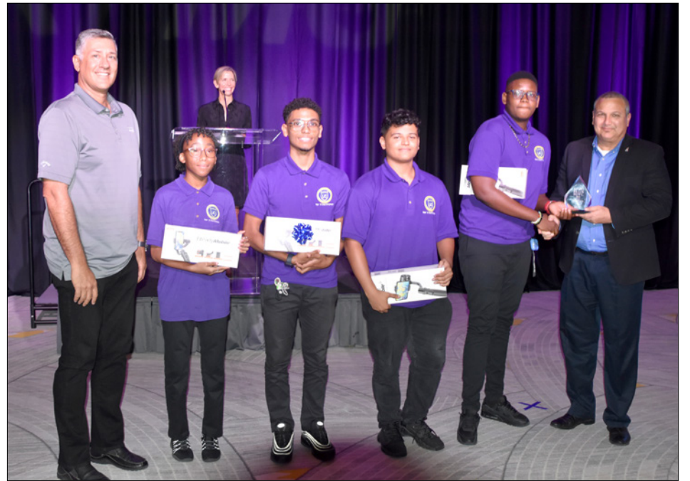
► Dual Enrollment gained Second Place