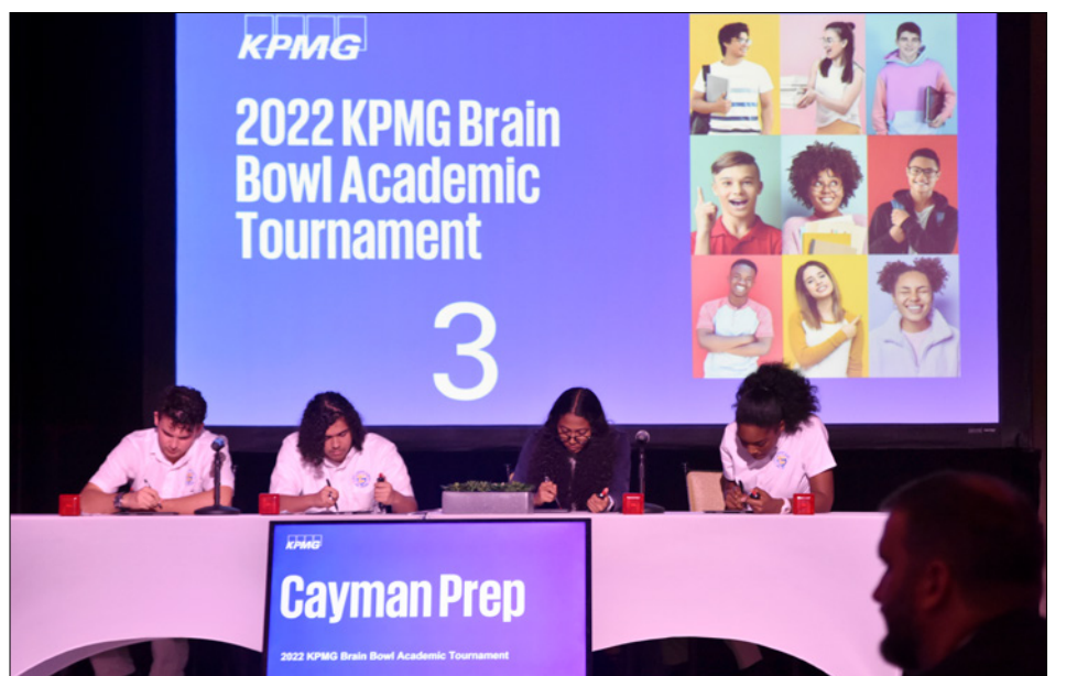
► Cayman Prep in action

"We are delighted to be able to host the Brain Bowl for the first time since the start of the pandemic. The tournament encourages participation of students with a diverse range of abilities and experiences - whether they prefer to stay behind the scenes or act as the decision-maker, competing as a team fosters success in a fun