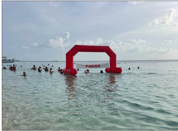
► CIASA Finish Line

Relays are exciting, fast and fun – and the return of the open water relay to Cayman's open water calendar on Saturday 8, October marked the first year it was sponsored by Fraser Properties.