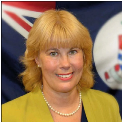
OAG report finds government slow in taking action