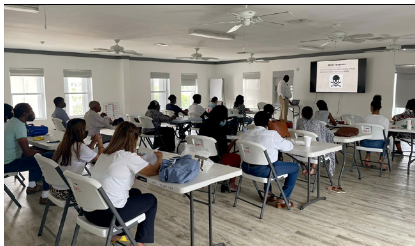
► Archive picture of participants of the Basic Food Hygiene Training

service@gov.ky, visit the DEH's website at www.deh.gov.ky or message our Facebook page at https://bit.ly/3LEK55q