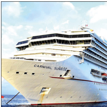
28,000 Cruise Ship Passengers arrive on 9 ships