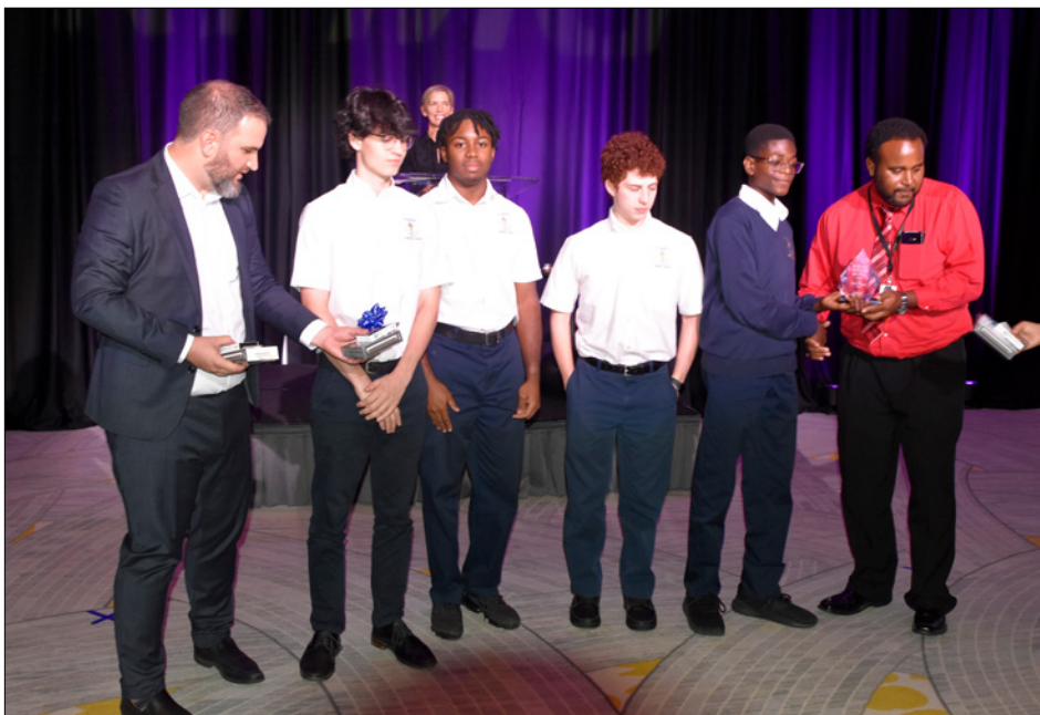
► St. Ignatius gained Third Place