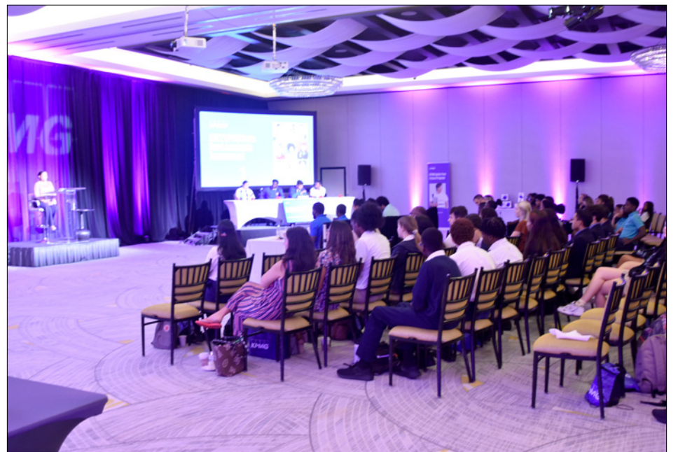
► The KPMG Brain Bowl