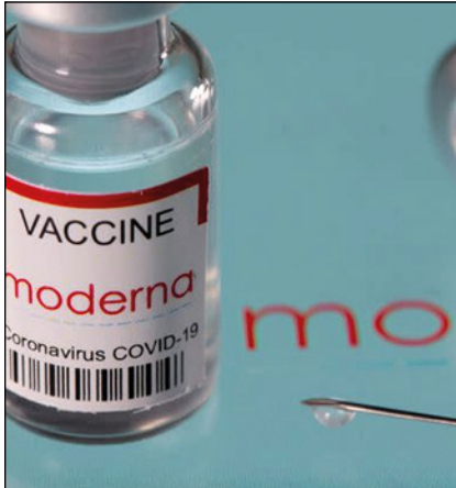
COVID-19 Fall Booster Programme Announced