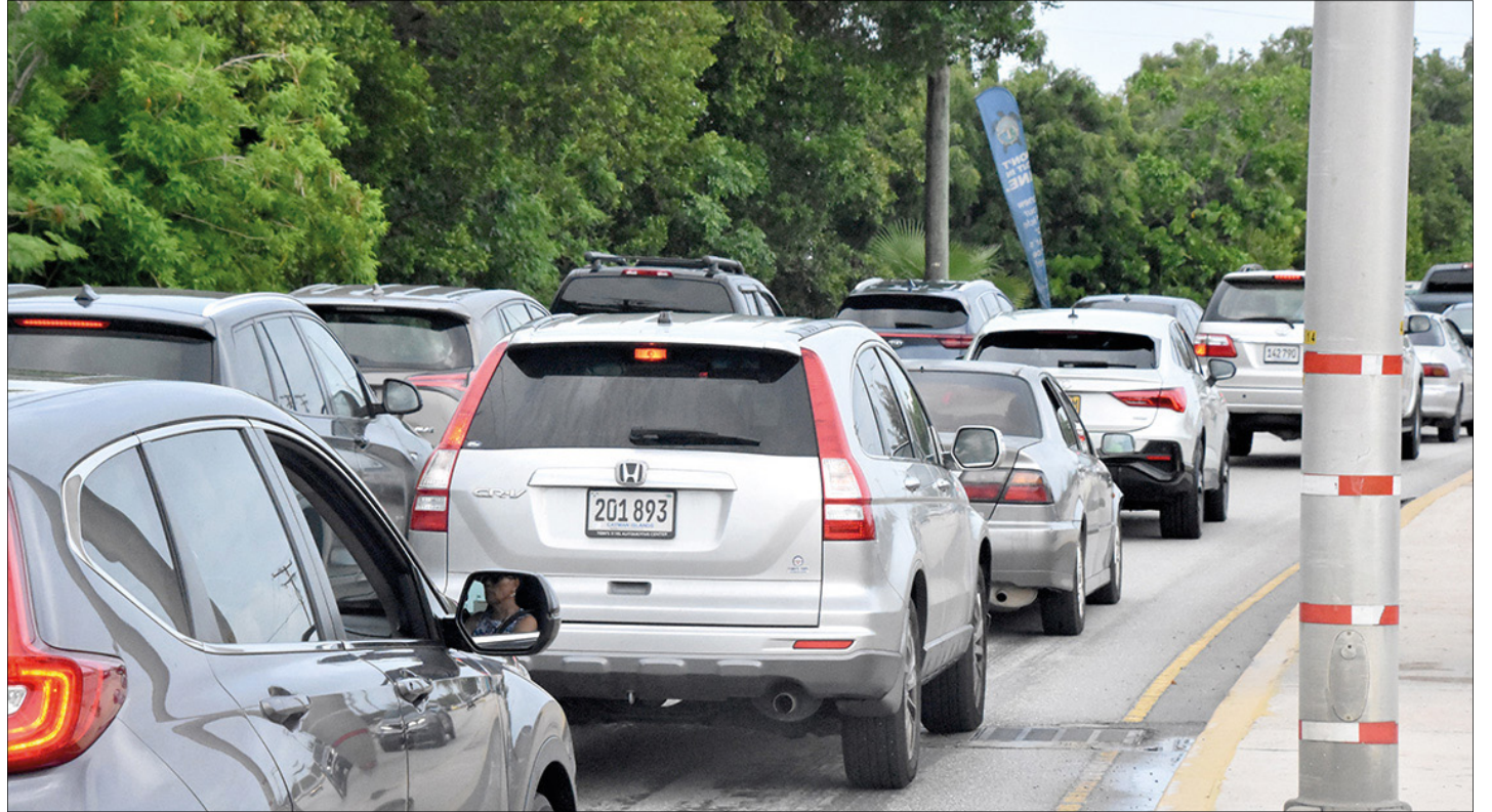
► Motorists are fed up with gridlocked roads

Panton admitted full responsibility for the crippling roadblocks for thousands in central George Town. Friday evenings are