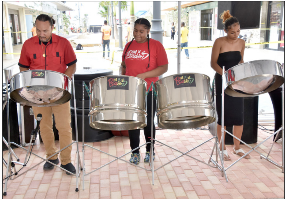
► Pan 'n' Riddim