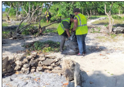
Christmas Cleanup begins November 28