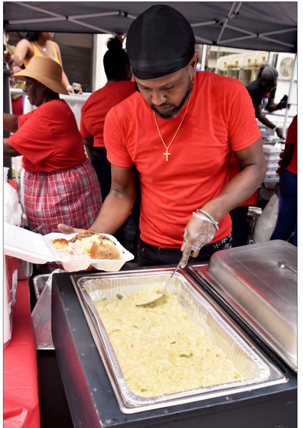
► Serving up the wonderful George Town Food