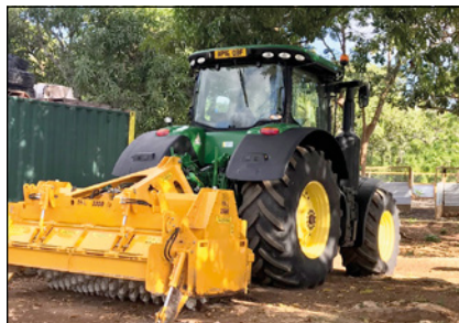
Beacon Farms launch soil improvement services