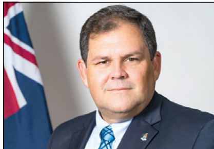
Panton apologises for Traffic Jam