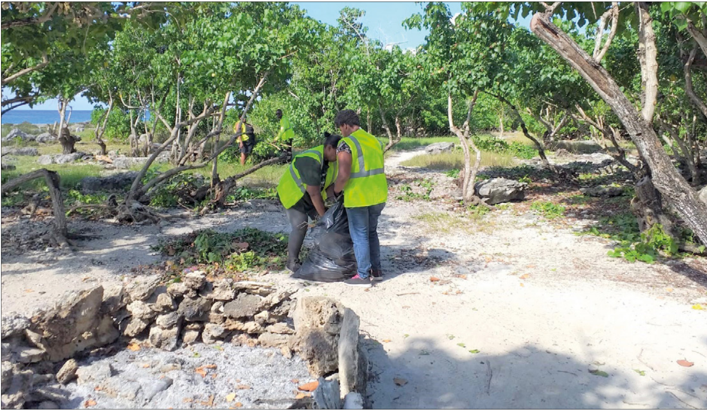
► Participants in NiCE project cleaning the Smith Barcadere beach last year.