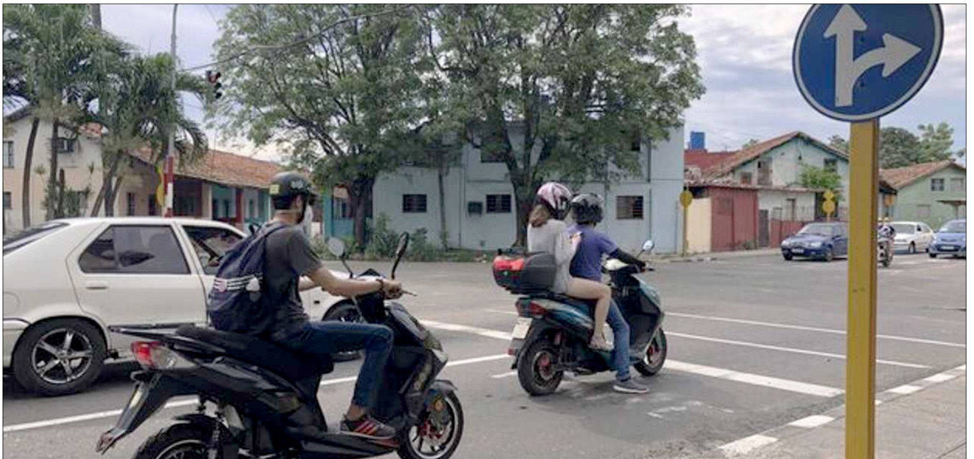
► Scooters are now very popular in Cuba

based there. After many attempts and processes, he finally received the license to sell them to all 11 million Cuban nationals.