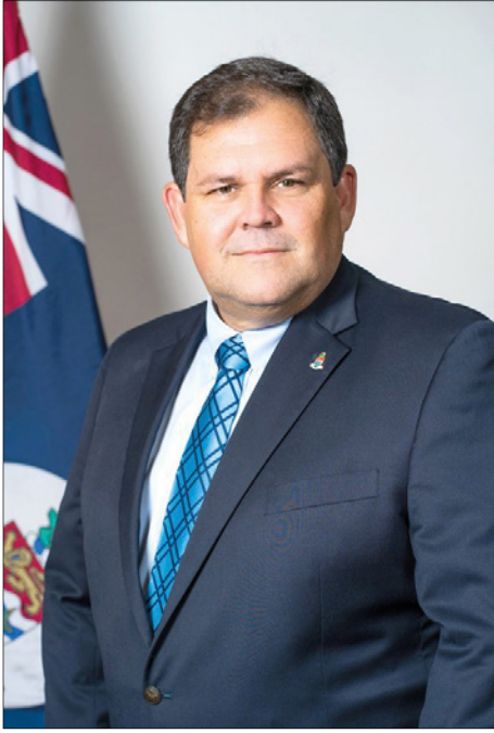
► Premier Panton was stuck in traffic too

The worst gridlocked traffic Grand Cayman has experienced was addressed by Cayman Islands Premier Wayne Panton on Friday evening in a voicemail posted to the media apologising for the horrendous standstill. He was fully aware of the massive problem because he too was caught up in it.