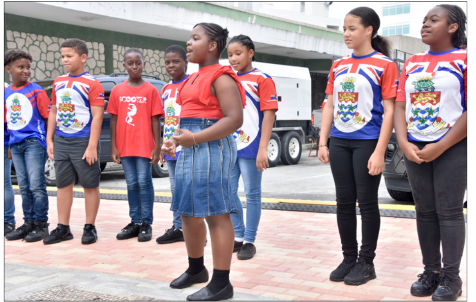
► George Town Primary School's choir sang a medley of traditional favorite songs