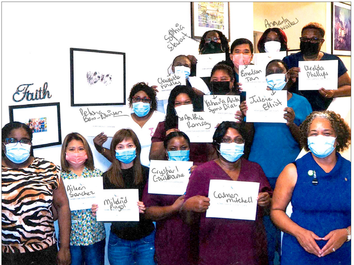
Participants in photo of the class are: