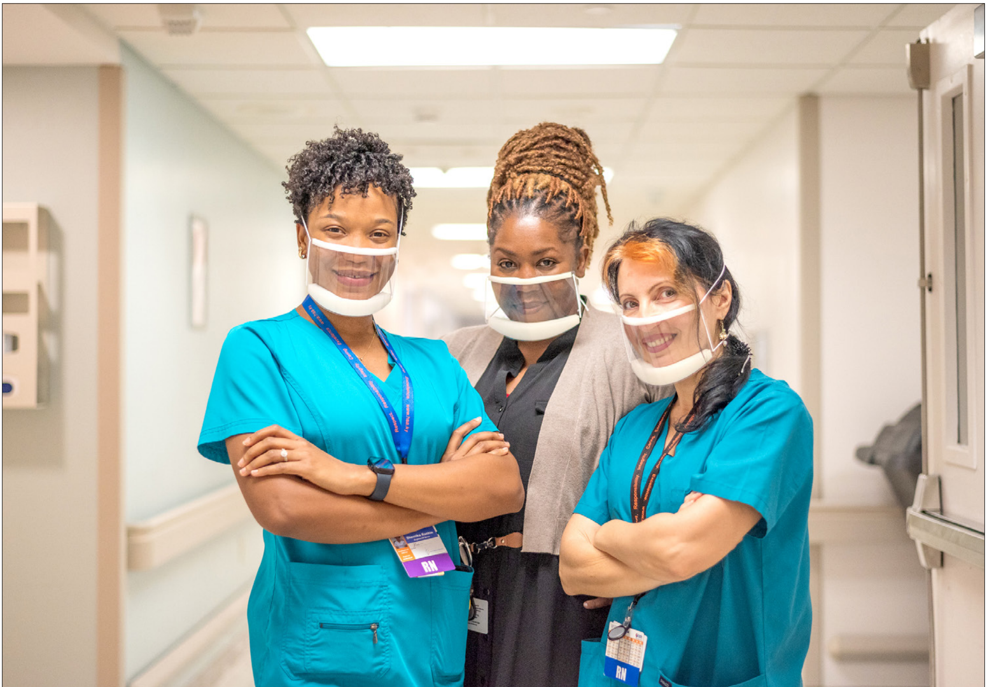
► HSA staff wearing clear masks

who are deaf and hard of hearing, are then able to read lips and see facial expressions. At HSA, we are constantly working towards improving our inclusivity and our patients’ overall experience, which is why we’ve included this option of clear masks for those who need it.”