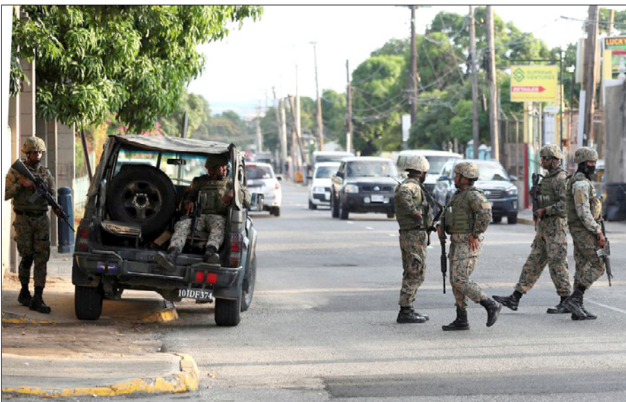
► Jamaican security services are stretched

Police Commissioner Antony Anderson announced that Jamaica recorded an average of nearly five murders per day in September. The previous states of emergency, as well as new firearms legislation, have caused violent crime to decline, he said. There were 1,463 murders in Jamaica in 2021, with gang activity accounting for 71% of these, according to official data.