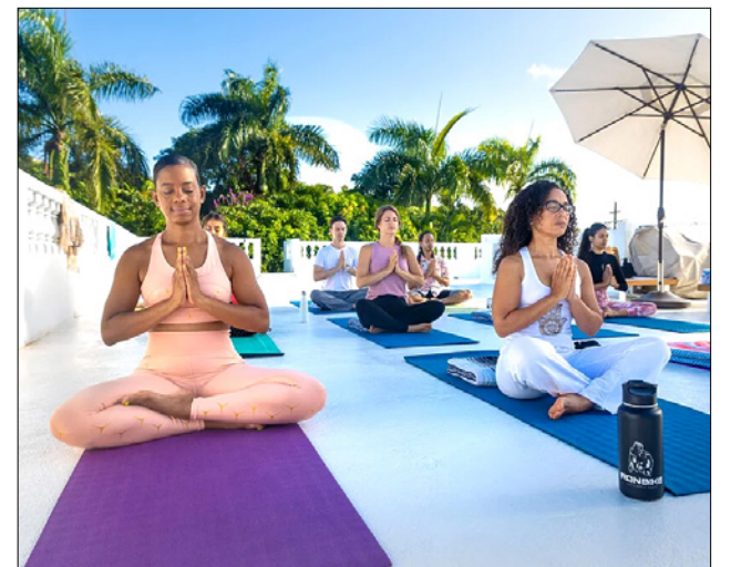
► Antigua and Barbuda's yoga classes are popular

In February, the focal point is Carlisle Bay for a three-night all-inclusive Wellness Retreat including daily mindful meditation, gentle yoga classes to suit all levels and abilities, daily activities including reef snorkelling at Cades Bay, a guided rainforest hike to Signal Hill and a local cooking