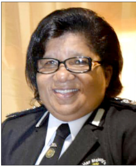
► Claira Range