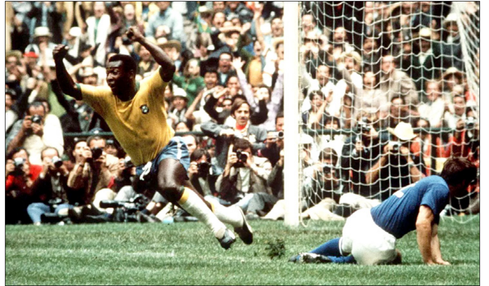
► Pele's brilliance celebrates another goal

He won the World Cup again in Chile in 1962, when Brazil beat Czechoslovakia