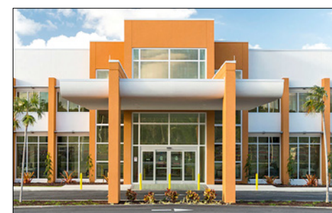
► Health City Cayman Islands main entrance

The Senior Consultant Gastroenterologist, with more than 25 years of experience treating gastrointestinal disease, confirms that during the procedure, the interventional gastroenterologist recon-