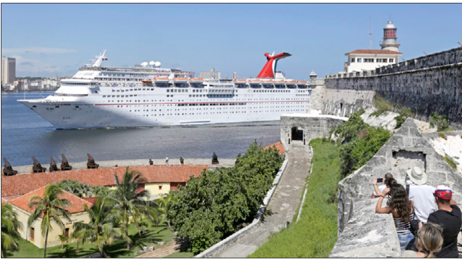
► Carnival has been hit for over $100m