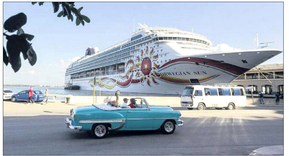
► Norwegian is contesting the judgement