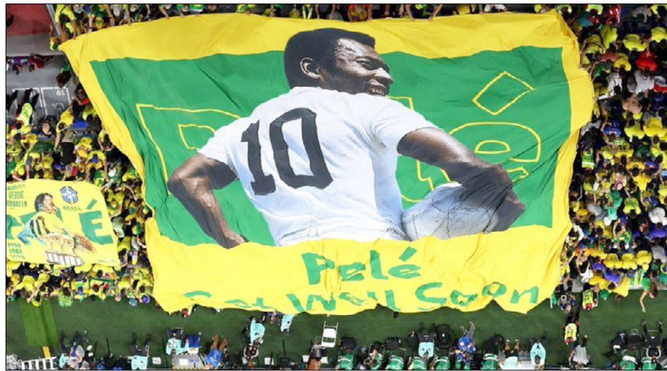
► Brazilian fans celebrate the king's life

No wonder he was feted by heads of state and absolutely every type of dignitary as well as the general public throughout his amazing life. Despite the adulation he stayed humble and personable to the last. The king coined the phrase of football being "the beautiful game" but he showed a grace and beauty unlikely to ever be repeated.