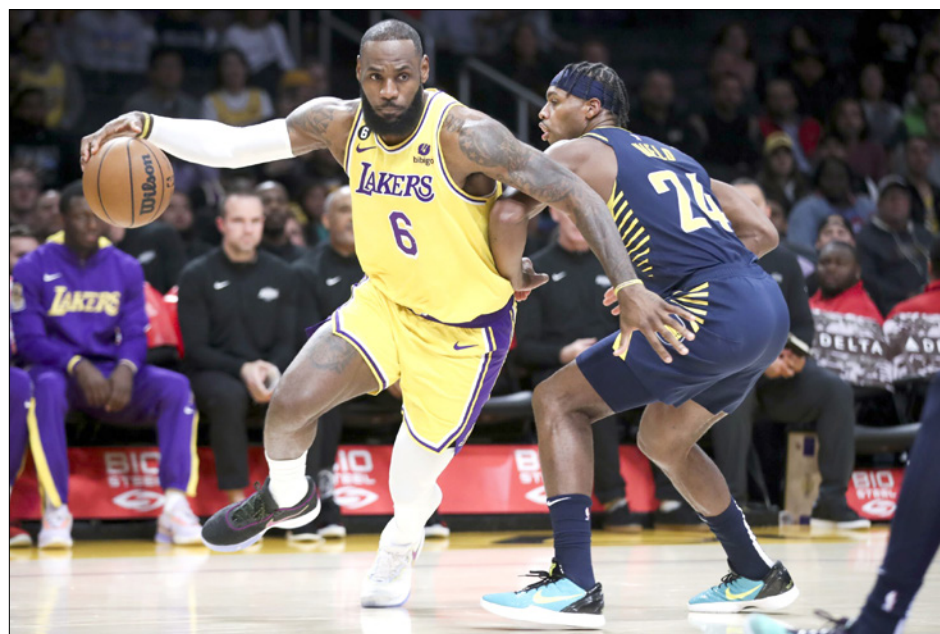
► LeBron James is still highly motivated at 38

The Cavs have a huge amount of salary cap room for next summer to make it pos-