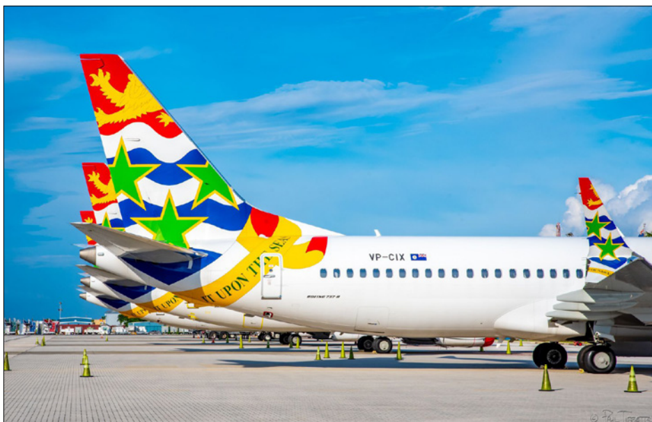
receive the first checked bag free. Similarly, Sir Turtle Club members continue to receive a complimentary first bag on every flight. The airline's already-low

Business Class passengers will continue to receive three free checked bags on all routes. Sir Turtle Rewards Platinum Level Members will also continue to receive two free checked bags, while Sir Turtle Rewards Gold Level Members will