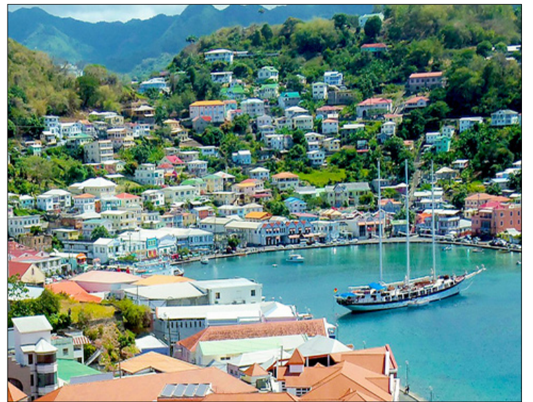
► Grenada's natural beauty is one of its many features

Grand Anse beach is a long sweep of golden sands, fronted by smart hotels and a few beach bars. Umbrellas is a popular diner, which shows popular sports events. Further west is the quieter Morne Rouge, with a relaxed vibe and rustic beach bar that sells delicious fish tacos. There are other chocolate factories, as well as sugar mills, rum distiller-