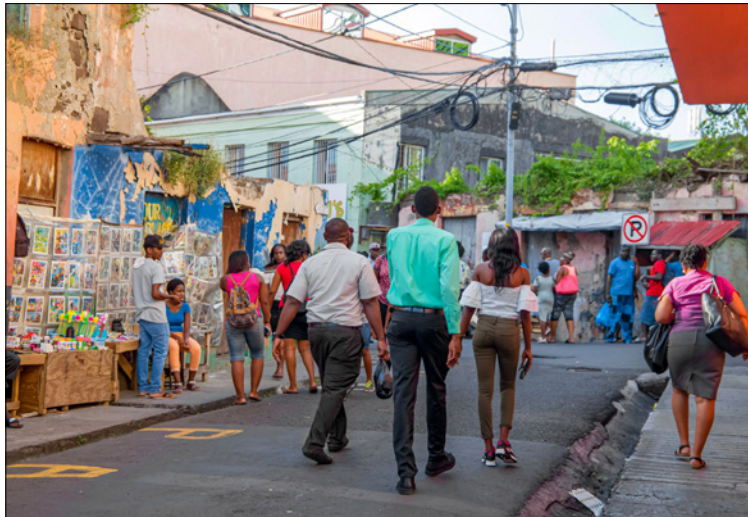
► St George's attracts many Americans

ies, hiking trails, diving sites and much more.