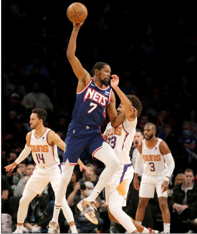
► Kevin Durant seems to have a point to prove

All his other stats are impressive too. Durant believes the Nets have finally caught a rhythm after their sloppy 9-11 start. "We understand how we want to play every night," Durant said. "I feel like the league is always on notice with the talent we