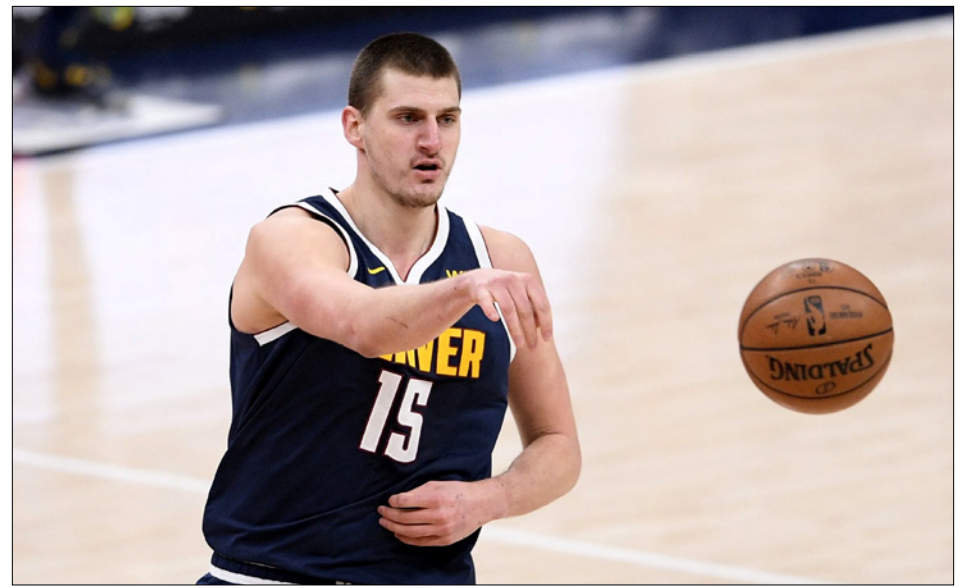
► Nikola Jokic leads the MVP rankings

have on our team. I don't think anybody takes us for granted when they're preparing for us each night. We've found some things that were good for us on both ends of the floor, and want to just be consistent with executing those things as we move forward."