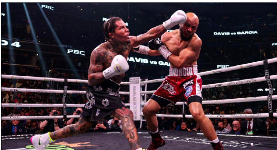
► Gervonta Davis retained his unbeaten record

Speaking about facing Ryan Garcia, he said things were "going in the right direction", while Garcia tweeted: "No more talking, let's get it on."