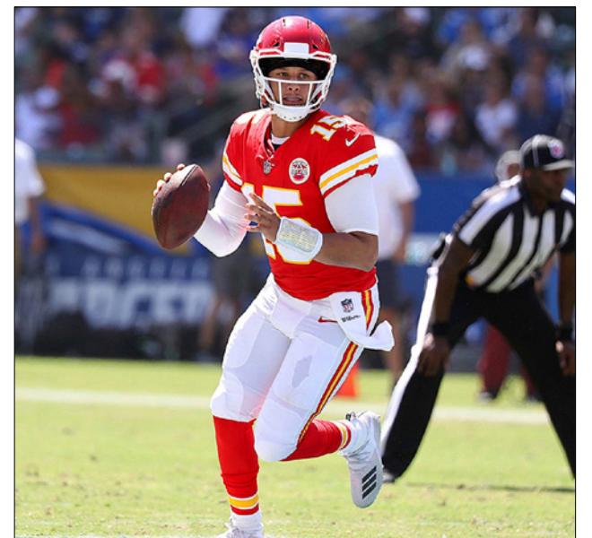
► Patrick Mahomes is eyeing a Super Bowl ring

The cancellation of the Buffalo Bills-Cincinnati Bengals game due to Damar Ham-