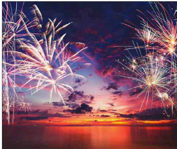
► Fireworks display along Seven Mile Beach in Grand Cayman for New Year's Eve.