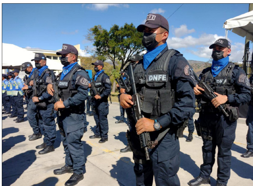
► Honduras police are stemming the crime wave

Honduras has extended by another 45 more days the state of emergency imposed to thwart its rampant organised crime. Decided by President Xiomara Castro, it implies the suspension of most of the constitutional guarantees.