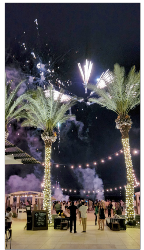
► Fireworks at the Westin Grand Cayman Beach Resort on New Year's Eve.

He added that as long a Cayman is a tourism destination, it is important to think about the bigger picture.