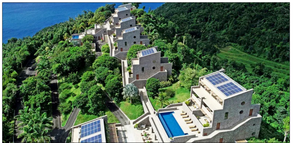
► Coulibri Ridge is the Caribbean's first totally sustainable hotel

Dominica has opened the first Caribbean property to join Beyond Green's global portfolio of sustainable hotels. Coulibri Ridge located in Petit Coulibri, in the south, has that distinction.