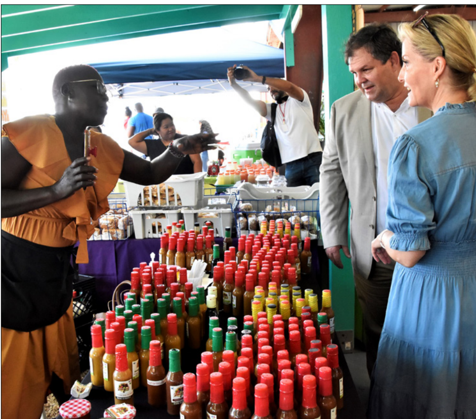
► The Countess of Wessex and Premier Panton talk to one of the vendors about her wonderful Cayman-made sauces