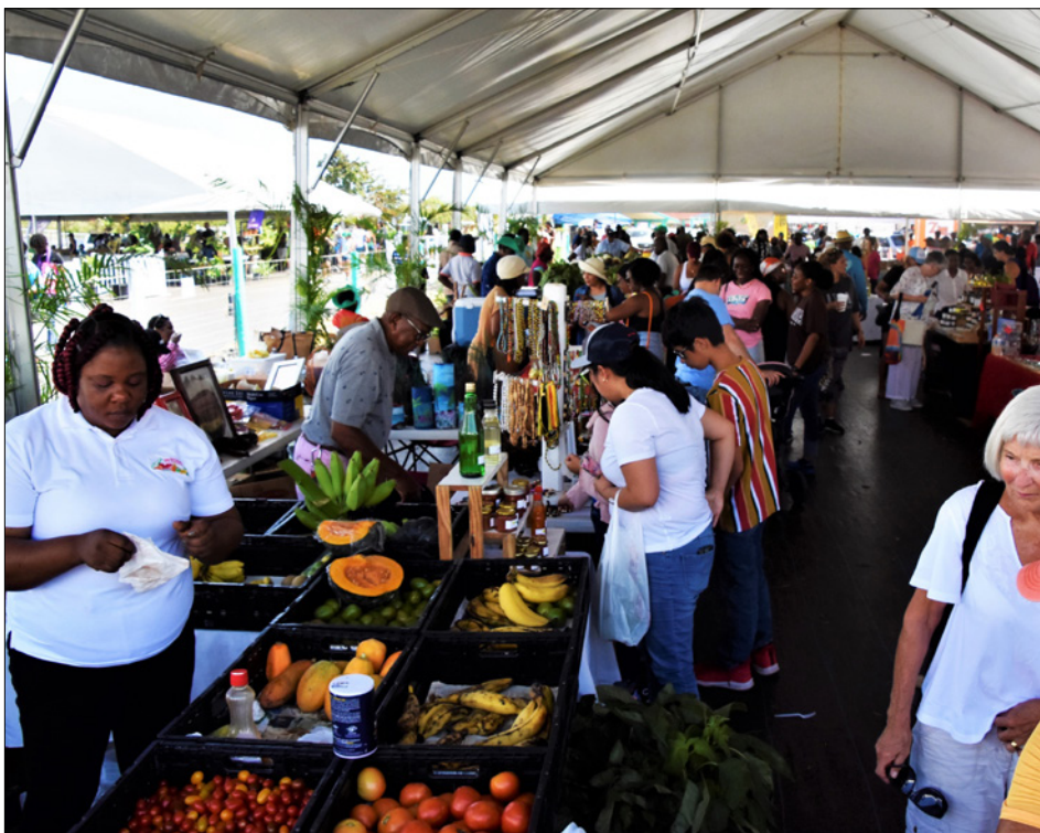
► Inside one of the big tents, where the vendors sell fruits, vegetables and homemade crafts