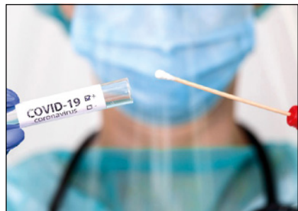
Public Health removes requirements for COVID testing