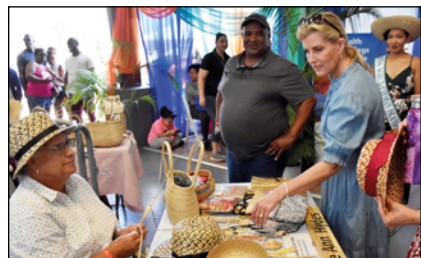
Countess of Wessex opens 54th Annual Agriculture Show