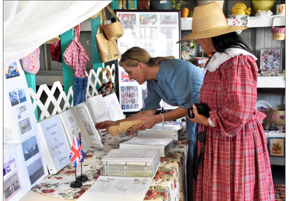
► Her Royal Highness the Countess of Wessex is shown some of the West Bay Heritage Committee displays by Ezeithamae Bodden