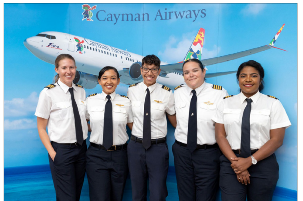
► Cayman Airways now has 5 females pilots in its fleet.

been serving the people of the Cayman Islands and beyond for over 50 years.