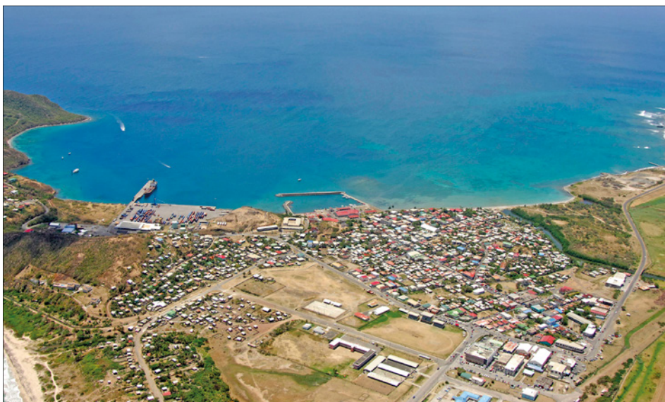
► Vieux Fort has an alarming gang problem

The St Lucia government Friday announced the closure of schools in the southern town of Vieux Fort after three people were shot and killed and a nine-year-old boy injured as a result of gun violence.