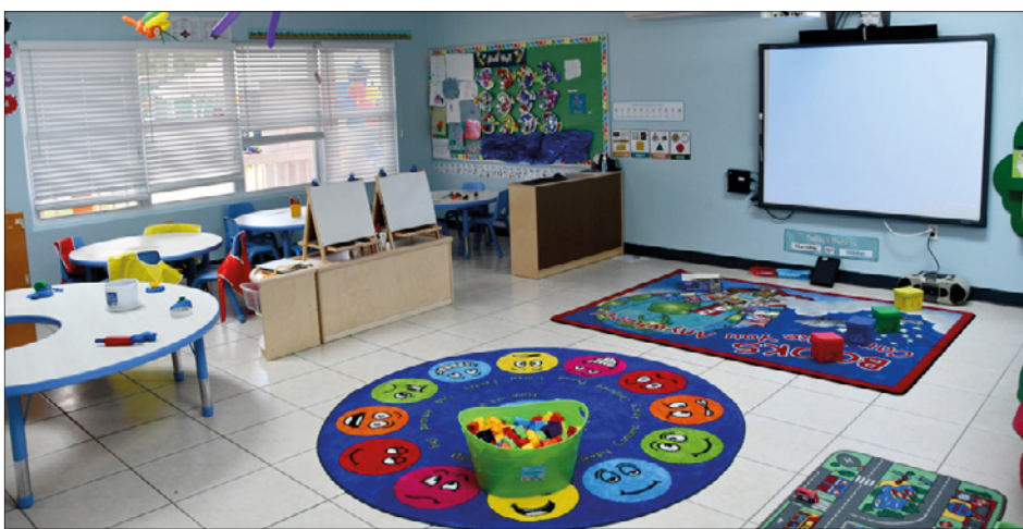
► Nursery at Creek & Spot Bay Primary School

The Ministry of Education is advising parents to only enrol their infants, toddlers and young children in registered Early Childhood Care and Education (ECCE) Centres.