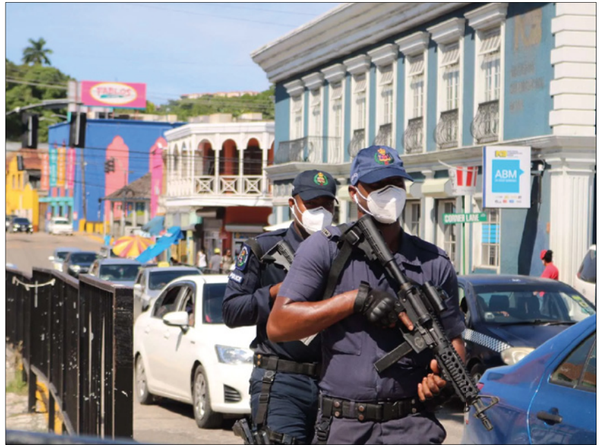
► Security around the court was tight