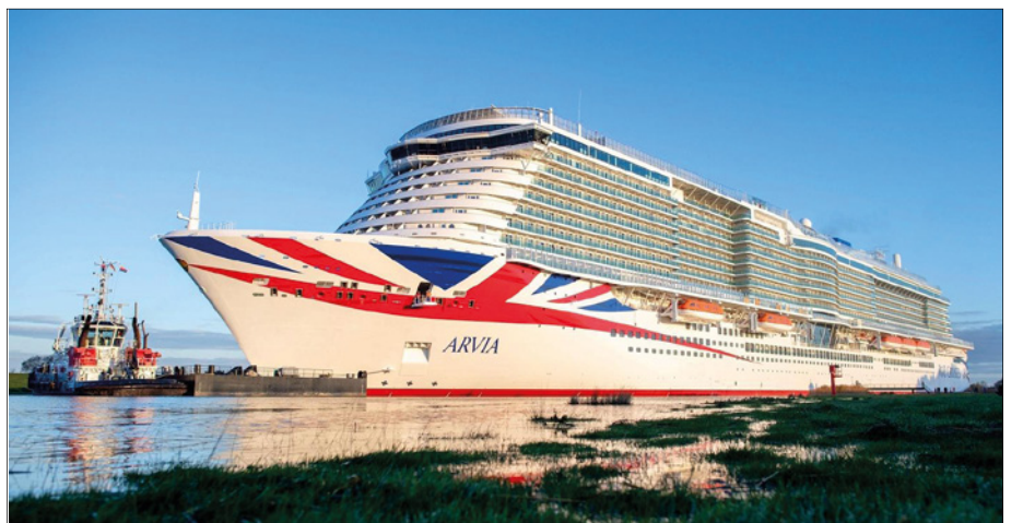
► The Arvia launched with a giant bottle of Mount Gay

Barbados saw P&O Cruises celebrate the naming of its newest ship, the Arvia, in Bridgetown on Thursday, by popping up the world's largest bottle of rum.