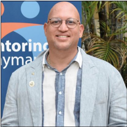
2023 Mentoring Cayman Closing Reception