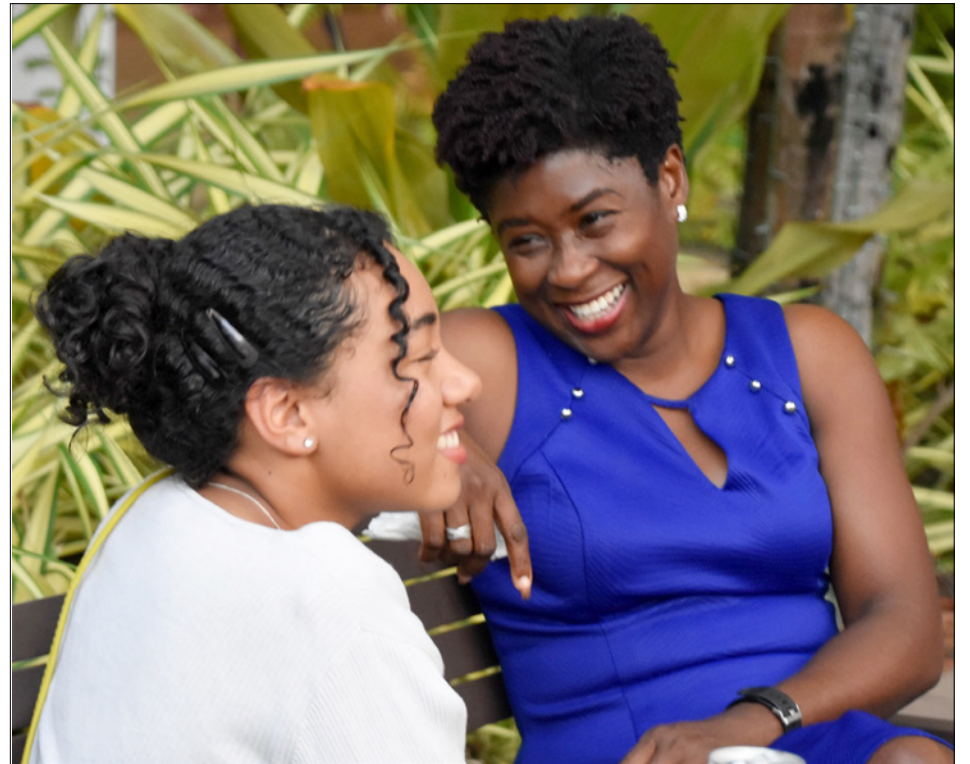
► Mentee and Mentor

The Chamber of Commerce's 2023 Mentoring Cayman programme celebrated another year of successful mentoring partnerships during its Closing Reception at the Courtyard of the Grand Pavilion, West Bay Road, on Saturday 15 July. The event, which took place in the courtyard of the Grand Pavilion, was a great opportunity for everyone - mentors, mentees, parents, and family - to meet once last time before the official close of this year's programme, which began in November last year.