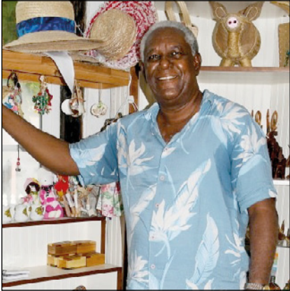
Older Persons Council Mourns Member