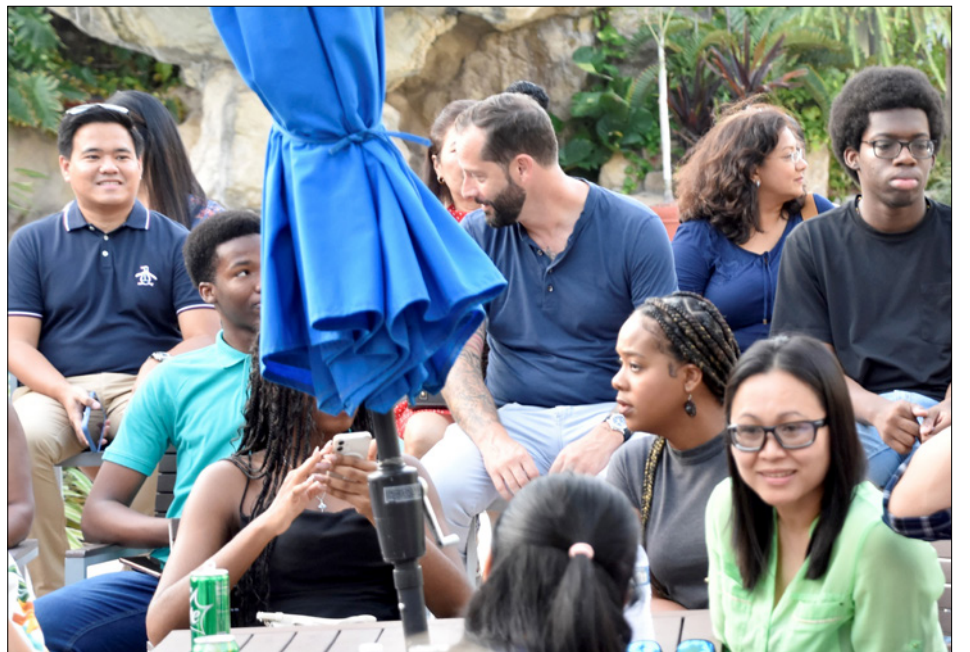
► The closing reception at the Grand Pavilion