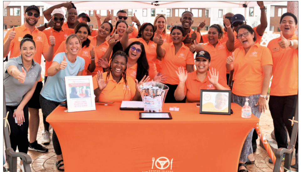
► Leadership Cayman's Wheels For Meals fundraiser, at Grand Harbour on Saturday 28 June

The Cayman Islands Chamber of Commerce represents more than 600 businesses and associations across all industry sectors in the Cayman Islands. Its members employ over 18,000 persons or about 45-percent of the country's labour force. The Chamber supports, promotes,