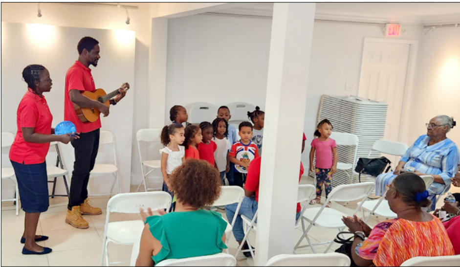
► Children sang songs for seniors during the Christmas of Yesteryear event.