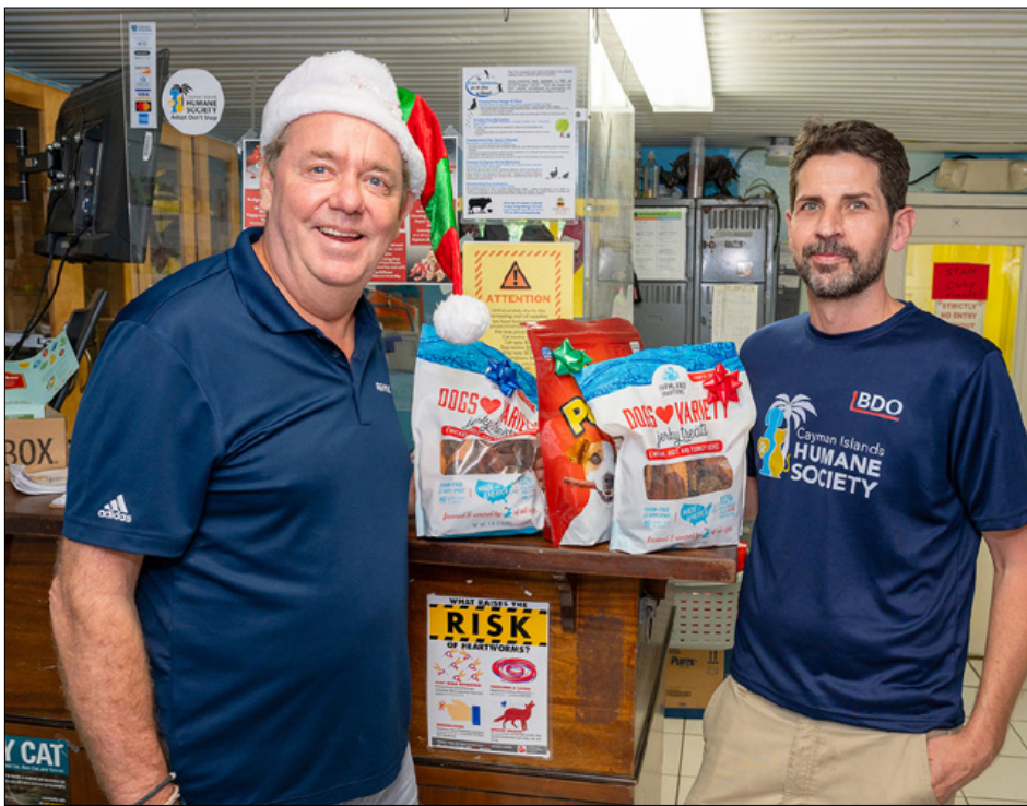
► Humane Society