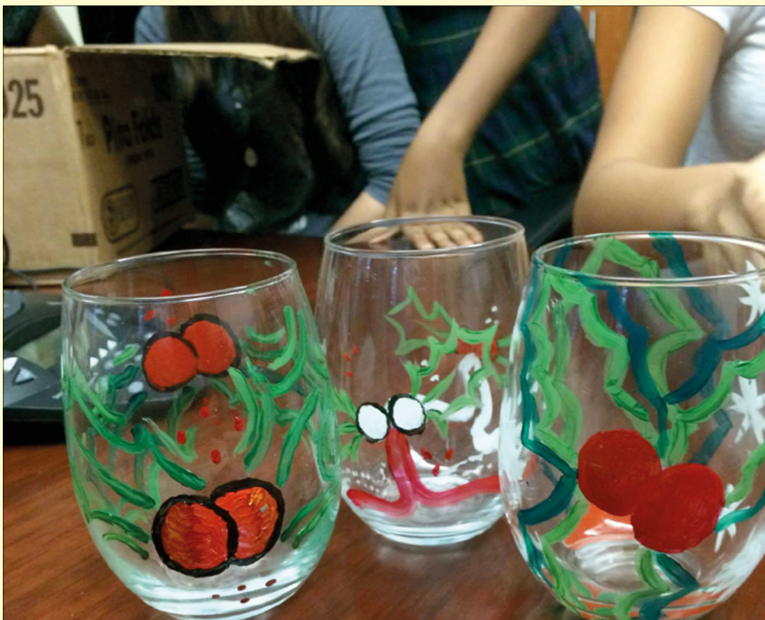
► Visit Junior Achievement Christmas Market

16 December - The St. Ignatius Christmas Fundraiser will be held on Saturday 16 December on the school compound. There will be a special event - Christmas Cheers - featuring Christmas carols and Christmas treats beginning at 7pm. The drawing for the grand prize of CI$25,000 and other prizes will begin at 8:15pm. Tickets cost $25 and