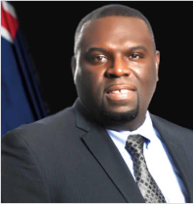
► Hon Dwayne Seymour

The Ministry of Border Control and Labour on behalf of Workforce Opportunities & Residency Cayman (WORC) announces that Cabinet has approved the appointment of new members to the Immigration Boards; namely the Caymanian Status and Permanent Residency Board (CSPR), the Business Staffing Plan Board (BSP), and the Immigration Appeals Tribunal (IAT).