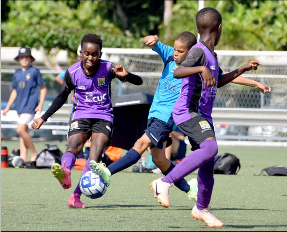
► Action from the Under 11 Champions Cup final between St. Ignatius Catholic (purple) and Cayman Prep 11A.

History was again made during the finals of the 2023 CUC Primary Football League (PFL) this past Saturday, December 9 at the Annex Field – the traditional home of football in the Cayman Islands.