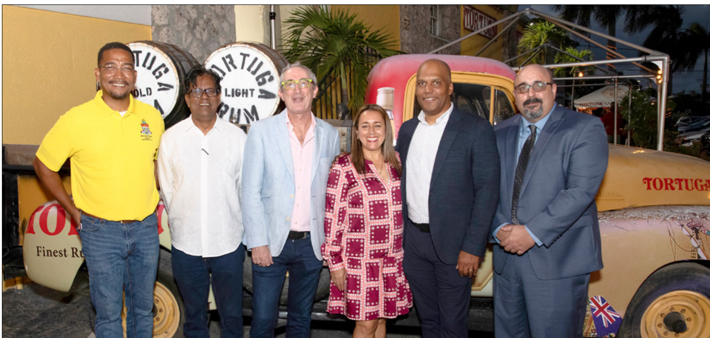
► Tortuga Grand Opening

Last week saw the official launch of the Tortuga Visitor Centre and Bakery Tour at Tortuga Rum Company, sharing the company's unique story and taking visitors behind the scenes of its renowned rum cakes.