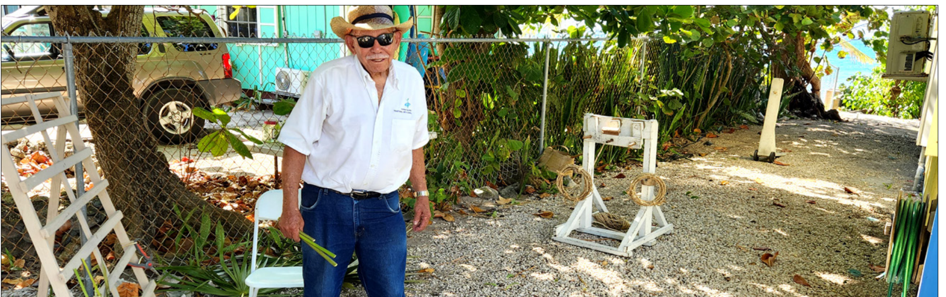
► A thatch rope making demo at the Christmas of Yesteryear at Miss Lassie's House.