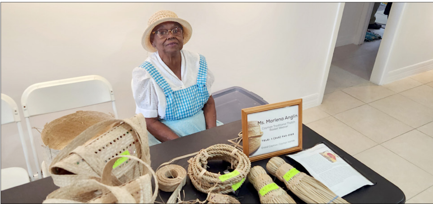
► A thatch craft makers sits with her creations at the Christmas of Yesteryear event at Miss Lassie's.