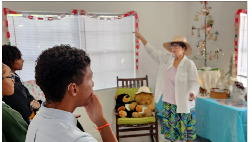
► Children learnt about Caymanian Christmas traditions at Christmas of Yesteryear