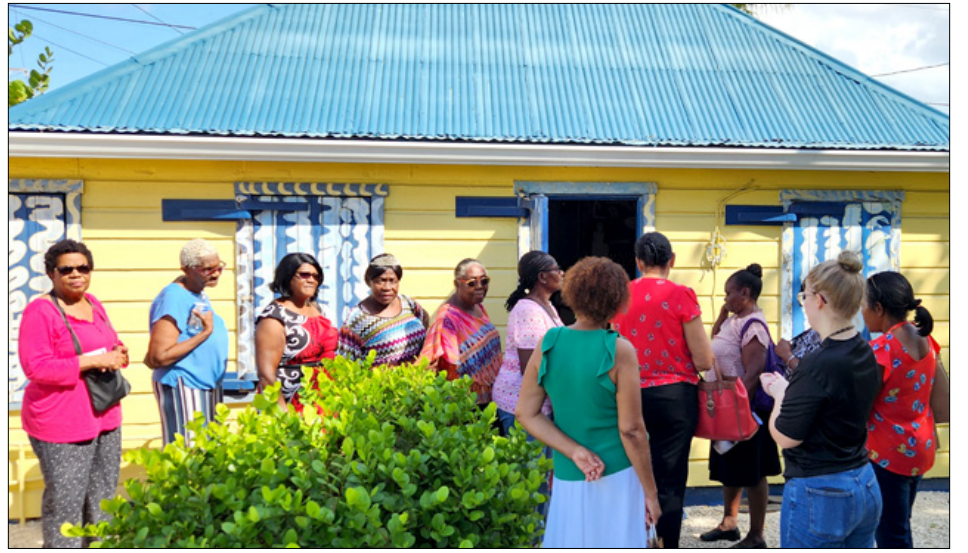
► Seniors tour Miss Lassie's House during the Christmas of Yesteryear celebration hosted by CNCF.