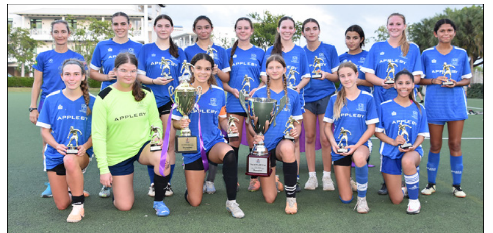
► Appleby Under 18 high school football champions CIS.

Cayman International School (CIS) secured a double championship this week as the Under 18 boys defeated St. Ignatius Catholic High School 6-0 on Monday, December 11 to complete an undefeated season and take the Appleby Under 18 Boys' title back from 2022 champions Clifton Hunter High School (CHHS).