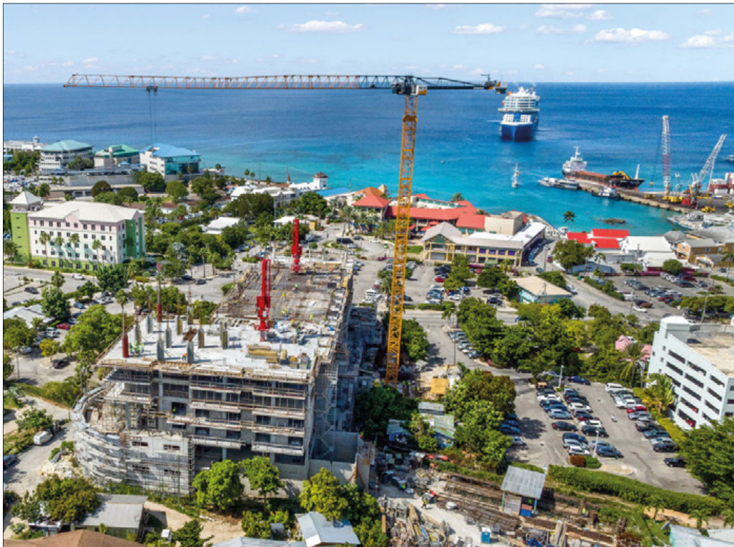
► Birdseye view of the ONE | GT Hotel and Residences project as of November 2023.