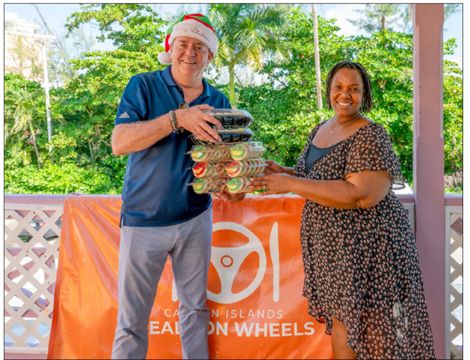
► Meals on Wheels