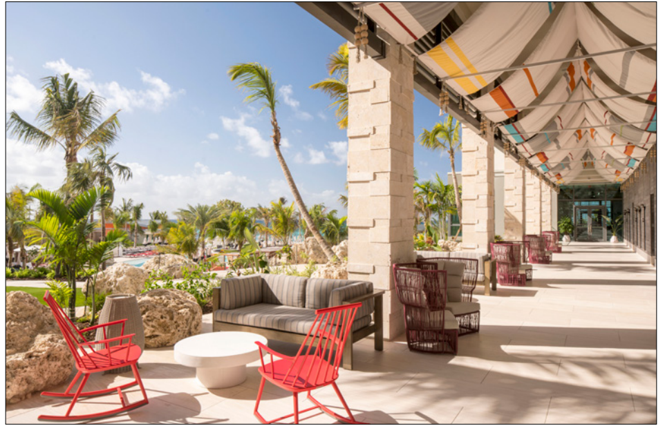
► Kimpton Seafire Resort + Spa offers all the comforts you could dream of in an idyllic paradise setting.