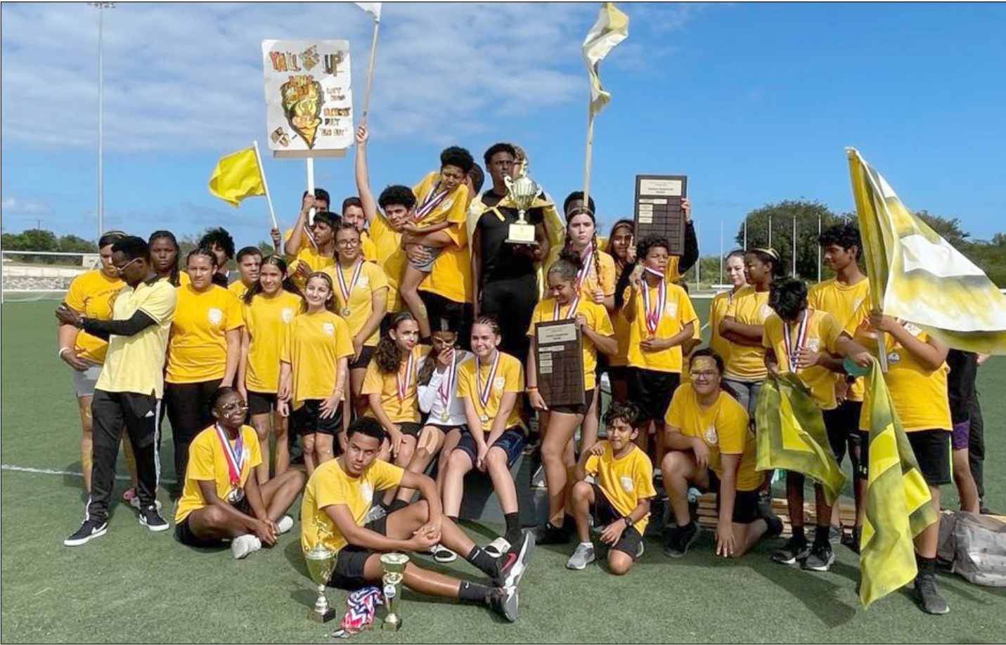
► Hurricanes Champion House

Hurricanes, the eventual champions. A wonderful day of fun and stiff competition finally concluded around 3 p.m.