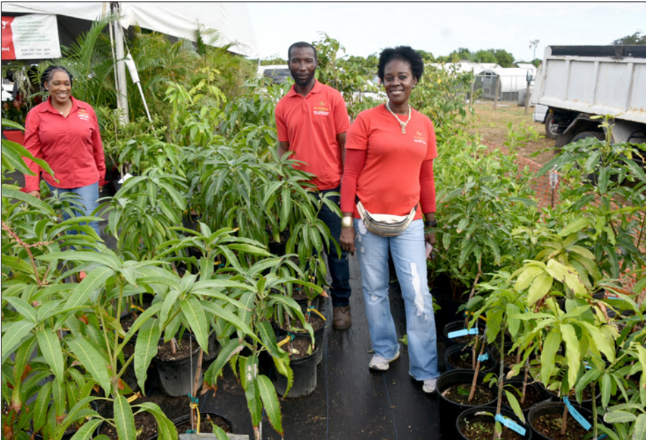
► Growing Beauty