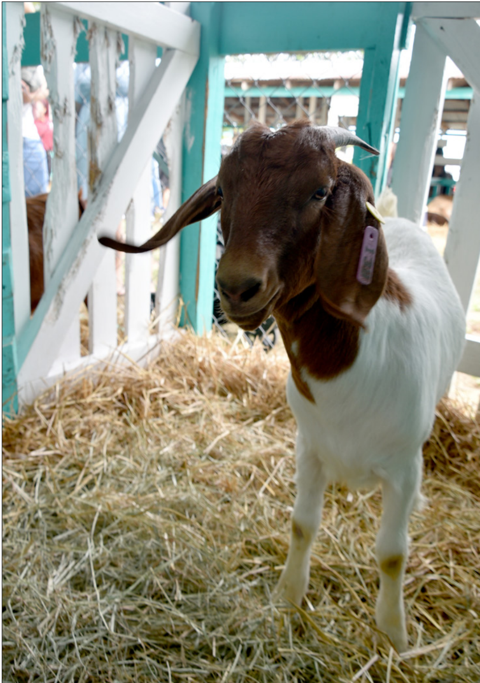
► Goats are always a favorite