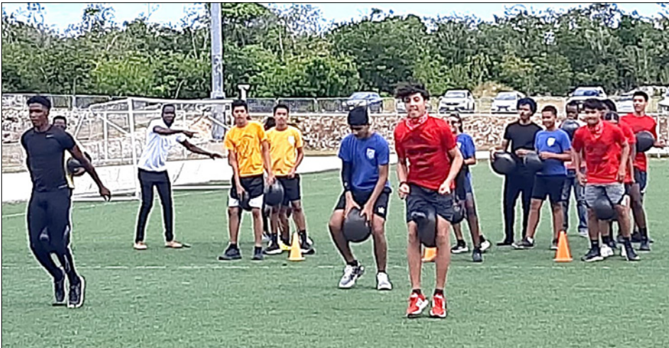
► Balloon Pop