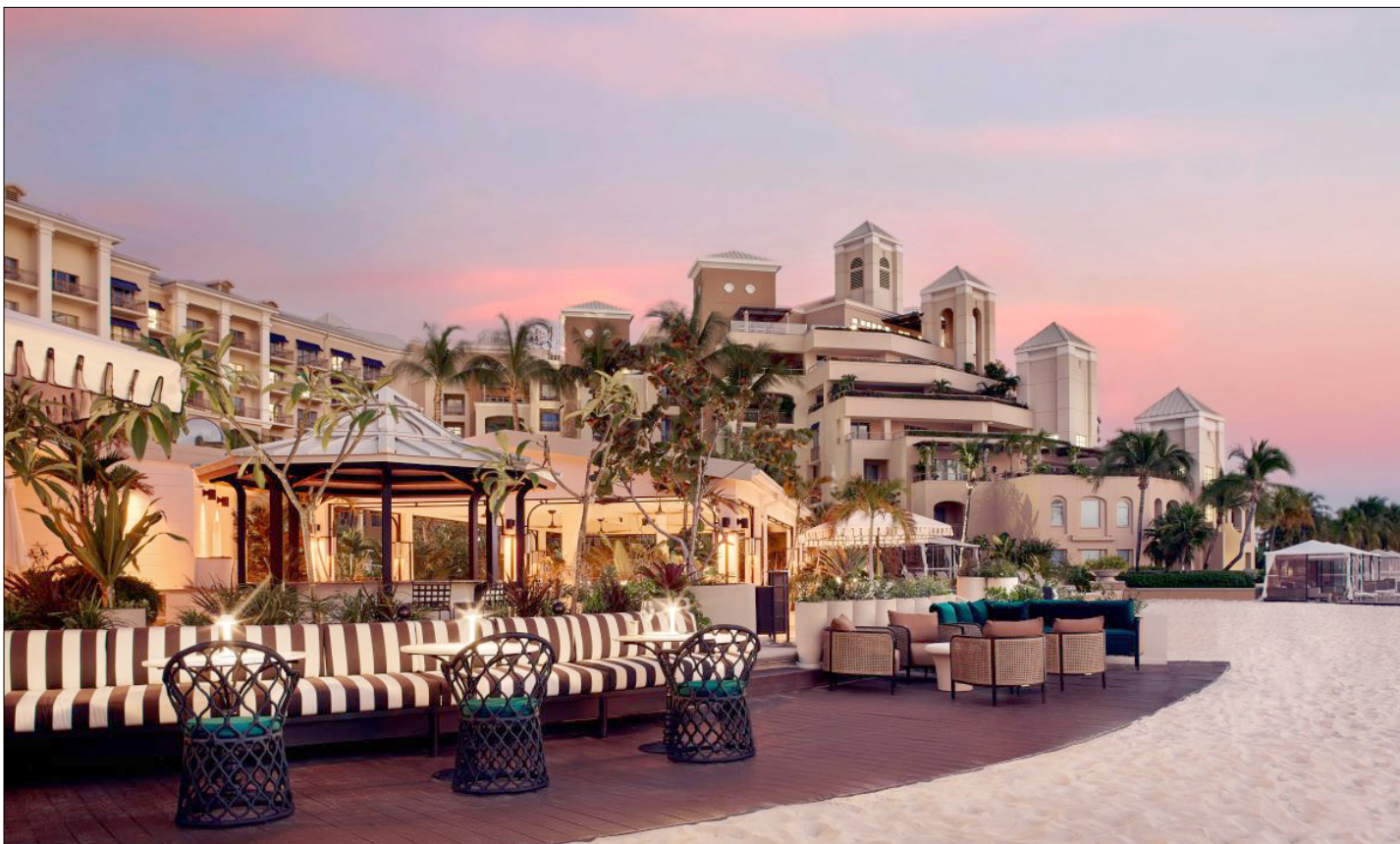
► The Ritz-Carlton, Grand Cayman was one of three properties worldwide that earned their exclusive triple Five-Star status.

When booking their Caribbean getaways, travellers want certainty about the quality of the property where they will be staying and a guarantee of the highest level of guest service. Dart's portfolio of hospitality properties in Anguilla and the Cayman Islands have a track record of meeting and exceeding those standards, which have been affirmed in the latest Forbes Travel Guide ratings.