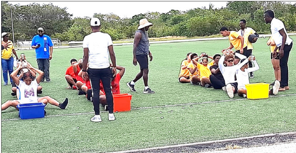
► Water Brigade