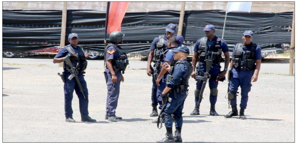
► Jamaican police are dealing with high crime rates