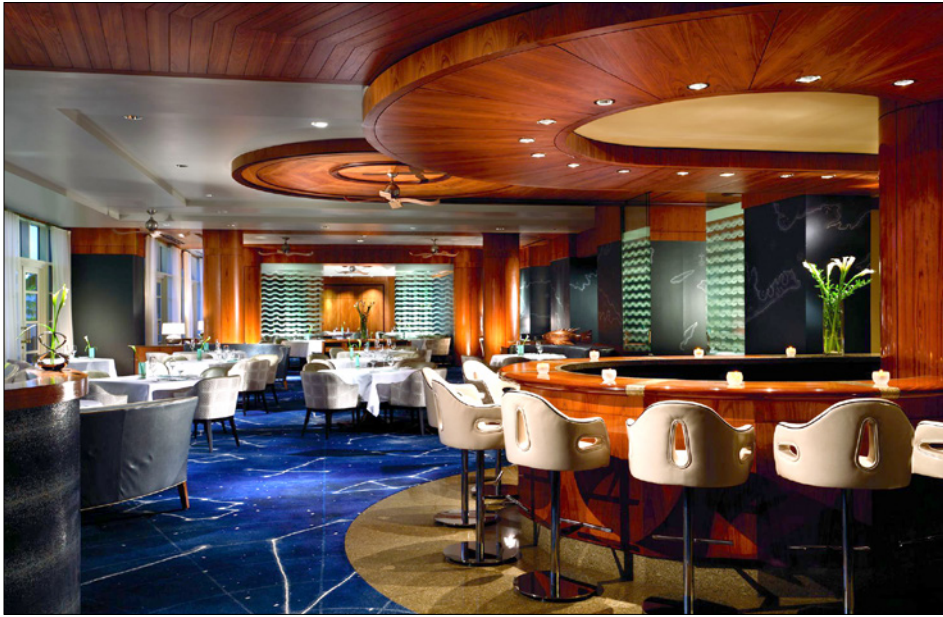
► Blue by Eric Ripert hits all the culinary high notes expected of a fine-dining establishment located in The Ritz-Carlton, Grand Cayman