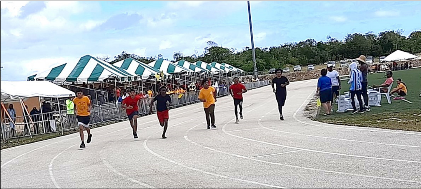
► Track & Field

Generating the greatest excitement were the 800m, 400m, the relays and