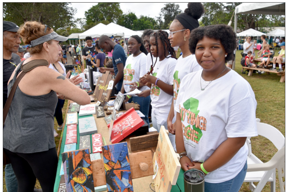
► Junior Achievement