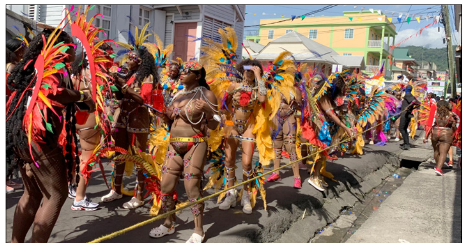
► Dominica's carnival was a huge success

Dominica held its annual carnival on February 12 and 13 and it was a huge success, filled with colour, music, and celebration that captivated locals and visitors alike.