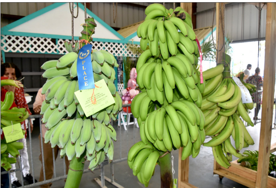
► First, second and third prizes