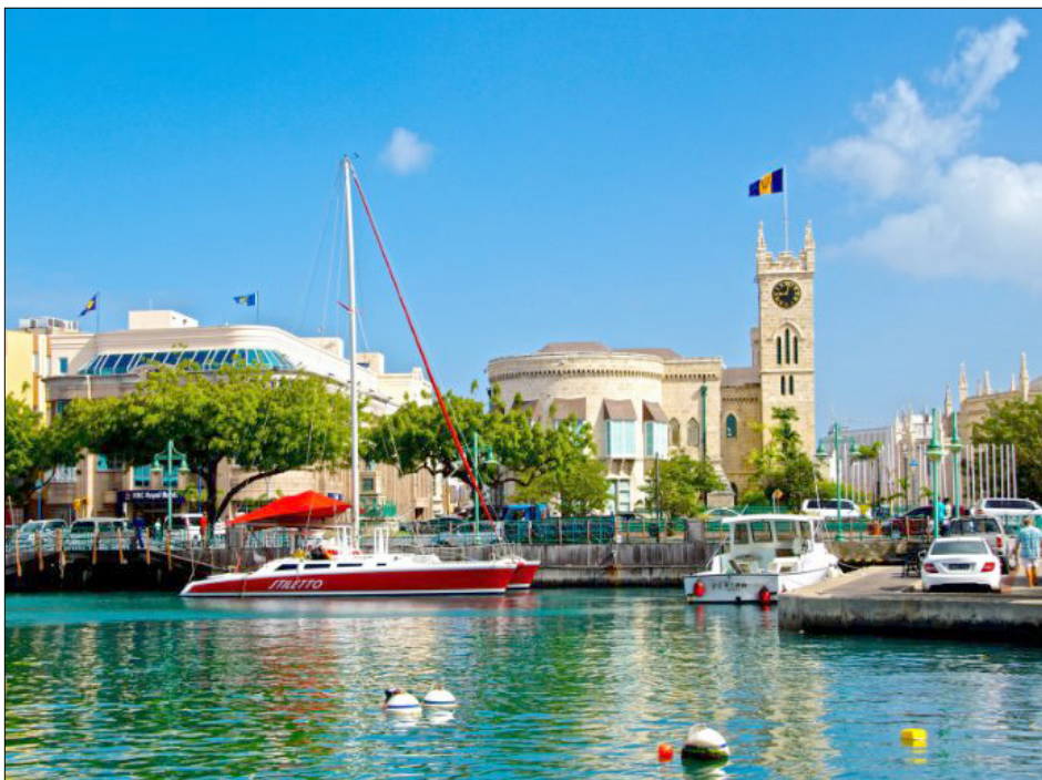
► Bridgetown is strengthening ties with Latin America

The Barbados cabinet has approved the request for both Panama and Mexico to establish diplomatic missions in Barbados, which will help trade relations with those nations. Panama is a key regional hub for shipping and air freight.