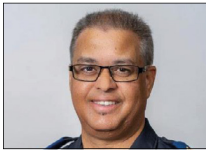
CBC Intercepts Illegal Drugs