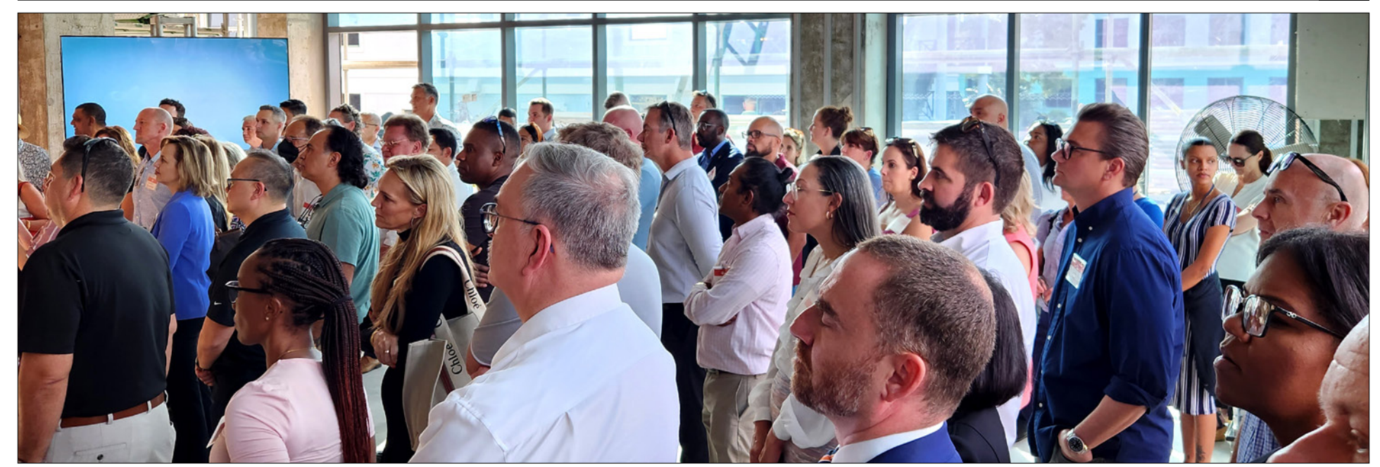
A crowd gathered for the 'topping out' ceremony of Phase 7 of Pavilion East on Thursday, 14th March.