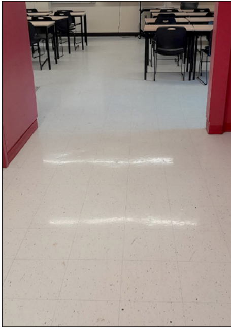
► A newly tiled section of the Clifton Hunter High School.