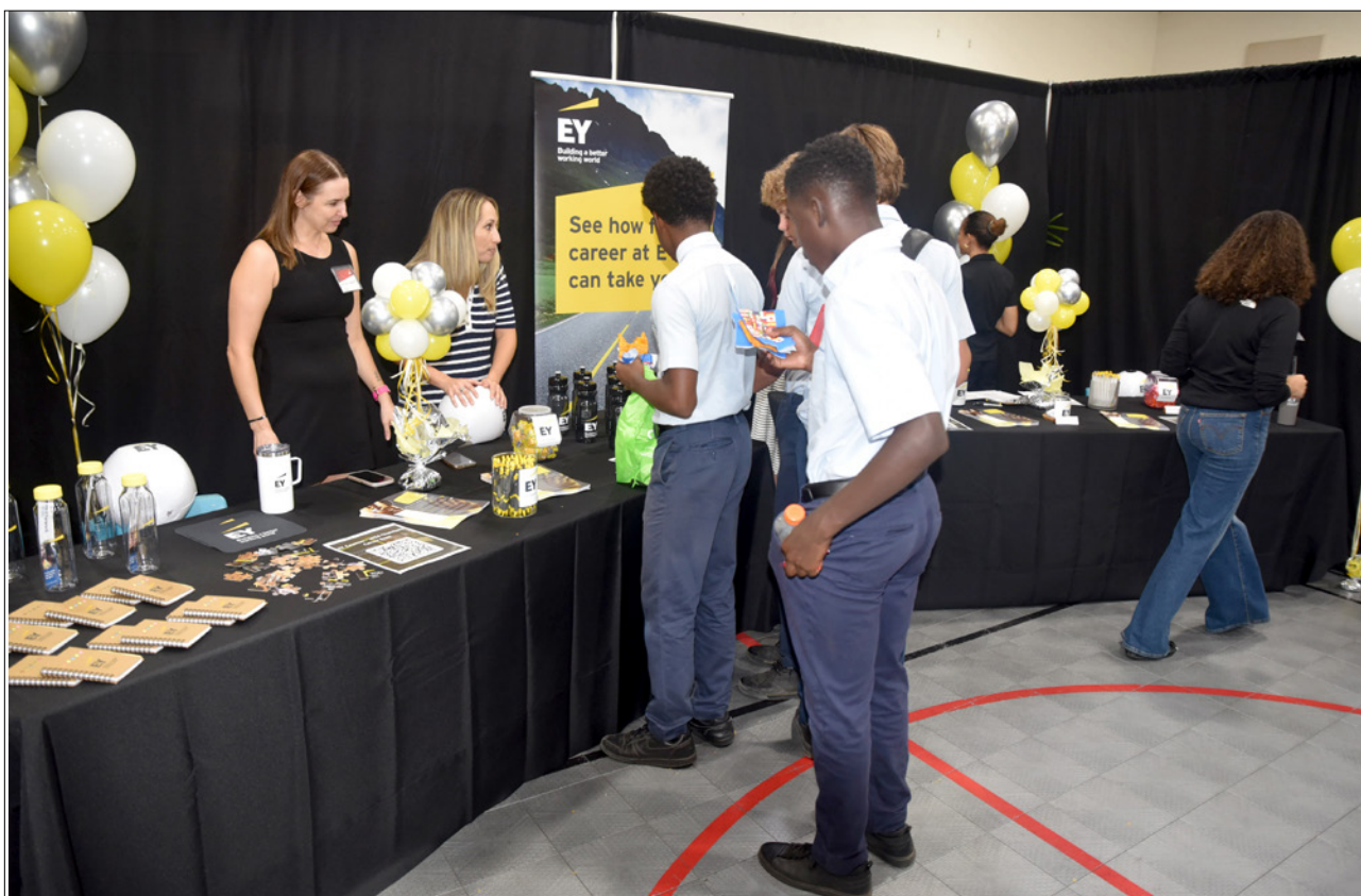
► EY spoke to many young people about careers that were available in their sector