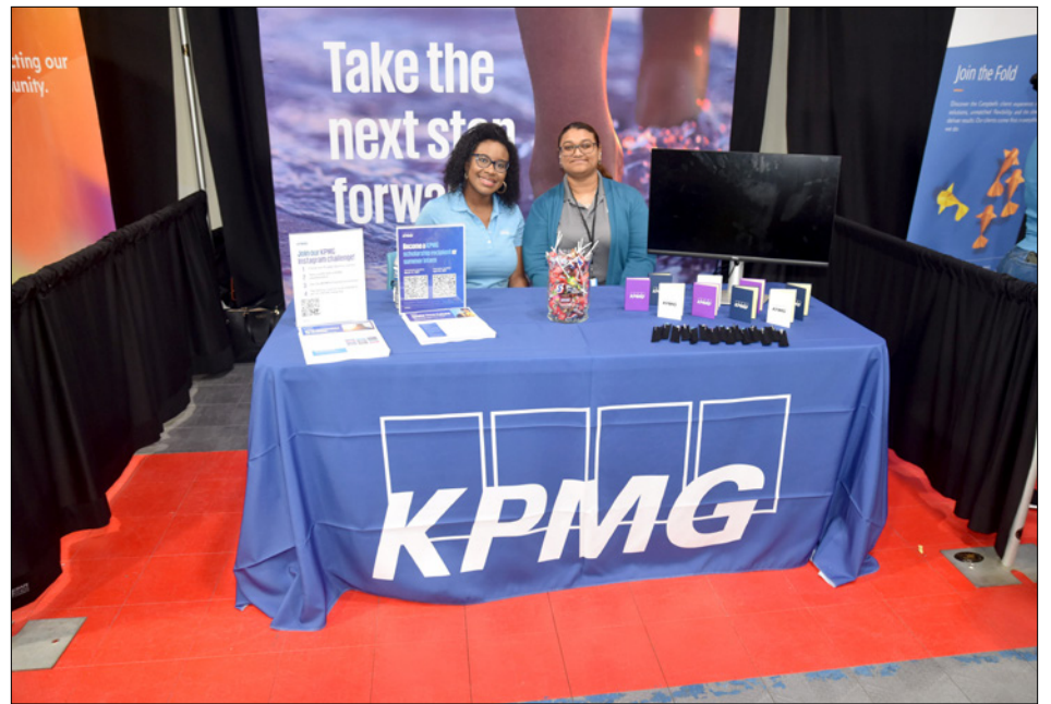
► KPMG representatives offered advice on careers to everyone who visited their booth