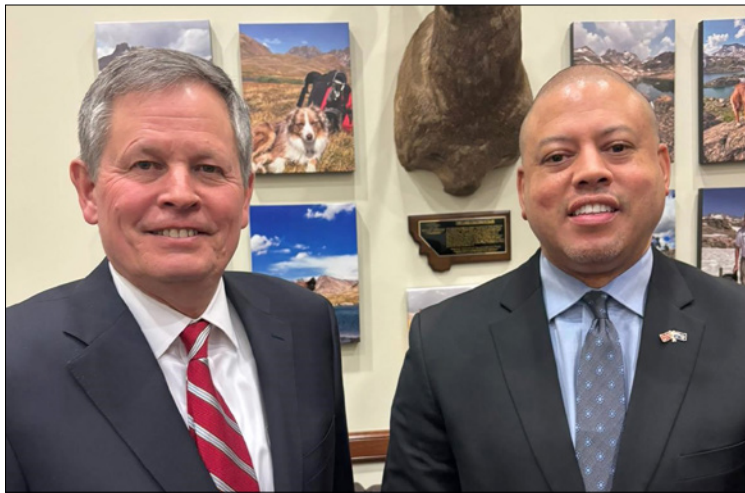
► Deputy Premier and Minister for Financial Services and Commerce, the Hon. Andre Ebanks MP (right) spoke with US Senator Steve Daines, a member of the Senate Banking and Senate Finance committees, during a visit to Washington DC and New York City from 13-21 March.

"The journalists were genuinely interested in the Cayman Islands and open to understanding our financial services framework in its modern light. These forthright conversations laid the foundation for building more trusted relationships with international media," the