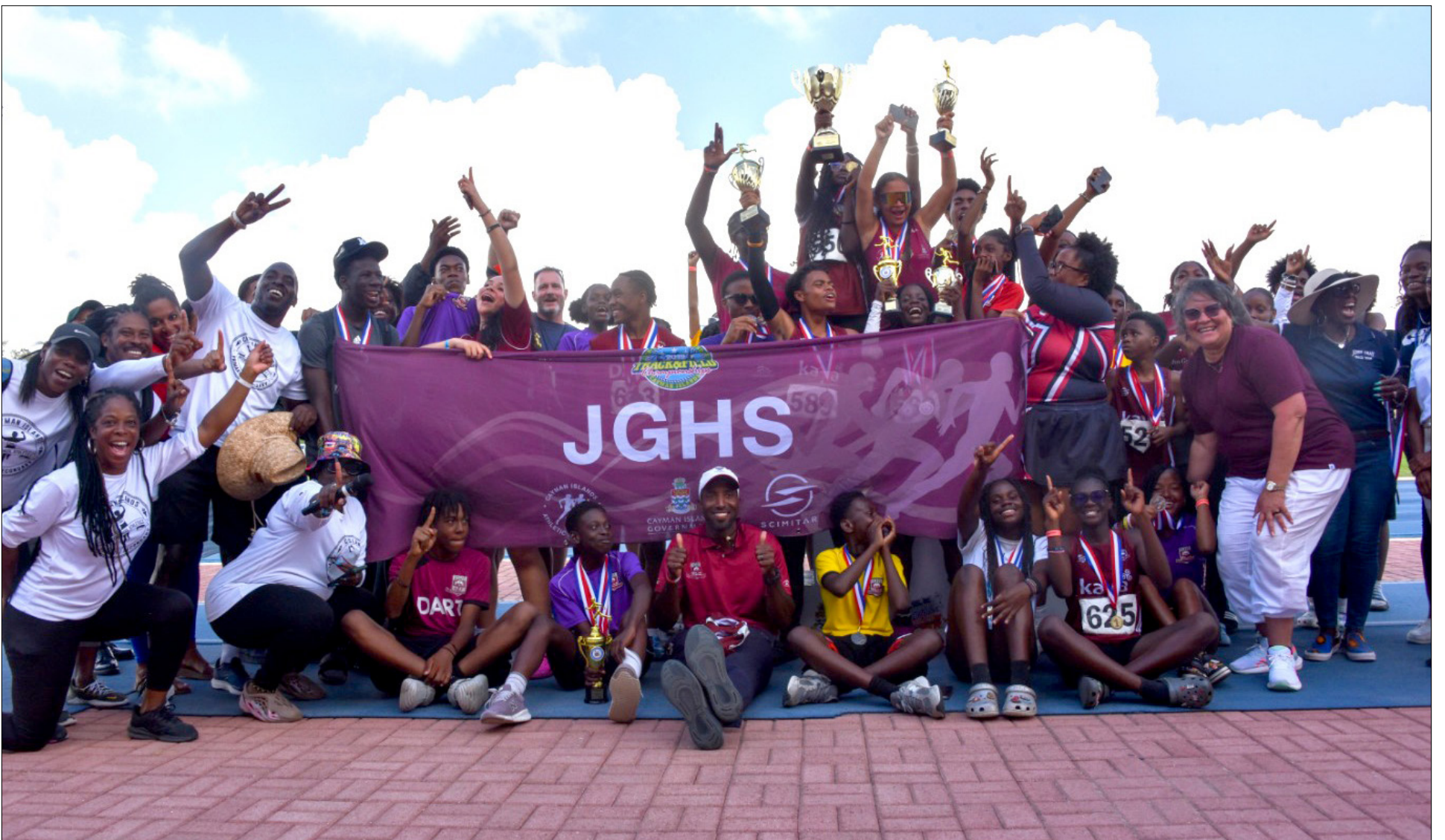
► Members of John Gray High School family are jubilant after collecting the winning trophy.