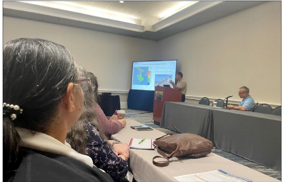
► Premier O'Connor-Connolly listens attentively to a conference presentation that highlights Cayman and similar territories.