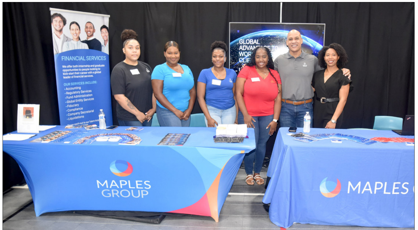
► Maples Group at the Chamber Careers Expo engaged with many young people who came to their booth.

Many students from Cayman’s high schools visited the event with their teachers. They were taking the opportunity to find out as much as they could.