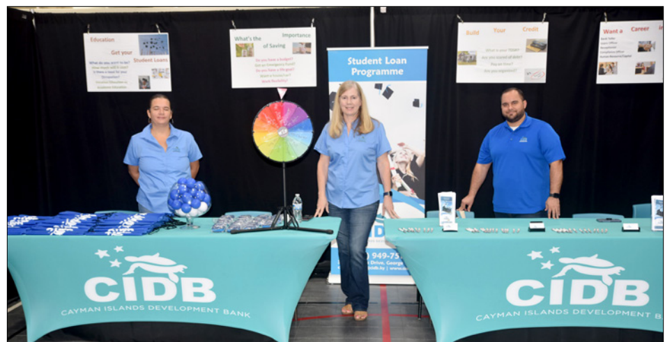
► Cayman Islands Development Bank met with many students and school leavers, providing advice and information on careers in the banking sector