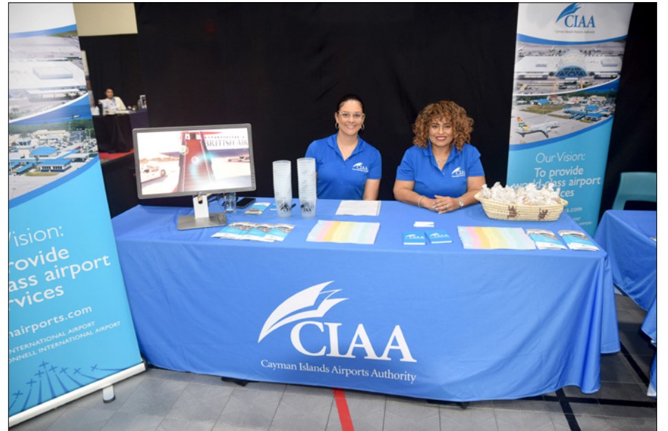
► The Cayman Islands Airports Authority were telling young people about all the different careers and training opportunities that were available