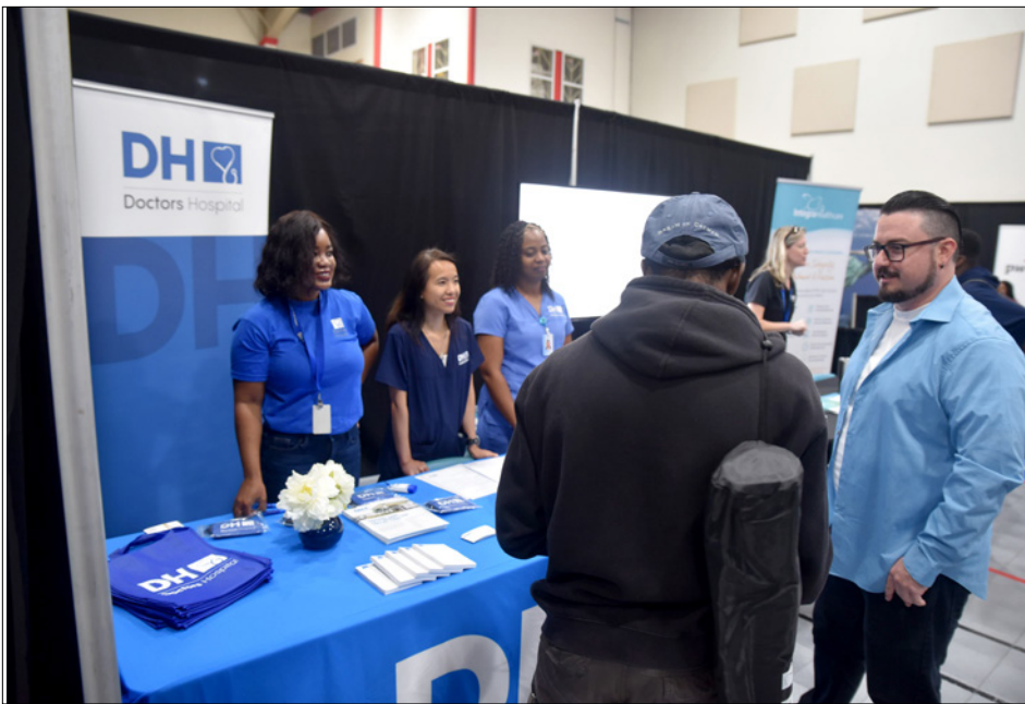
► Doctors Hospital offered many opportunities to young people who came to their booth.