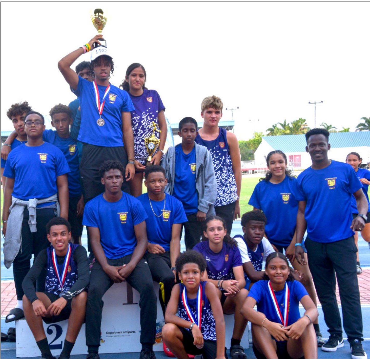
► Small Schools champion, Layman E Scott High School.

For a complete list of scores, please visit the Cayman Athletics website at https://athletics.org.ky/ .