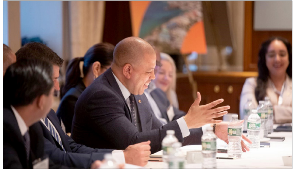
► Deputy Premier and Minister for Financial Services and Commerce, the Hon. Andre Ebanks MP, speaks at Cayman Finance's industry roundtables in New York City, during a visit from 13-21 March that also took him to Washington DC.

Reinforcing and reaffirming the Cayman Islands' relationships with US policymakers, regulators and industry, the Deputy Premier and Minister for Financial Services and Commerce, the Hon. André Ebanks MP, visited Washington DC and New York City from 13-21 March to listen to their current views on global industry matters, and to update them on our Islands' soundness and business viability.