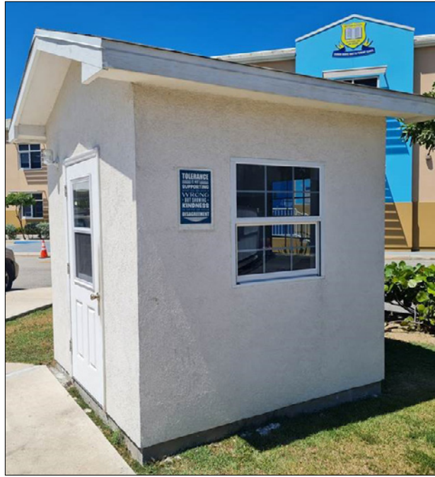
► The new security booth at Marie Martin Primary School.