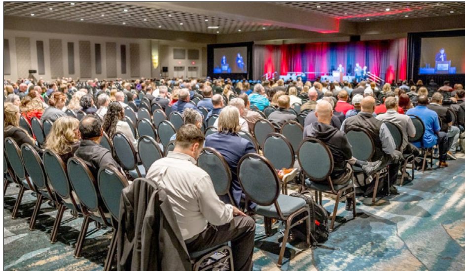
► Attendees at the 2024 National Hurricane Conference in Orlando, Florida, 25-28 March.

Premier O'Connor-Connolly who has prioritised the Islands' emergency readiness, increasing hurricane shelter space, improving support to vulnerable communities during disasters and repairing of the weather radar prior to the start