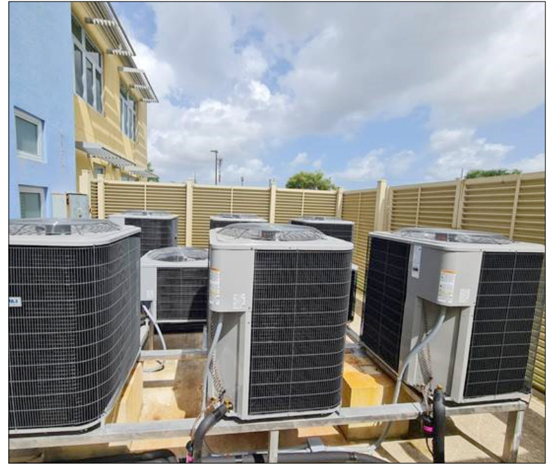
► New AC Unit at Theoline L McCoy Primary School.

The Ministry of Education (MoE) and Department of Education Services (DES) are proud to announce the completion of several major improvement projects across all government schools since the start of the 2023/24 academic year.