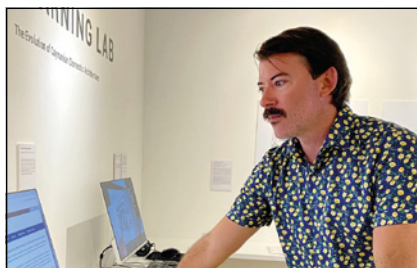
Caymanian architecture, past, present and future