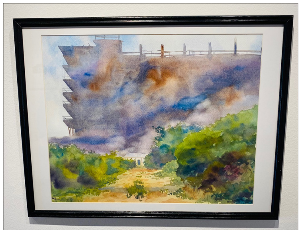
► Raphael Powery's powerful Mausoleum Burned in the Memory artwork