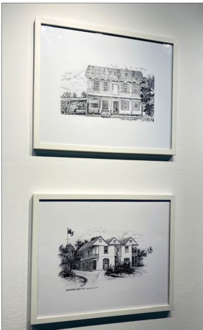
► Intricate drawings by Ed Oliver