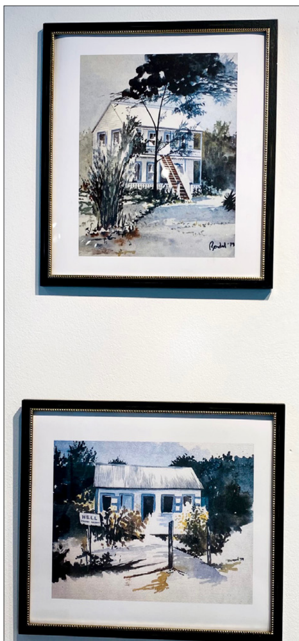
► Rare early work by Bendel Hydes