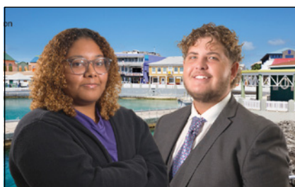
Grant Thornton Celebrates Success of Young Caymanian Interns