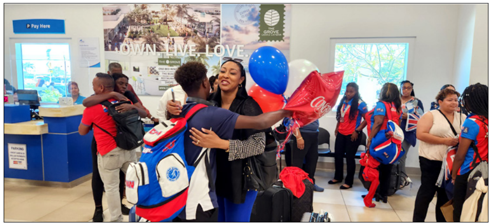
► Cayman's CARIFTA Team returns to Grand Cayman after a triumphant performance at this year's Games in Grenada, winning 1st and 2nd in the Men's 100 Meters, as well as Bronze in the 200 and Bronze in the Shot Put.