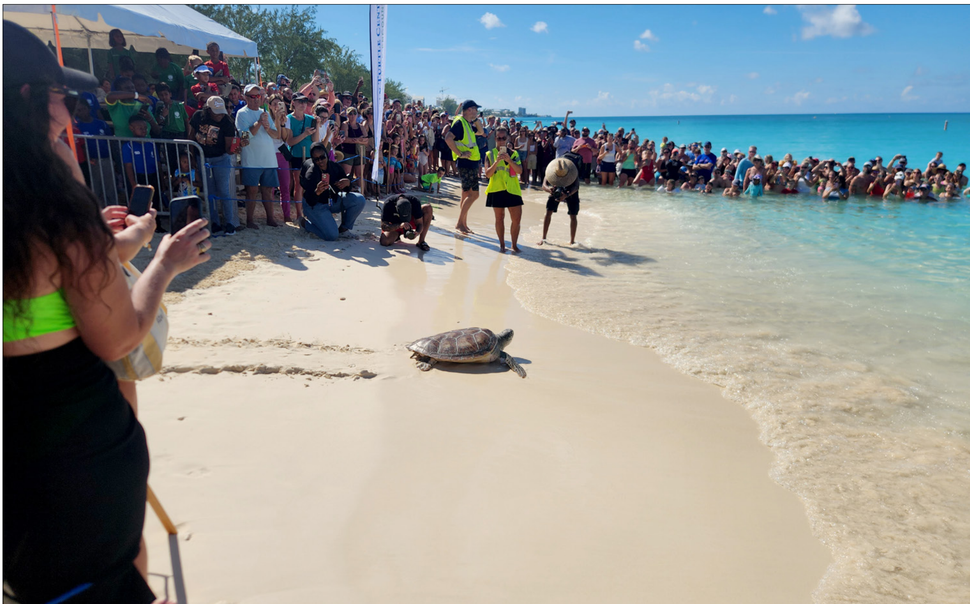
► The tracks made in the sand behind the turtles as they make their way into the water are referred to as 'batabano'.