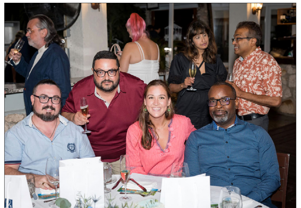
► DH Sponsored Dinner - CI Healthcare Conference 2025

“These are not separate issues,” he explained. “The way we produce, consume,