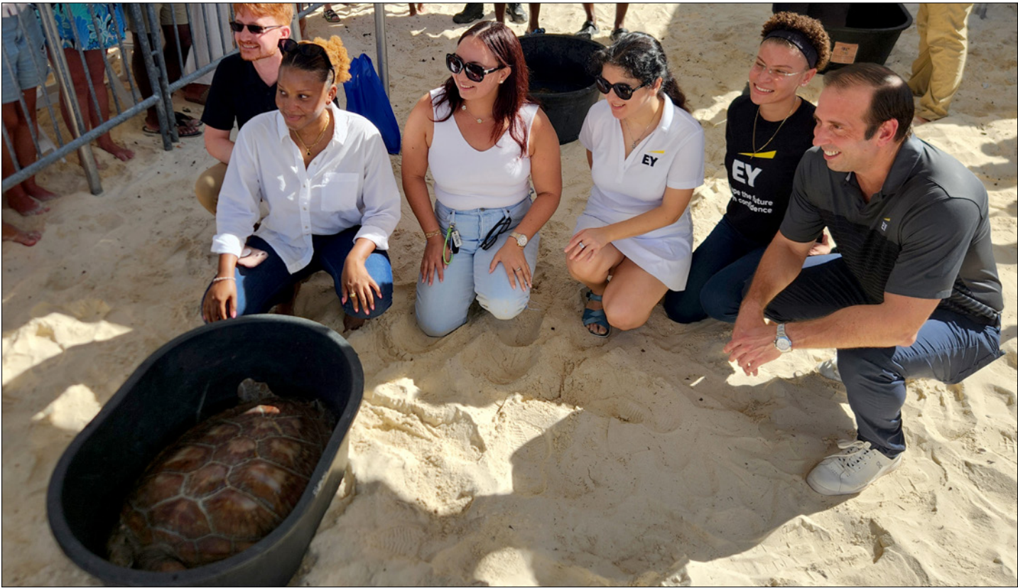
► The team from Ernst and Young sit with the green sea turtle sponsored by the accounting firm to be released during the turtle release event held at Governor’s Beach in Grand Cayman on 7th November, 2025.

bus’ memoirs even noted that there were so many of them it was thought they could walk to the shore on their backs.