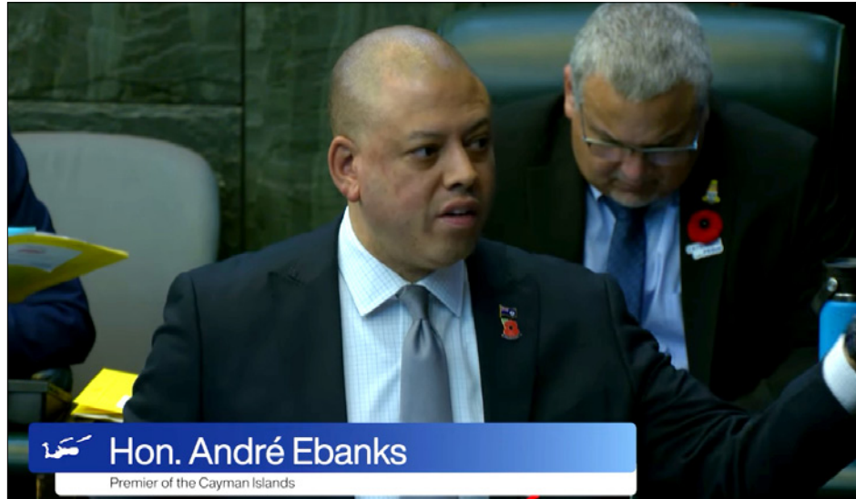
► Hon Premier Andre Ebanks

According to the Premier, the challenges