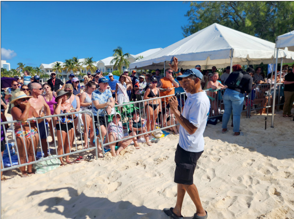
► A Turtle Centre representative addresses the audience at this year’s turtle release event in Grand Cayman.