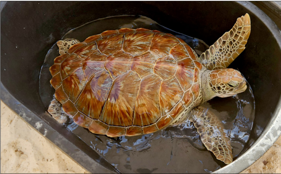
► One of the green sea turtles to be released at the annual sea turtle release event held in Grand Cayman.

However scientists cautioned that 600 nests does not mean that number of turtles.