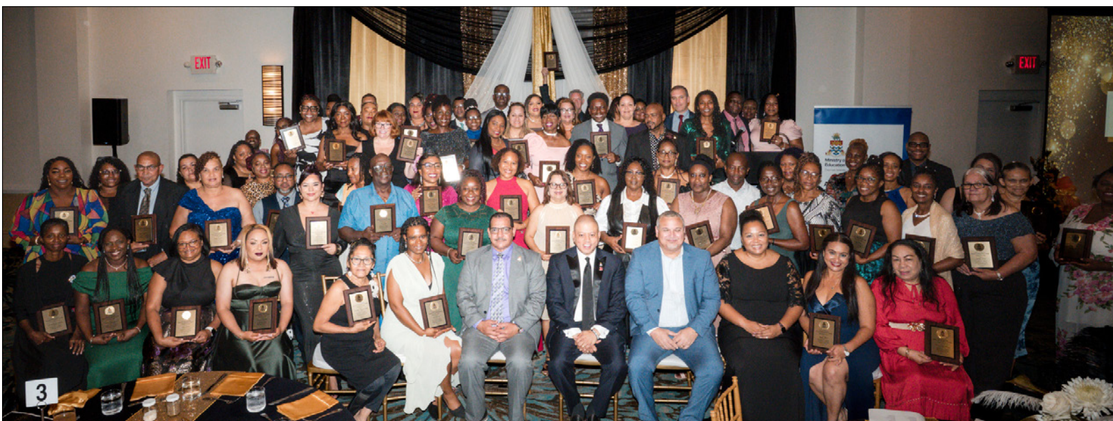
► Recipients of The Catalysts category awards, recognising 15–19 years of service.

The Ministry of Education & Training reaffirmed its commitment to building on that legacy and encourages others who wish to make a difference in the lives of others to explore current opportunities at careers.gov.ky .