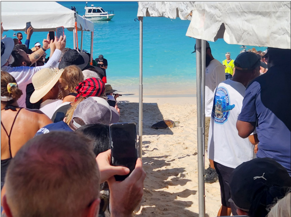
► A green sea turtle makes its way down to the water at the annual turtle release held at Governor’s Beach in Grand Cayman on 7th November, 2025.