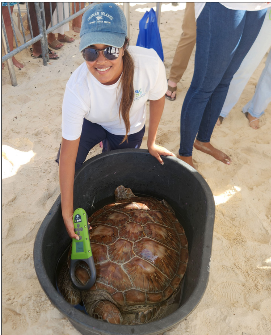
► A scientist from the Turtle Centre prepares a green sea turtle for release.