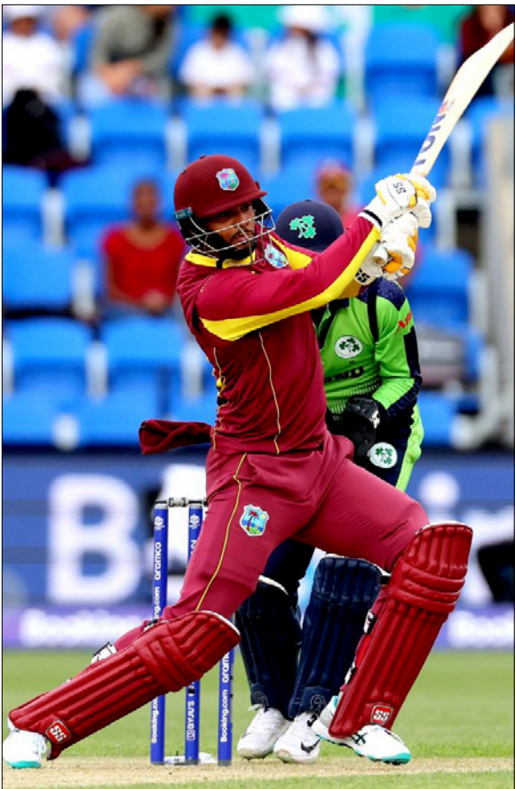
► Brandon King leads the West Indies in Afghanistan

King (capt), Alick Athanaze, Keacy Carty, Johnson Charles, Matthew Forde, Justin Greaves, Shimron Hetmyer, Amir Jangoo, Shamar Joseph, Evin Lewis, Gudakesh Motie, Khary Pierre, Quentin Sampson, Jayden Seales, Ramon Simmonds, Shamar Springer.