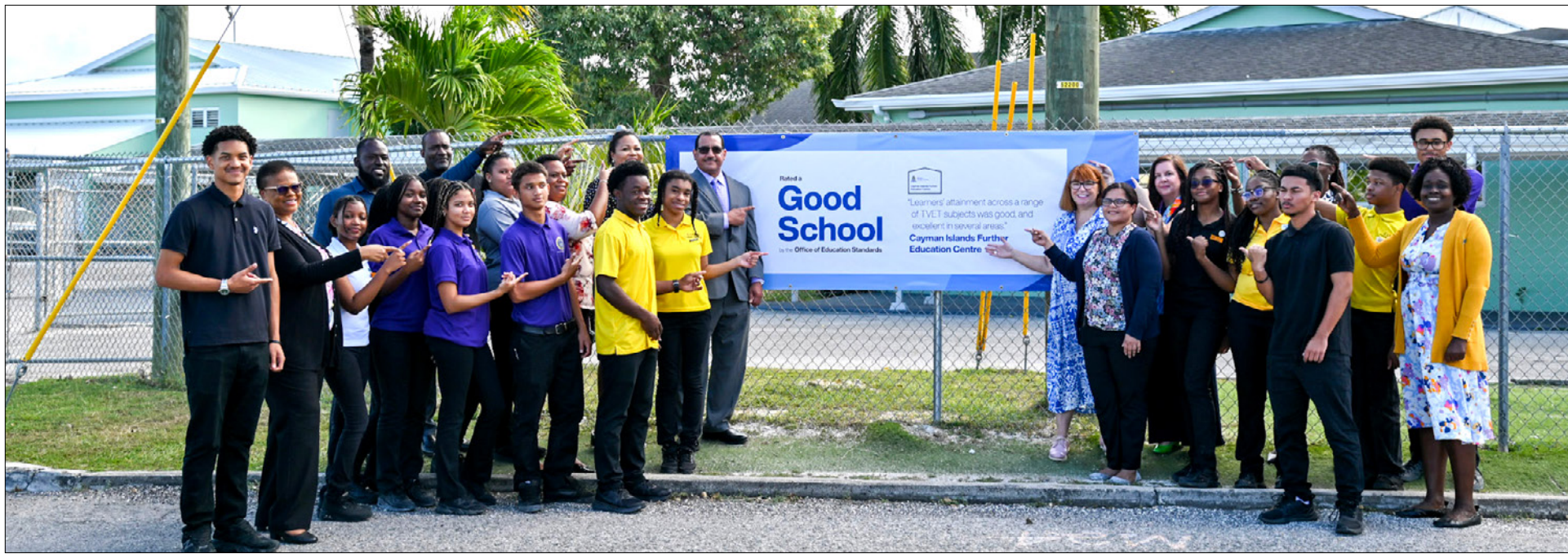
► Students and members of the CIFEC school community come together in celebration, reflecting the pride and shared achievement behind the institution’s Good School standing.