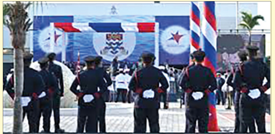
► National Heroes Award Ceremony is on Monday 26 January.

25 January - The event starts and finishes at Public Beach on West Bay Road, where the whole family can run or walk 10km to the Wharf and back or the 5K with the turnaround point at the roundabout at the Fidelity Centre. For the running enthusiasts, there is a Half-Marathon distance to South Church Street with the turn around by Caribbean Paradise, and back to public beach. To register and for further information, go to www.cics.ky