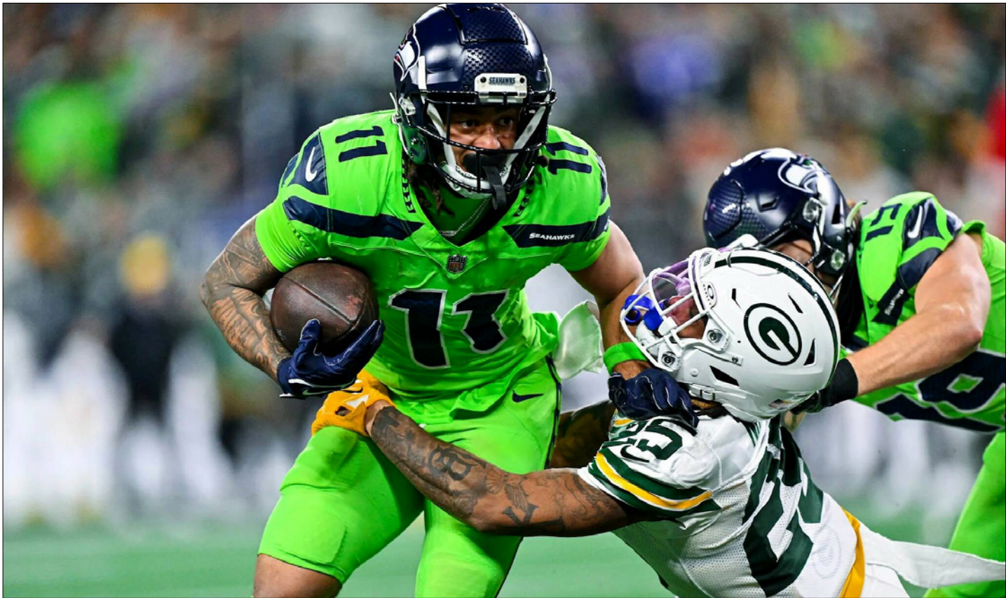
► Jaxon Smith-Njigba is a brilliant wide receiver

The wild-card round of the 2025 NFL playoffs is completed, and the divisional round matchups are set. In the NFC, the San Francisco 49ers will play at the Seattle Seahawks on Saturday, and the Los