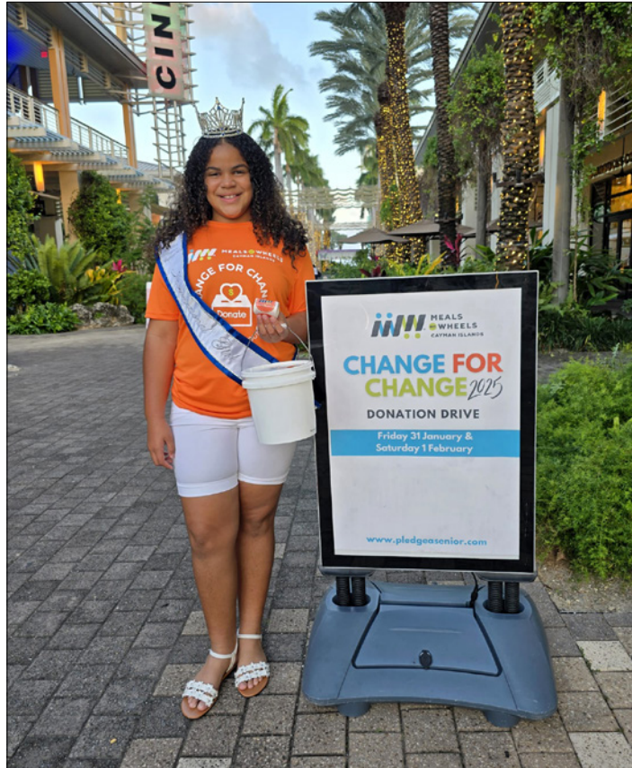
► Our Little Miss Queen at Camana Bay during Change for Change 2025

Meals on Wheels Cayman Islands is preparing to launch its annual Change for Change Donation Drive, taking place over two days on Friday, 30th and Saturday, 31st January 2026, and is calling on volunteers of all ages to unite in support of seniors in need across Grand Cayman.