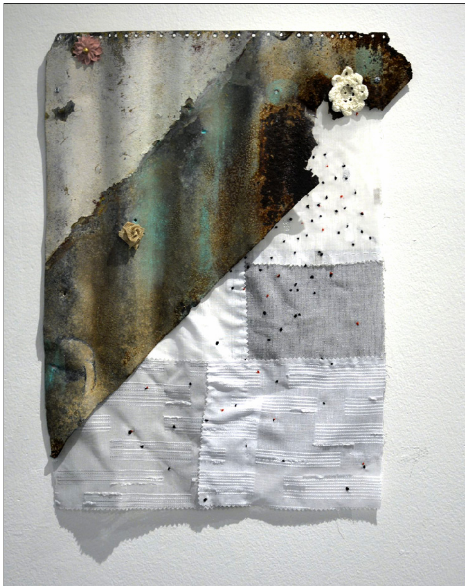
► Alchemy VI is another beautifully created piece of quilting