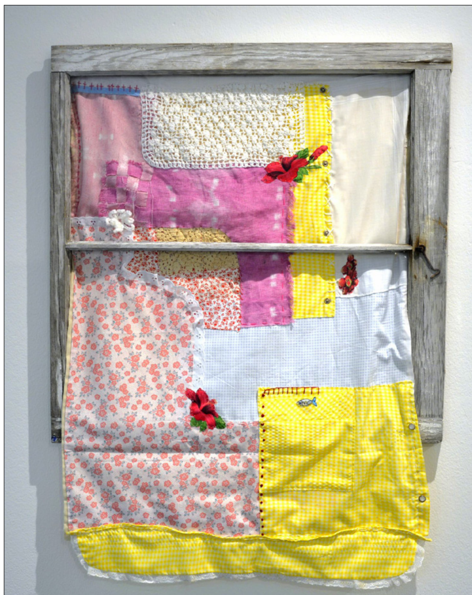
► An example of Nasaria's quilting entitled Alchemy IV