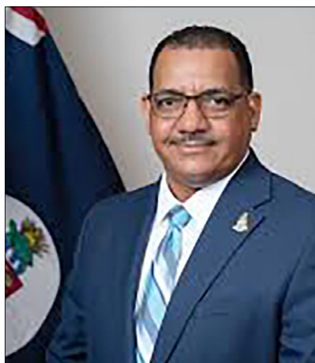
► Hon. Minister of Finance Rolston Anglin

The concessions granted to Cayman Brac include a 100% stamp duty waiver on undeveloped land purchases under the value of $2 million; a reduced rate of 3% stamp duty on developed properties under the value of $2 million; and a 100% import duty waiver on household appliances imported to Cayman Brac. The household appliances are listed to include refrigerators, dishwashers, water heaters, pumps, washers, dryers, ranges, cook