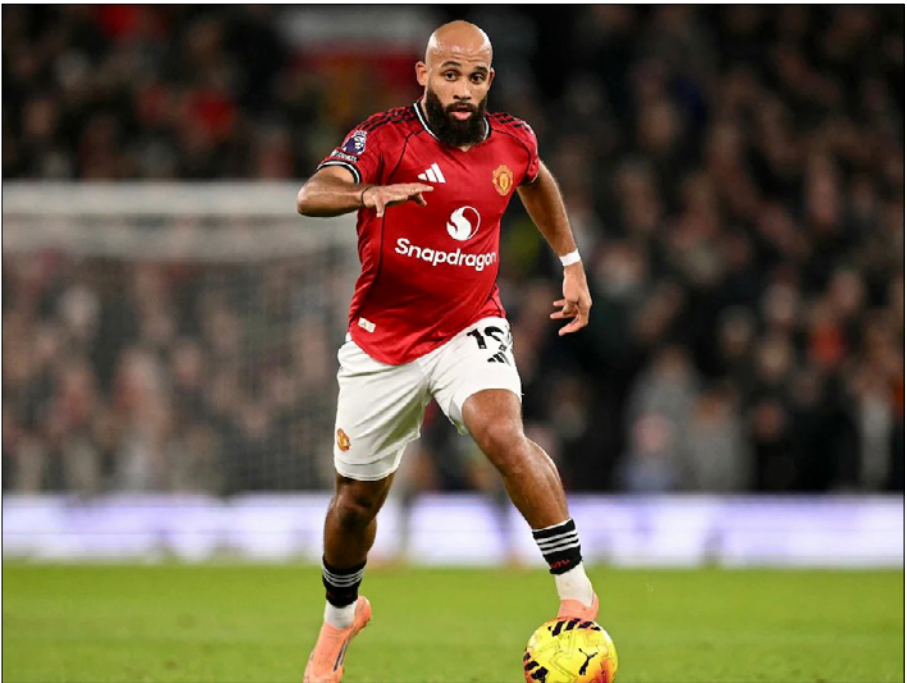
► Manchester United are having another turbulent season

Manchester United's latest managerial change sees Michael Carrick begin his reign with the toughest possible debut, a local derby with the mighty Manchester City.