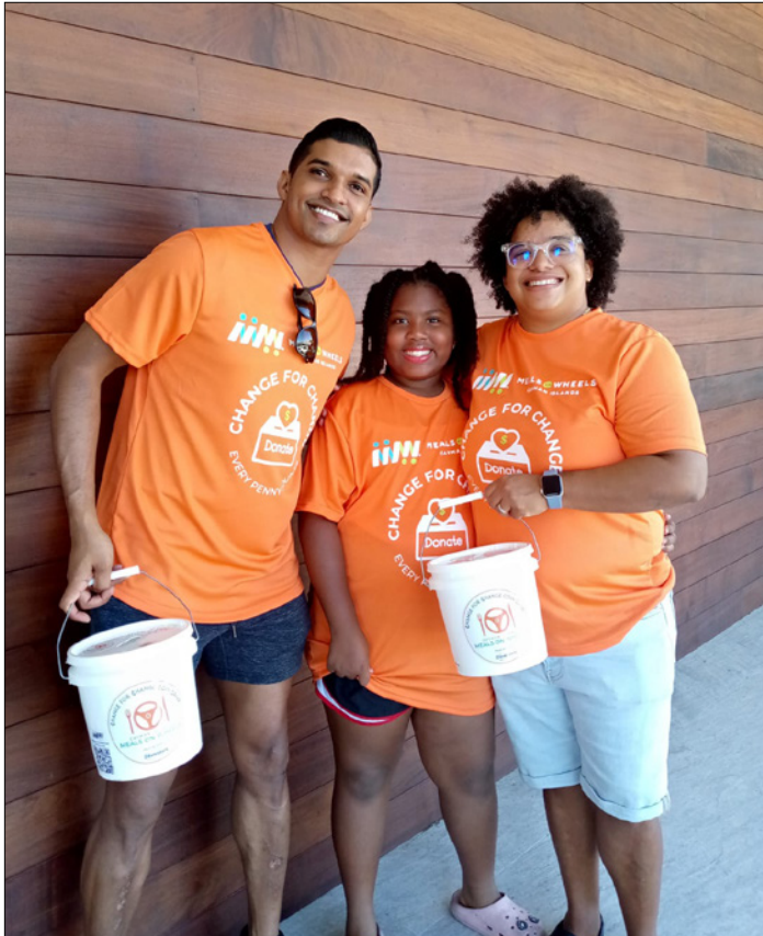
► Volunteers out at collection locations during 2025 Change for Change donation drive