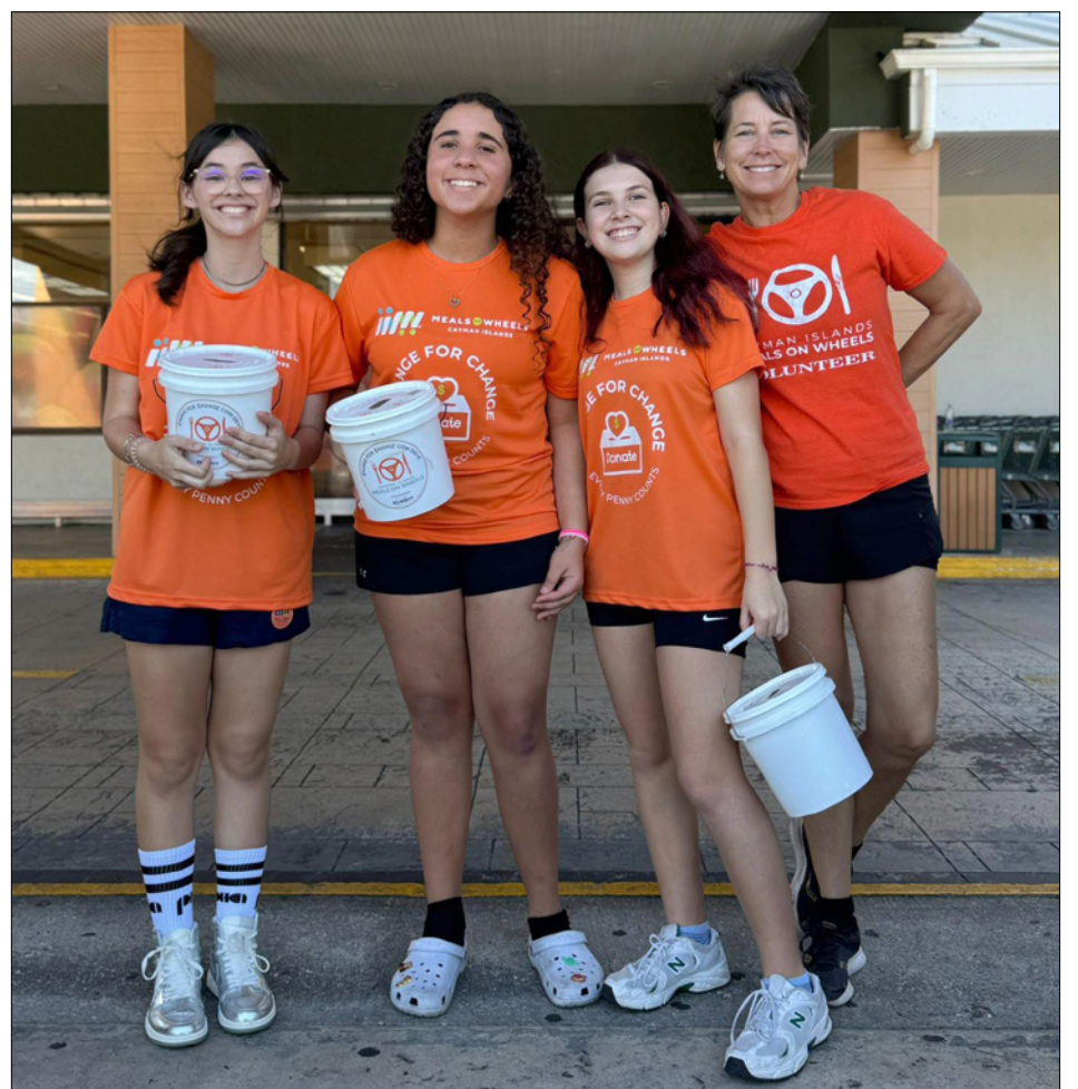
► CIS Students at Kirk Market for Change for Change 2025