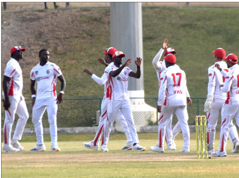
► Trinidad and Tobago Red Force stormed to victory

For Guyana, it ends a remarkable three-year dynasty. One of Caribbean cricket's fiercest rivalries may have a new victor, but the Harpy Eagles will have plenty to say about it next year.