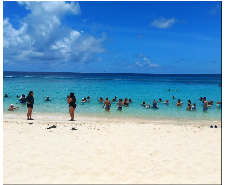
► Governor's Beach will host the event