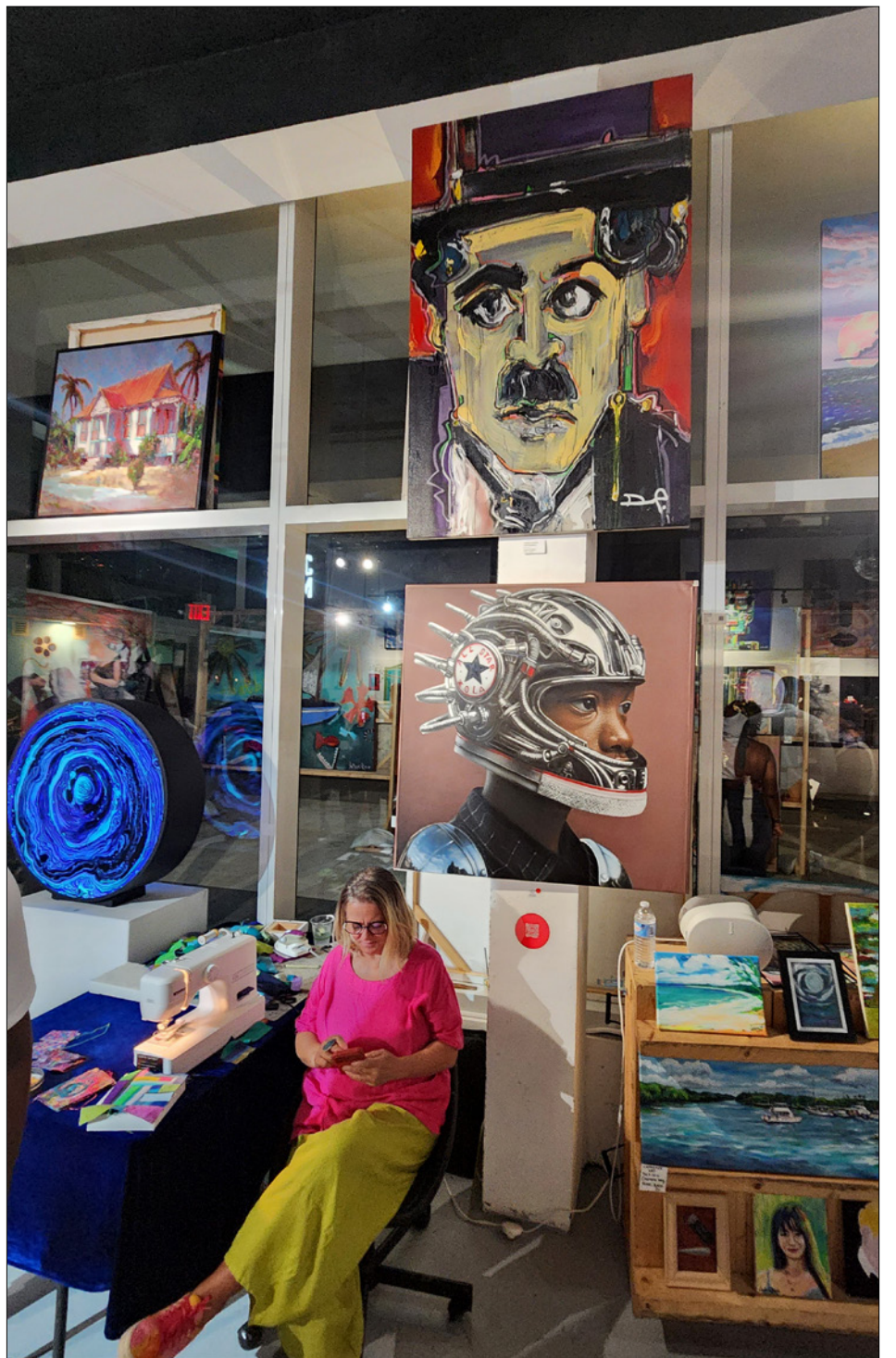
► More of the art on display at the Carlos V. Garcia Fine Art Gallery during Art Week 2026 in the Cayman Islands.

Other sites to feature art during the course of Art Week include the Carlos V Garcia Fine Art Gallery, where a series of works are being showcased by sev-