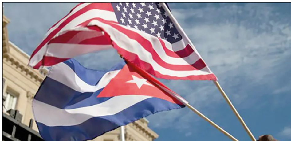
SEE CUBA, PAGE 3