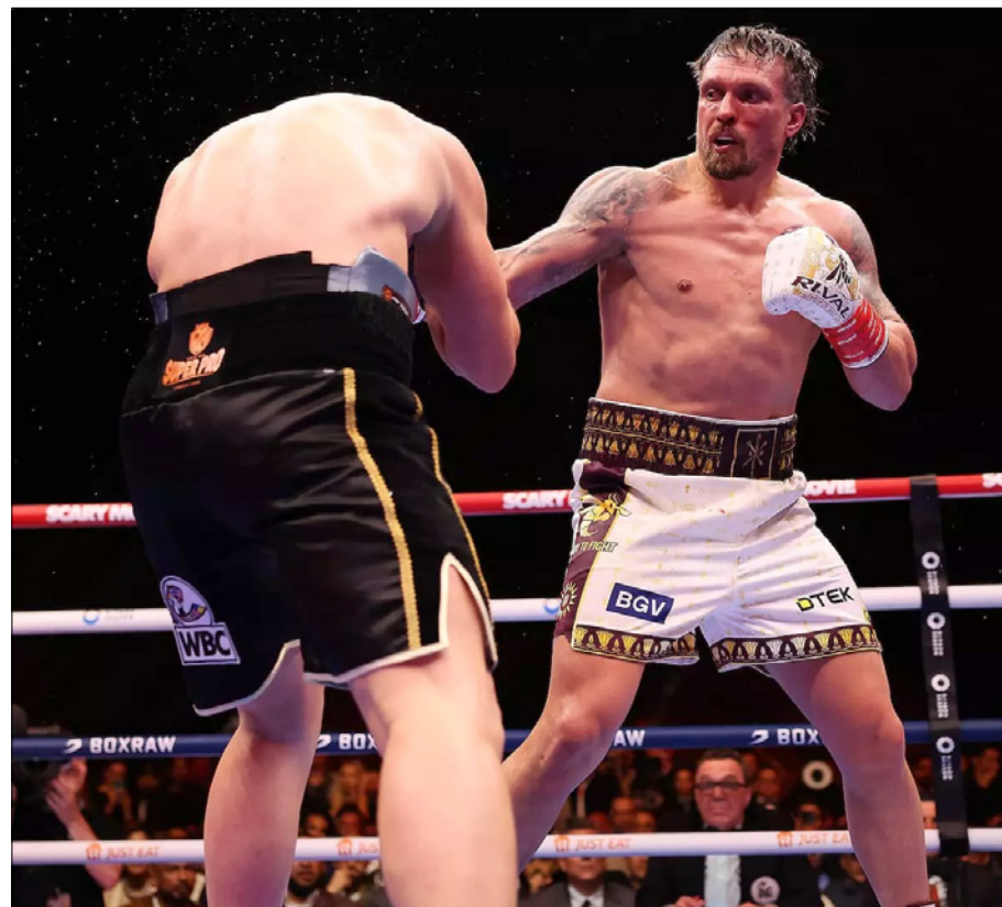
► Usyk laboured against an inexperienced opponent

With no shortage of challengers queuing up for a shot at one of Usyk's three belts - the WBA 'super', WBC and IBF - there is a raft of potential contenders, including the Brits Daniel Dubois, Tyson Fury, Anthony Joshua and Fabian Wardley.