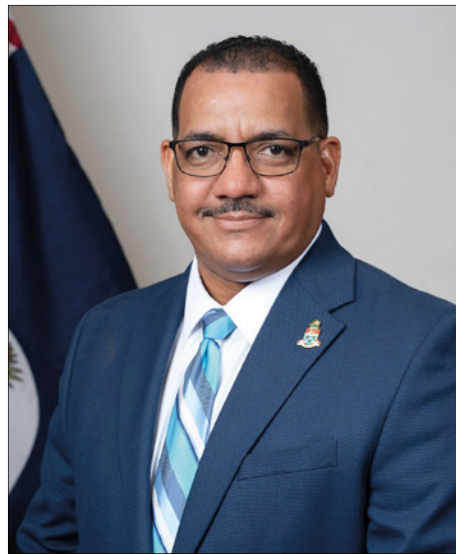
► Hon Rolston Anglin

Minister for Finance and Economic Development Hon. Rolston Anglin noted that while the Cayman Islands Government does not control the international price that fuel importers pay their suppliers, all available measures have been taken to reduce costs at the fuel pump for local consumers.