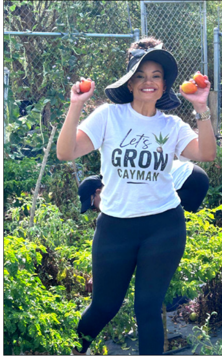
► A Leadership Cayman student helps

Collaboration was central to the project's impact. Partnerships with organisations including Literacy Is For Everyone (LIFE) Cayman and the National Children's Voluntary Organisation (NCVO) reinforced the connection between food accessibility, education and community support. The project also incorporated a wider outreach element, encouraging public participation through an island-wide harvest and donation effort.