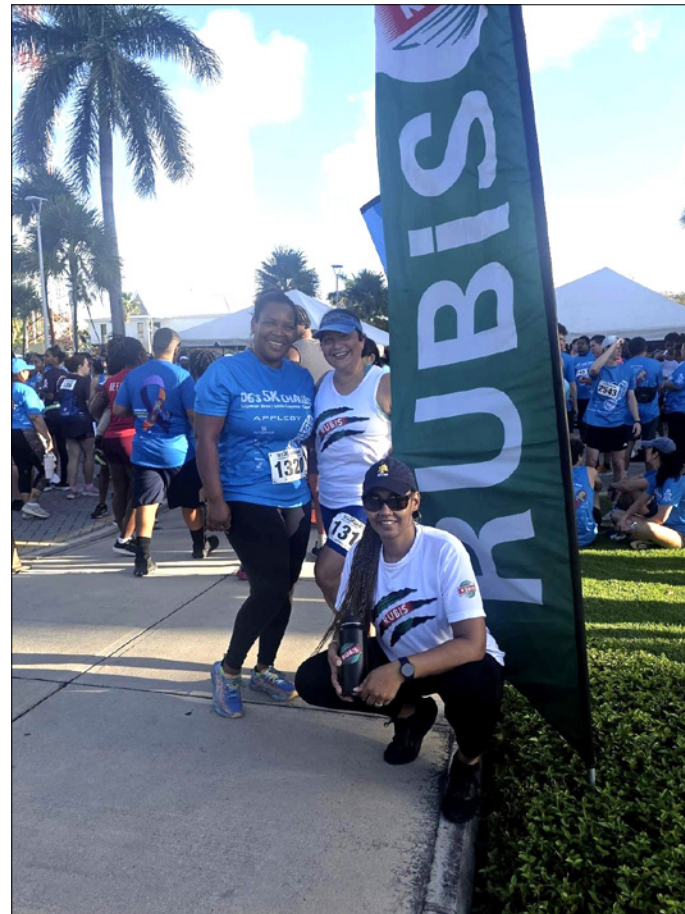
► This event is always well supported

all fitness levels to get active while supporting a meaningful cause.