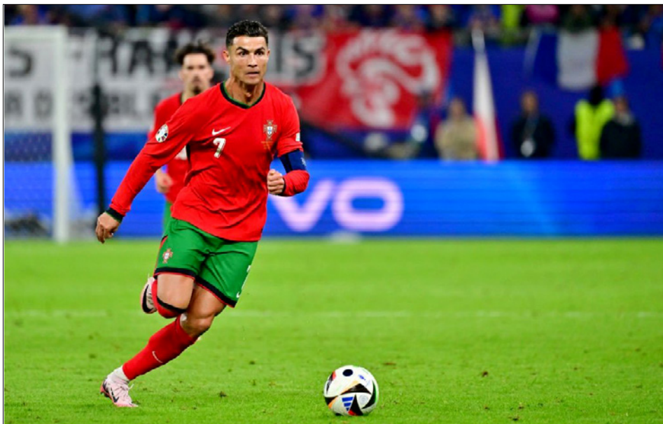
► Cristiano Ronaldo earned $300m last year

This will be the last dance for the aging icons, who will become the first men to play in six different World Cups, 20 years on from their fresh-faced debuts at the finals. They have since become legends far beyond the football pitch, two of the most recognizable people on the planet as they contemplate retirement.