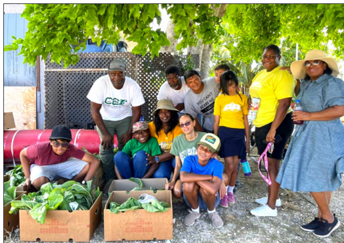
► Leadership Cayman students helped at the Cayman Community Farm in Newlands