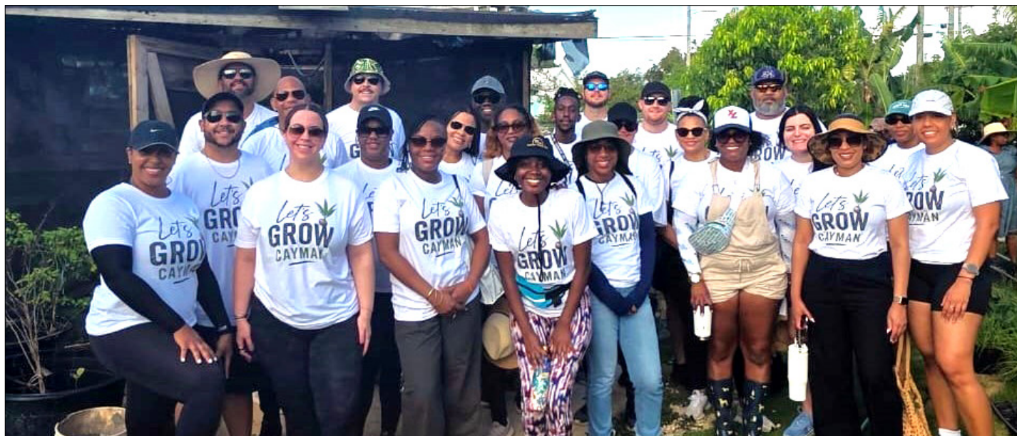
► Leadership Cayman's Class of 2026 at the Cayman Community Farm

You can also find out more, including how to register for the programme, by visiting leadershipcayman.ky