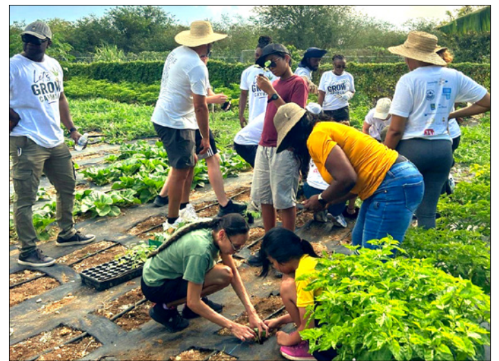
► Hard at work – at the Cayman Community Farm in Newlands.

For the LC 2026 cohort, the experience offered valuable insight into the broader implications of food security in the Cayman Islands. Participants gained a deeper understanding of the challenges facing local agriculture, from reliance on imports to rising global food costs and supply chain disruptions. At the same time, they saw firsthand the opportunities that community farming presents in building resilience, promoting healthier