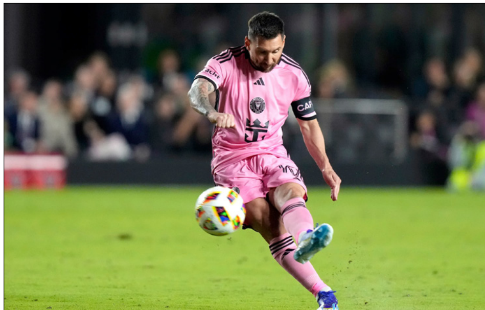
► Lionel Messi is a billionaire too