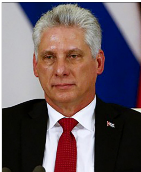
► Cuba’s President Miguel Díaz-Canel

What had recently appeared as overtures by the US to tone down the rhetoric while still demanding that the Cuban government make significant changes to its governance have since been