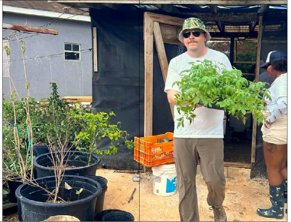
► Leadership Cayman Class Project at the Cayman Community Farm