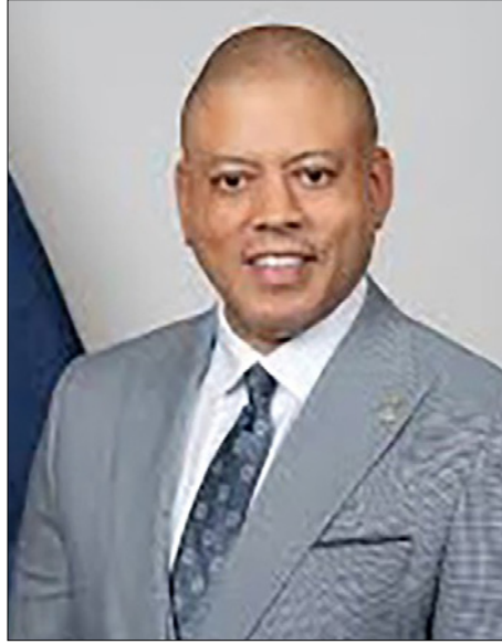
► Hon Premier Andre Ebanks

The Premier's itinerary begins in Washington where he is scheduled to meet with senior officials at the US Department of the Treasury, members of Congress, congressional staff, and representatives of key industry organisations.