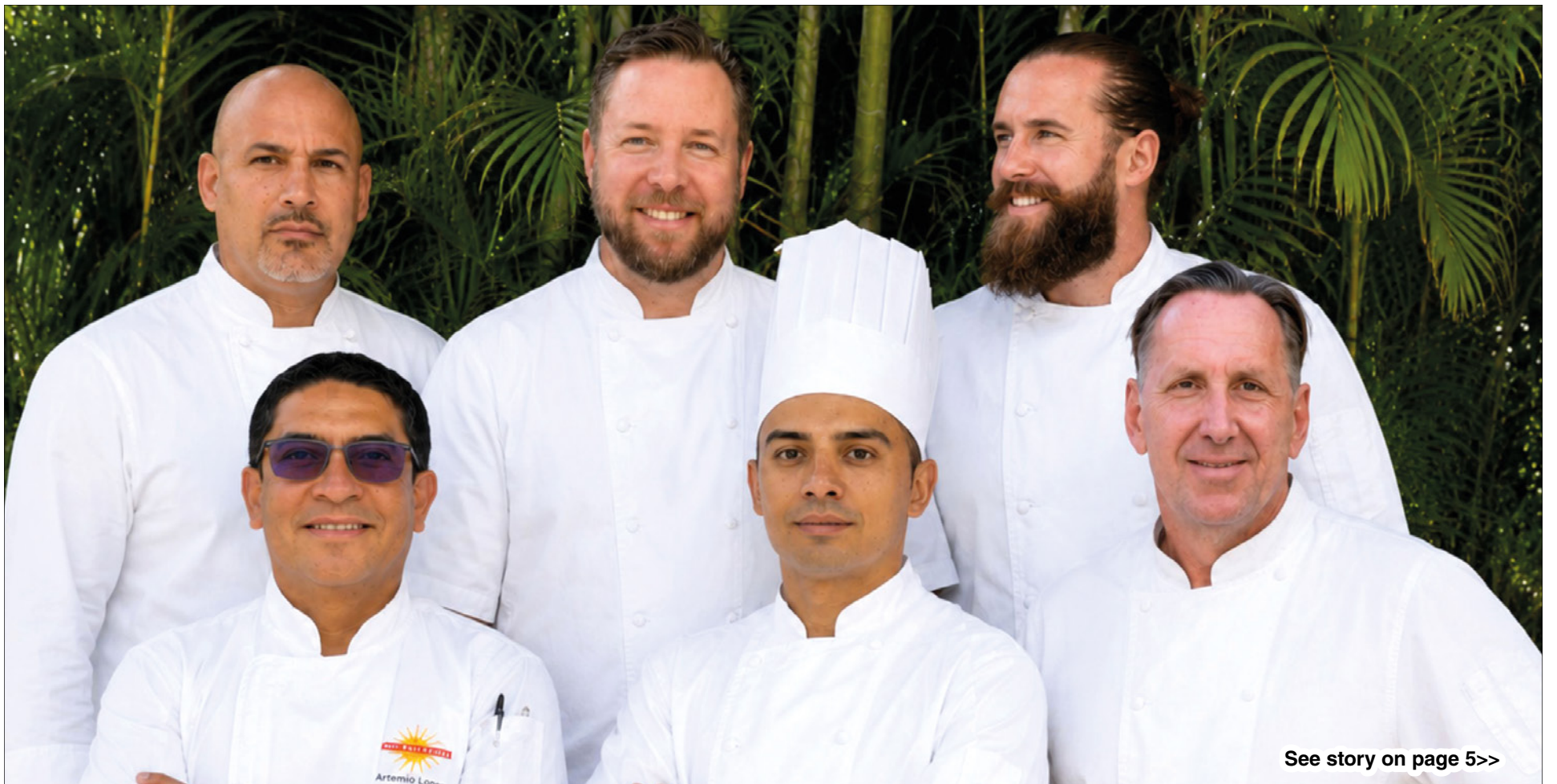
See story on page 5>>