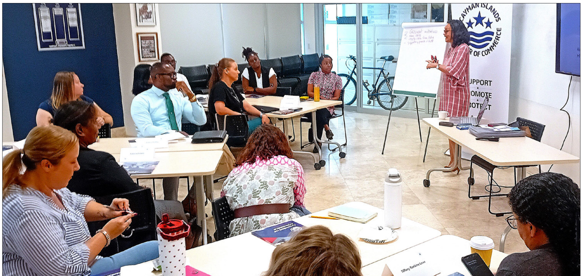
► Creating a culture of Wellbeing and Wellness – at the Chamber of Commerce

The strong turnout highlights a growing recognition across the Cayman Islands of the importance of prioritising wellbeing—not only for individual health, but for organisational performance, resilience and long-term success.