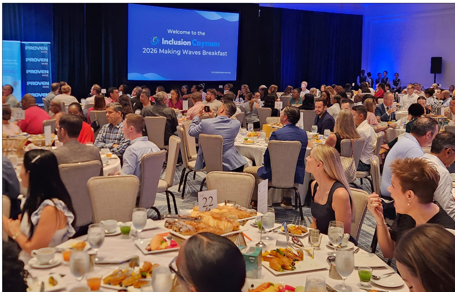
► The 8th annual 'Making Waves Breakfast' was held at the Ritz Carlton, Grand Cayman on 11th June, 2026.

Friendship changes lives, she said, pointing out that with the help of Minister Rolston Anglin and the Ministry of Education, the Best Buddies programme will be launched at schools across the Cayman Islands.