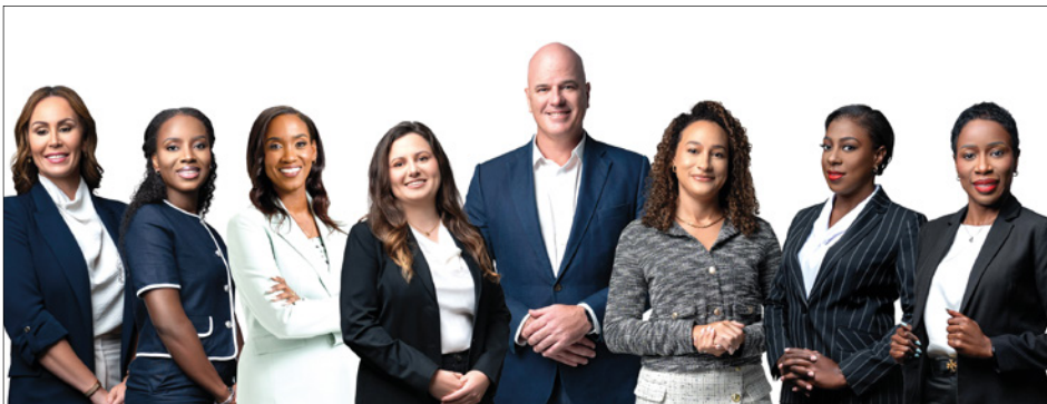
SEE RF STRENGTHENS REGIONAL LEADERSHIP, PAGE 3